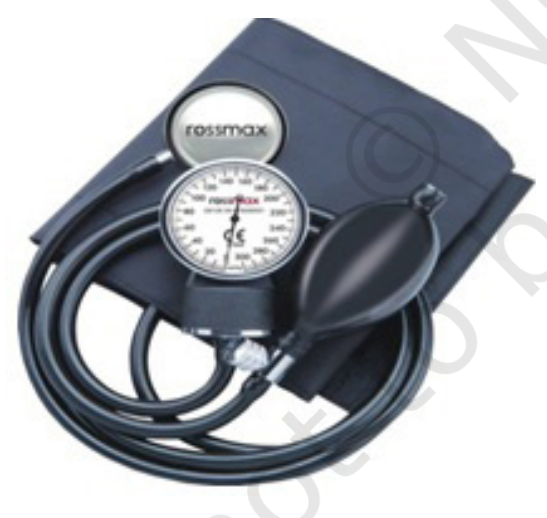
Fig. 3.3: Sphygmomanometer

of blood on the arterial wall recorded when ventricles relax is lowest (Diastolic Pressure).