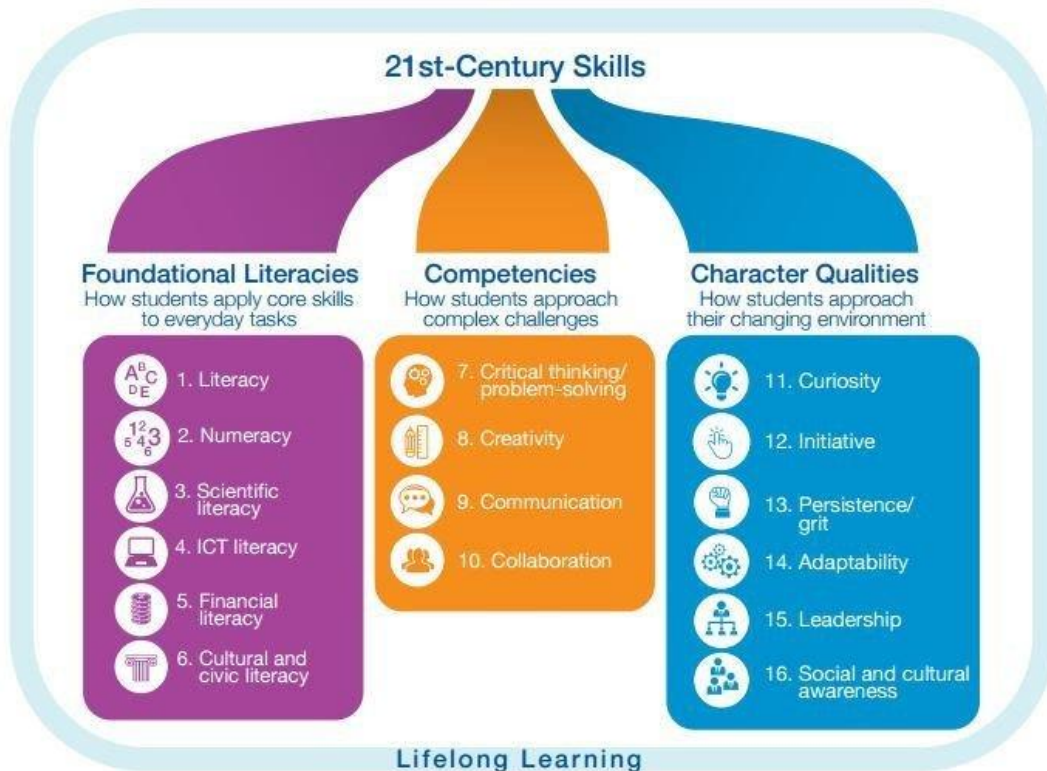
Exhibit 1: Students require 16 skills for the 21st century

Note: ICT stands for information and communications technology.