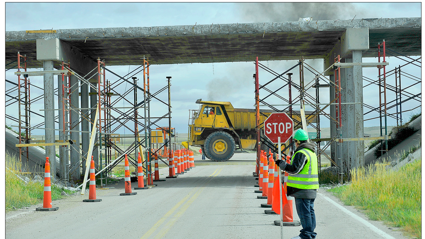
A flagger stops traffic while heavy equipment moves through a construction zone on Interstate 25 north of Wheatland in October of 2013.

A close call in a bridge construction zone on Interstate 80 near Cheyenne last year could have been much worse. When a tractor trailer driver didn’t slow down his vehicle from 75 mph to the reduced construction zone speed, he temporarily lost control of his vehicle, which partially drove up on a concrete barrier.