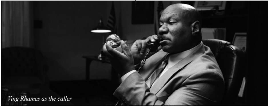
Ving Rhames as the caller