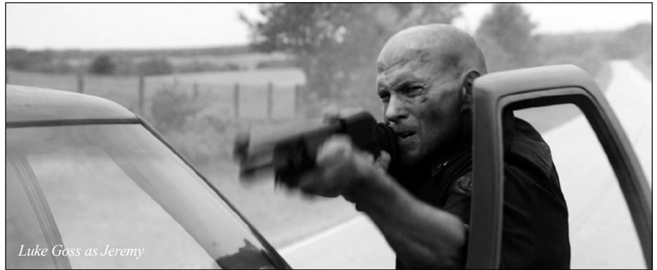
Luke Goss as Jeremy