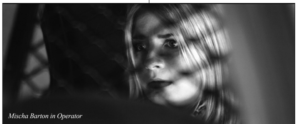
Mischa Barton in Operator