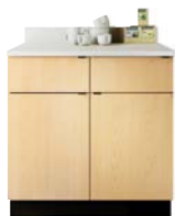
36" Space Maximize storage in small spaces with two above and below counter cabinets.