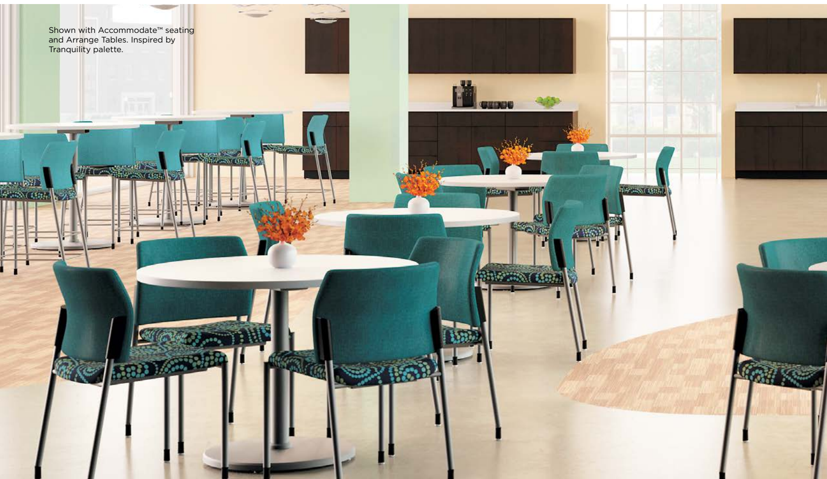
Shown with Accommodate™ seating and Arrange Tables. Inspired by Tranquility palette.