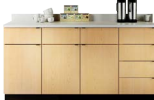
72" Space This four cabinet arrangement includes a four-drawer base cabinet that is ideal for storing utensils and supplies.