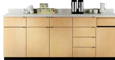
90" Space This fully-functional configuration is designed to serve all your needs, with ample cabinet and drawer storage and neatly concealed waste management.