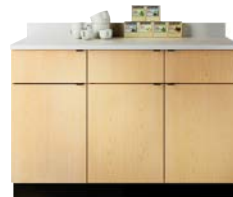
54" Space Expand the serving area and storage space with three above and below counter cabinets.