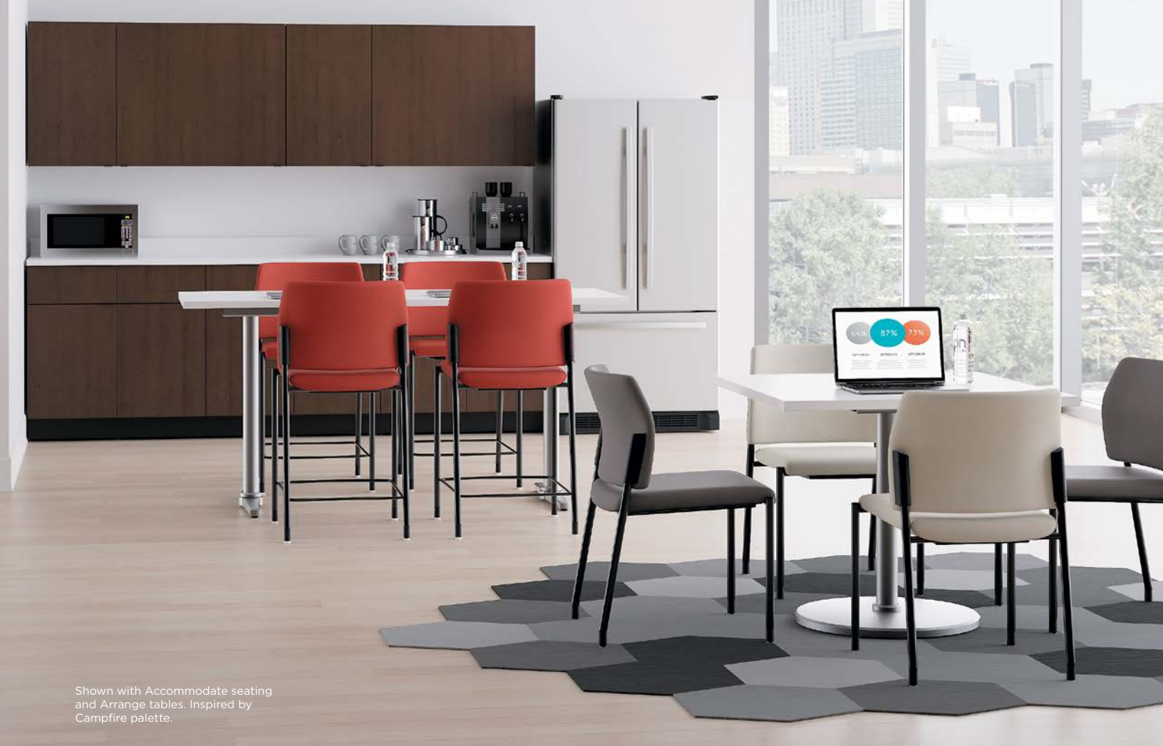
Shown with Accommodate seating and Arrange tables. Inspired by Campfire palette.