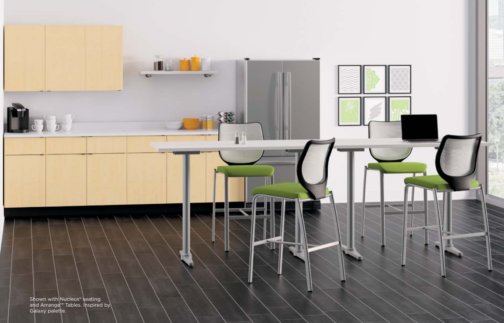
Shown with Nucleus® seating and Arrange™ Tables. Inspired by Galaxy palette.