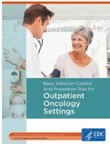
BICAPP can be used by any outpatient oncology facility to standardize and improve infection prevention practices.

EDUCATION AND TRAINING. All facility staff should receive appropriate education and training in infection prevention during orientation as well as annually and any time policies change. Competency evaluations of facility staff should be regularly conducted to