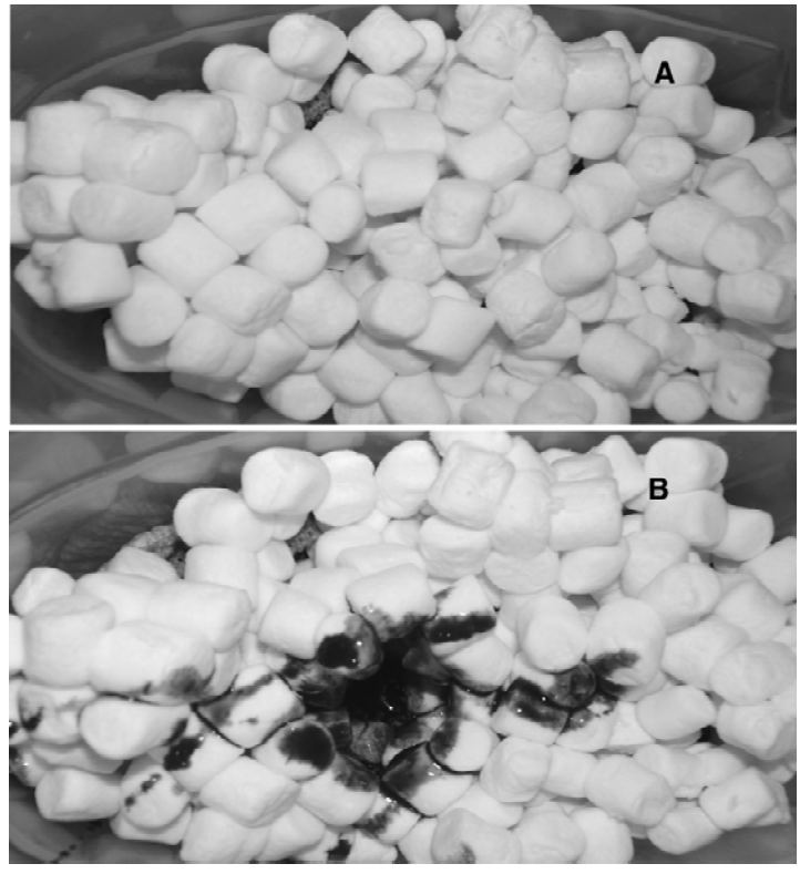
FIGURE 2. The surface layer is clean before drilling for oil (A). Students observed pumping resulted in leaks (B). This mimics oil spills occurring at older rusty derricks, or during the transport of oil.

layer. After completing their model construction, each student was then asked to draw and label his or her group's model. The teacher provided a list of defined vocabulary words for students to use in their models including oil reservoir, impermeable layer, topsoil and rocks.