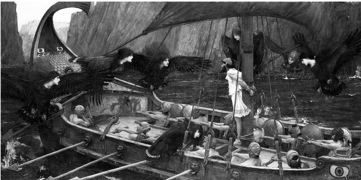
Ulysses and the Sirens by John William Waterhouse. In the public domain.