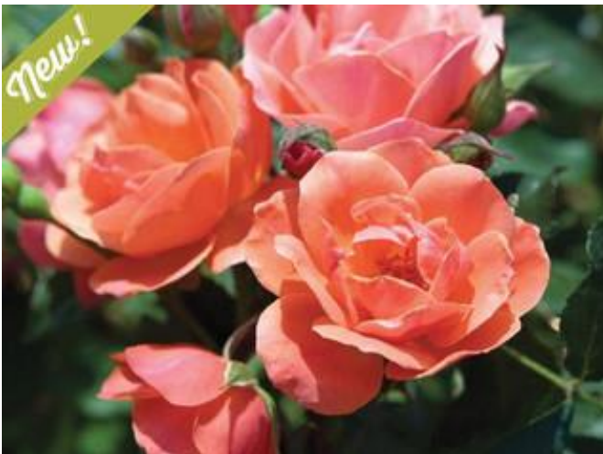
'Knock Out - Coral' ..... $24.99

4'H - 2004 - light pink - own root A beautiful, carefree rose with all of the great qualities of its parent, 'Knock Out', and soft, light pink flowers that fade to shell pink as they mature. Medium green leaves. Thrives in humid climates.