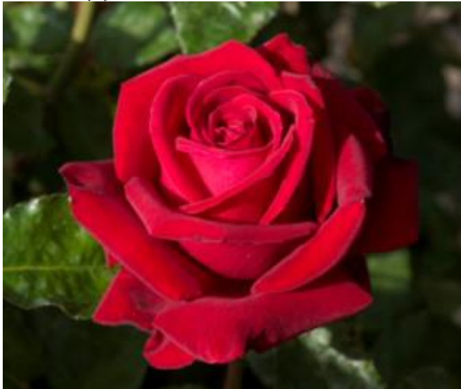
'Ingrid Bergman' ..... $24.99

2-3'H - 1980 - red - grafted An elegant, large flowered, velvety red rose. Each flower has 30-35 petals and are held on long sturdy stems. Strong fragrance. Dark green foliage.