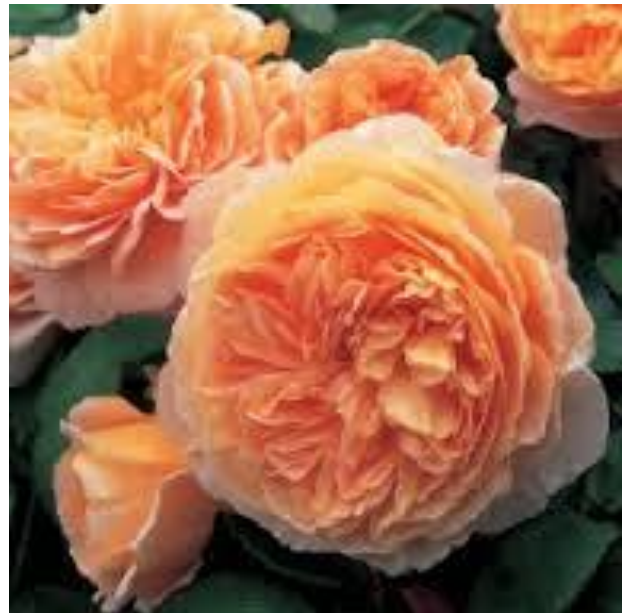
'Crown Princess Margareta' .. $34.99

3'H - 2012 - pink - own root Rich salmon, beautifully formed, English Roses. They emerge as red buds which open to pretty cups the eventually become classic rosettes. Medium-strong myrrh fragrance with hints of pear and almond. Dark green glossy foliage. Very vigorous.