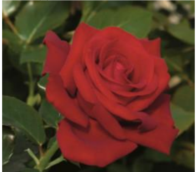
'Drop Dead Red' ..... $29.99

3-4'H - 2010 - red - grafted Flower color is an intense red velvet. Color holds through its entire bloom life. The medium sized, double flowers have a light "tea rose" scent.