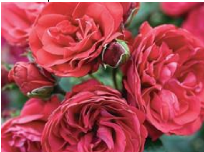
'Crimson Sky' ..... $29.99

8-10'H - 1958 - dark red - grafted This pillar blooms heavily with large, deep red, strong damask scented flowers with 35 petals.