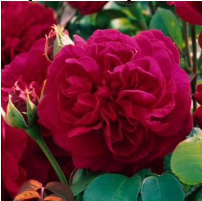
'Tess of the D'Urbervilles' ... $34.99

10'H - 2002 - pink - grafted An award winner! Fragrant, cupped rosettes are of superb quality. Beautiful from bud to bloom, the pure rose pink flowers have a strong myrrh fragrance. Extremely healthy and vigorous with informal growth.