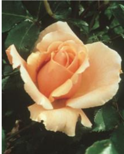
'Just Joey' ..... $24.99

3'H - 1972 - orange blend - grafted This attractive and distinctive variety from England has elegant, pointed buds of apricot with 25-30 waved petals, which pale toward the edges. Fruity fragrance. The flowers remain pleasing to the end. Growth is medium and bushy, with dark matte leaves.