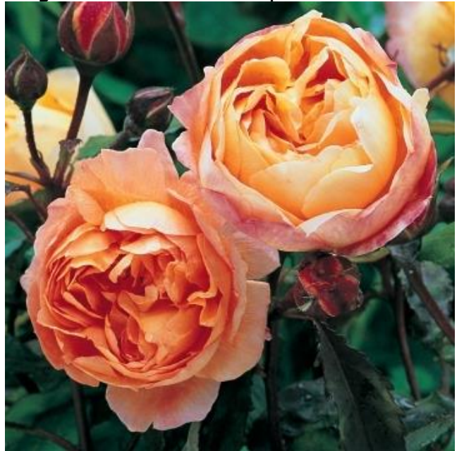
'Lady Emma Hamilton' ..... $34.99

Repeat bloomer. Very large, domed flowers are a rich salmon-pink - an unusual color. They have an exceptionally delicious and strong fragrance. It is ideal for pots and containers.