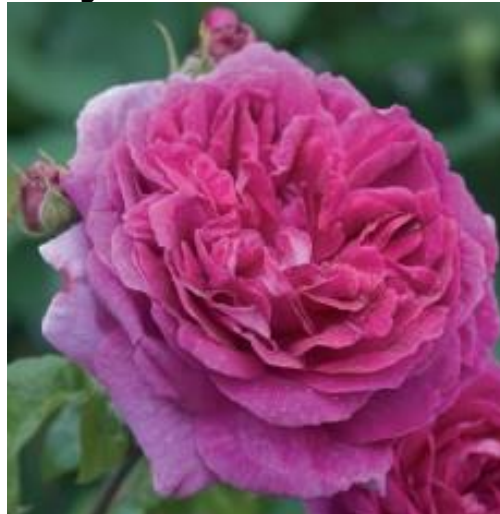
'Young Lycidas' ..... $34.99

2-3'H - white - grafted Stunning pure white blossoms with a hint of blush at the center. The 3½ inch blossoms are fragrant and very double with 60-90 petals. Rich green leaves.