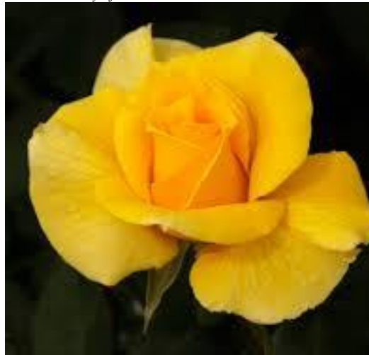
'Midas Touch' ..... $24.99

3'H - 1992 - golden yellow - grafted Golden yellow flowers with a fruity fragrance. It is quick to repeat, flowering freely over a long period. Flowers have 20-25 petals and are good for cutting. Matte green leaves. 1994 AARS winner.