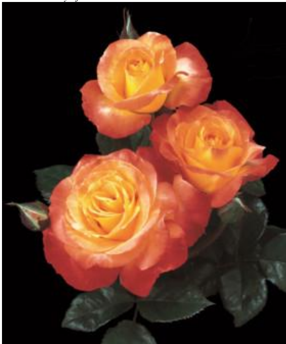
'Chihuly' ..... $29.99

3'H - 2004 - yellow/orange/red - grafted The dazzling flowers blush from apricot yellow to orange to deep red. They have 25-30 petals and a mild tea scent. Deep green leaves and dark red new growth. Honors the famous glass artist, Dale Chihuly.