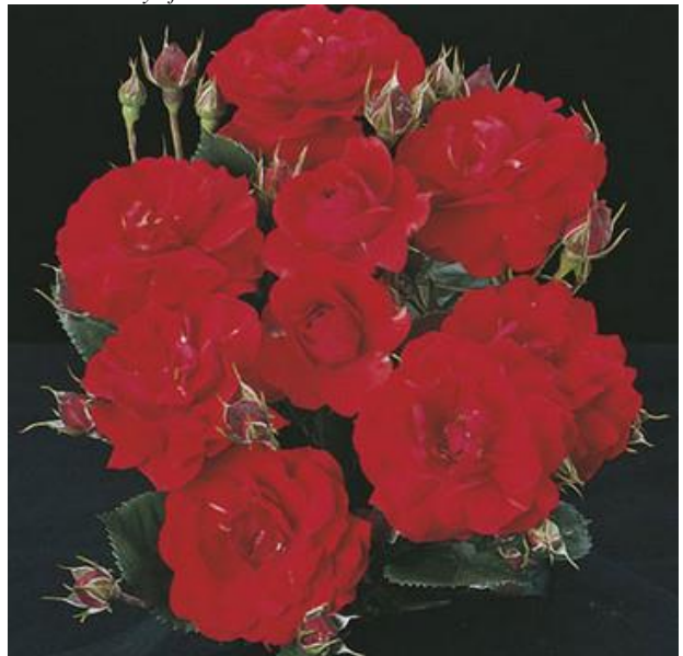
'Showbiz' ..... $24.99

2-3'H - 1985 - red - grafted Large clusters of fire engine red flowers on a low, compact, bushy plant. 20-25 petals with a light fragrance. Glossy dark green leaves with excellent disease resistance. Great in mass plantings.