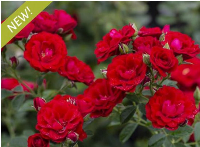
NEW 'Cherry Frost' ..... $29.99

6½'H - 2019 - cherry red - own root A repeat bloomer with abundant clusters of beautiful small cherry red flowers. It reblooms throughout the entire growing season. Superior disease resistance.