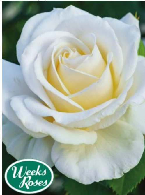
'Easy Spirit™' ..... $29.99

2-3'H - 2018 - white - grafted Part of the Easy to Love® collection from Weeks Roses. Large, 3½" - 4½", white flowers have a cream base. They hold their form well throughout their entire bloom cycle as well as cut. Easy to grow.