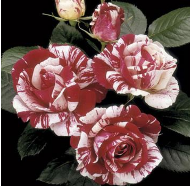
'Scentimental' ..... $29.99

3'H - 1997 - burgundy red/creamy white - grafted Each petal is like a snowflake; no two are alike. The large flowers are creamy white, striped, and splashed with burgundy red. Strong, sweet, spicy scent. Vigorous growing rose. 1997 AARS winner.