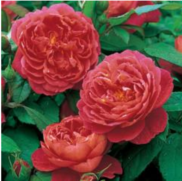
'Benjamin Britten'..... $34.99

4'H - 2002 - red - own root Deeply cupped red flowers with a touch of orange. Intense fruity fragrance. Vigorous habit, with dense growth and lush leaves. Named in honor of the famous English composer, conductor and musician.