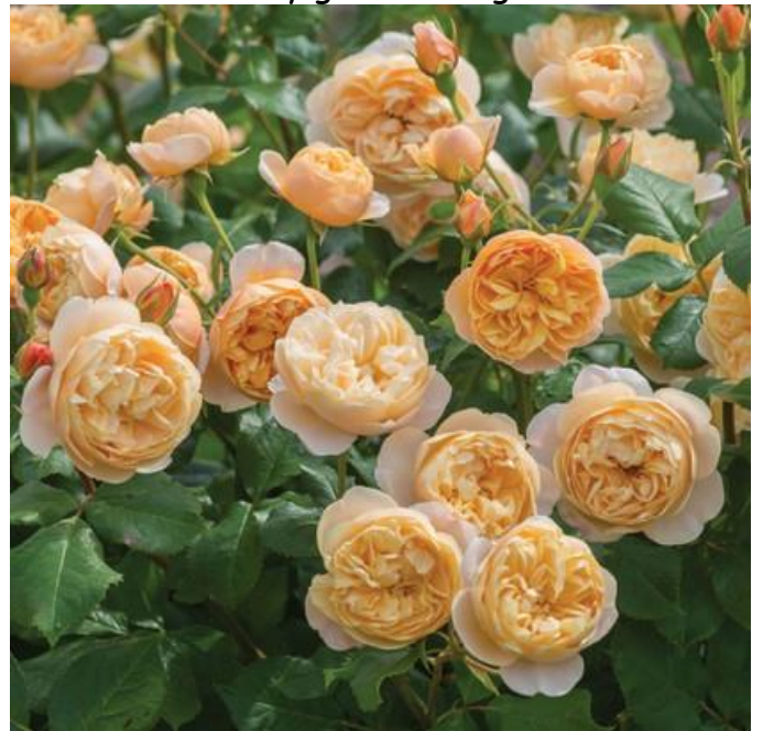
NEW 'Roald Dahl' ..... $34.99

4'H - 2014 - yellow - grafted Yellow flowers have a pleasing formation - neat outer ring of petals enclosing an informal group of petals. Its strong yellow coloring is unfading. Richly fragrant with lemony undertones. Shiny green foliage.