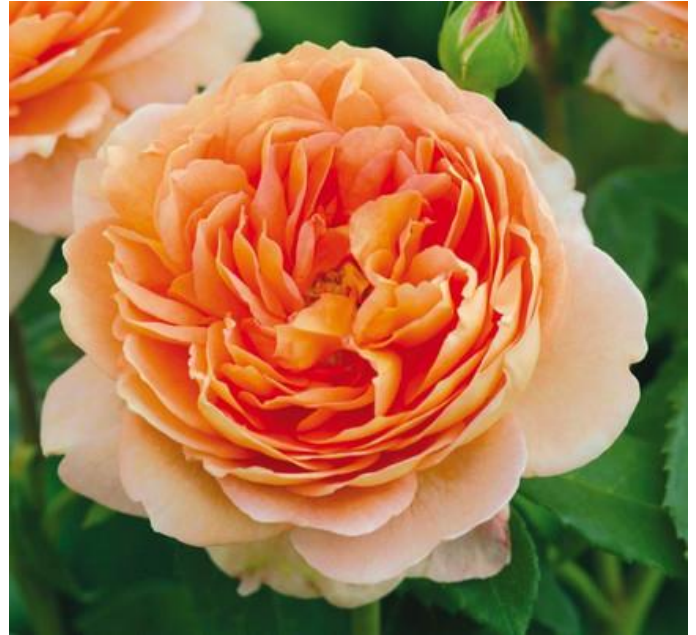
'Carding Mill' ..... $34.99

4'H - 2002 - red - own root Deeply cupped red flowers with a touch of orange. Intense fruity fragrance. Vigorous habit, with dense growth and lush leaves. Named in honor of the famous English composer, conductor and musician.