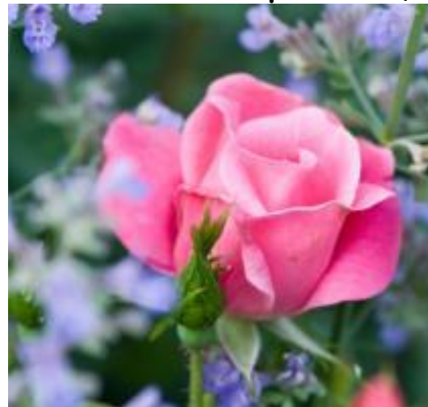
'Knockout - Pink' ..... $24.99

3-4'H - 2005 - cherry red - own root All of the great qualities of the 'Knockout' rose with improved winter hardiness and shade tolerance, more prolific blooming, and double flowers. The 2½" flowers are borne 3-6 on a stem and have 18-25 petals. The vivid cherry red flowers appear almost fluorescent. The lush leaves are burgundy red when new, and turn red again in fall. This carefree rose has a dense, compact habit. Bright orange-red hips in winter. Also available in 19CM pots for $19.99.