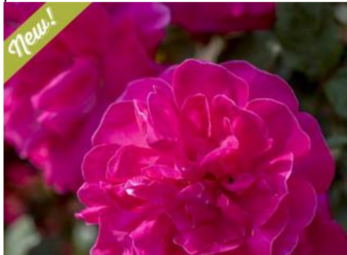
'Highwire Flyer™' ..... $29.99

8-12'H - 2007 - red - own root Large, soft flowers of deep non-fading red. They have 28-35 slightly cupped petals with a light apple scent. Dark green leaves. Quick to establish.