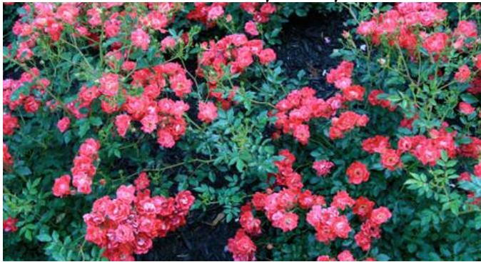
'Drift - Red' ..... $24.99

18"H x 36"W - 2006 - peach - own root Cup-shaped flowers of bright peach apricot cover the plant from spring into fall. 15-20 petals per flower. Small, semi-glossy dark green leaves with very good disease resistance. Rounded, very bushy habit.