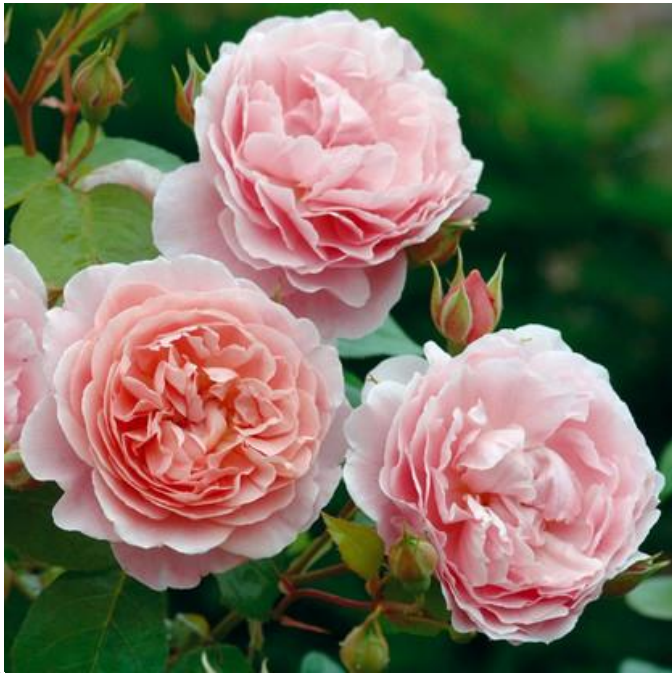
NEW 'Strawberry Hill' ..... $34.99

10'H - 2002 - pink - grafted An award winner! Fragrant, cupped rosettes are of superb quality. Beautiful from bud to bloom, the pure rose pink flowers have a strong myrrh fragrance. Extremely healthy and vigorous with informal growth.