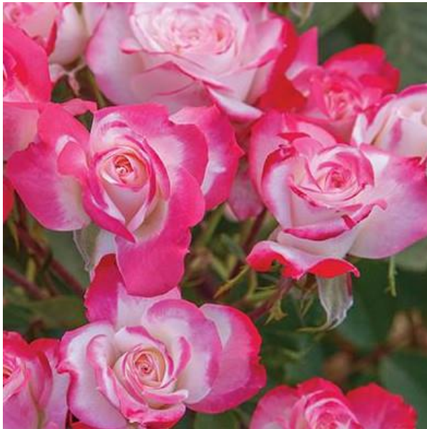
'Candy Cane Cocktail™' ..... $29.99

3½-4'H - 2016 - bicolor - own root White flowers with beautiful deep pink to red edges. Very showy. Its background includes the 'Knock Out' family of roses.