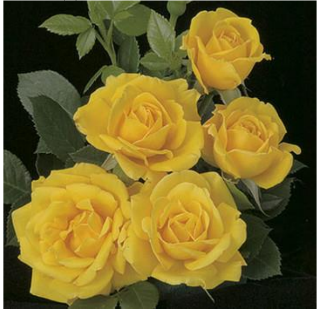
'Shockwave' ..... $29.99

3'H - 2009 - yellow - grafted Bright neon yellow flowers with about 25 petals and a light fragrance. The formal flowers are about 3½". Apple green leaves. Very rounded, bushy habit.