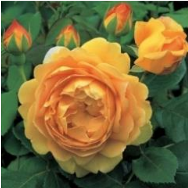
'Golden Celebration' ..... $34.99