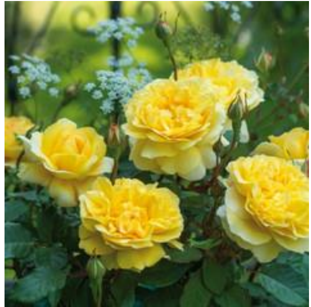
'The Poet's Wife' ..... $34.99

3½'H - pale pink - own root Named after the daughter of David Austin Jr. Pale but pure pink flowers have the beautiful old rose formation - prettily cupped buds gradually opening into shallow cupped rosettes. They measure 3½" across! The strong fragrance has a fruity tint.