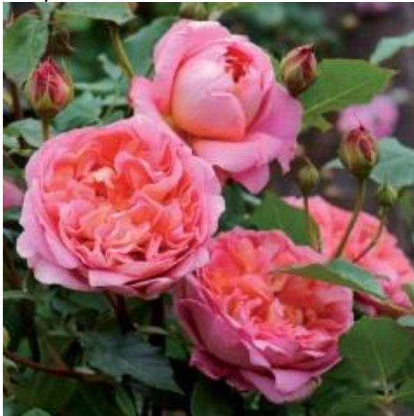
'Boscobel' ..... $34.99

4'H - 2004 - apricot - own root Showy, large blooms in shades of pink, apricot and yellow. Strong spicy scent. Repeat bloomer.