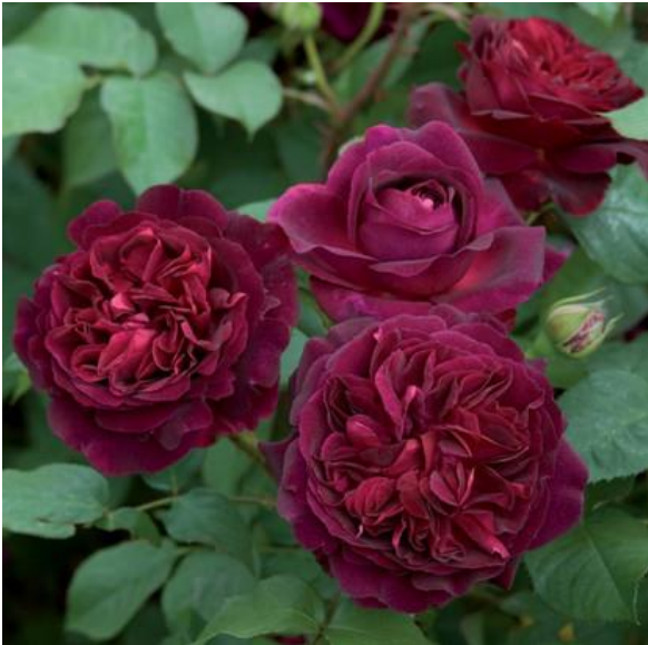
NEW 'Munstead Wood' ..... $34.99

3'H - 2007 - crimson - own root Light crimson buds become deep velvety crimson petals forming large, shallow cupped flowers. Strong, old-rose fragrance with a fruity note. Young leaves open bronze turning to a medium green with age.