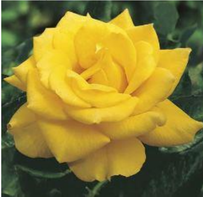
'Henry Fonda' ..... $24.99

4'H - 1996 - yellow - grafted Clear, distinctly yellow flowers have a light sweet fragrance. Deep green, clean foliage. A very "neat" rose which has proven itself over the years. Very vigorous.