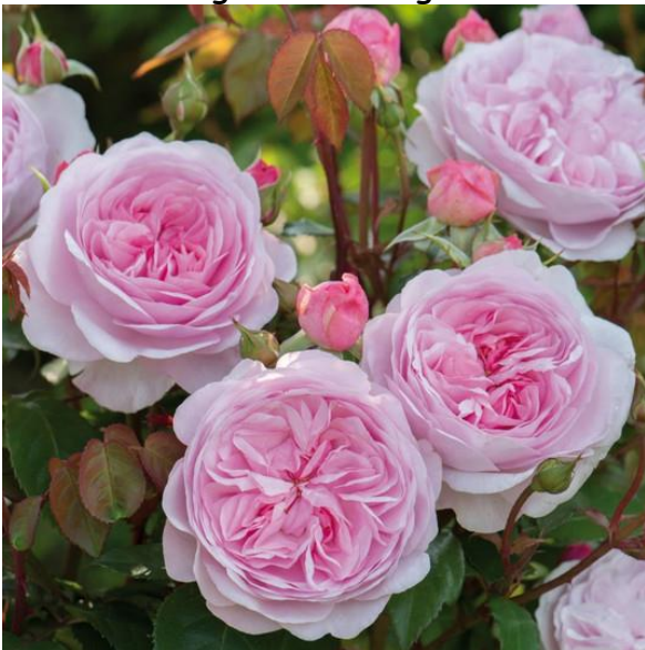
'Olivia Rose Austin' ..... $34.99

3'H - 2007 - crimson - own root Light crimson buds become deep velvety crimson petals forming large, shallow cupped flowers. Strong, old-rose fragrance with a fruity note. Young leaves open bronze turning to a medium green with age.