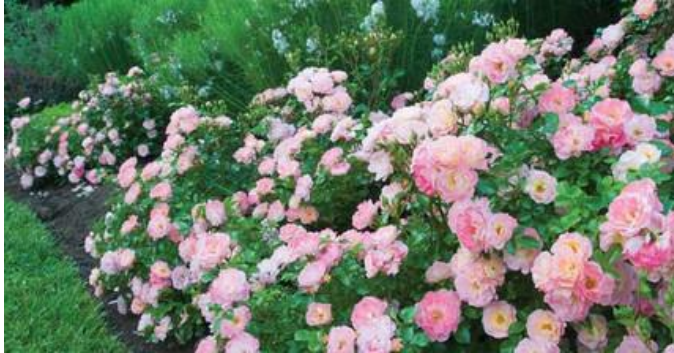
'Drift - Peach' ..... $24.99

Very hardy, requiring at the most a good mulching for winter protection. This is the fastest growing class of roses - popularity wise. Their ease of maintenance and prolonged flowering period accounts for some of the resurgence in the rose industry. Excellent for hedges and landscape plantings.