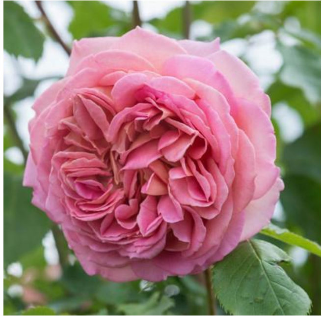
NEW 'Jubilee Celebration' ..... $34.99

Medium sized, cupped flowers. These rich, pure yellow blooms have a fresh "tea rose" fragrance. Upright, bushy habit