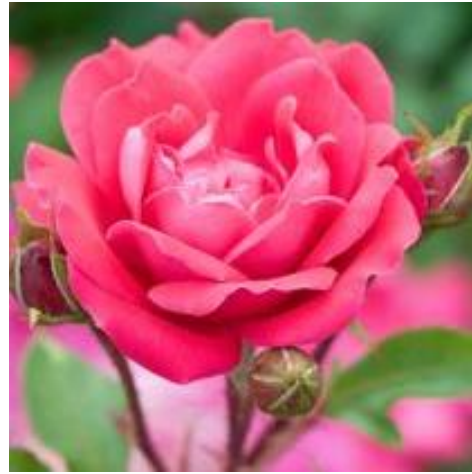
'Knockout - Double' ..... $24.99

4½'H - 2007 - coral - own root A beautiful, carefree rose with all of the great qualities of its parent, 'Knock Out', with unique coral flowers. Young leaves are bronze red becoming mid green. Thrives in humid climates.