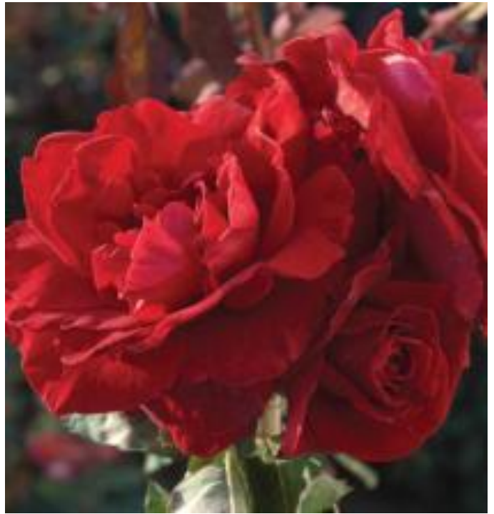
'Don Juan' ..... $24.99

6½'H - 2019 - cherry red - own root A repeat bloomer with abundant clusters of beautiful small cherry red flowers. It reblooms throughout the entire growing season. Superior disease resistance.