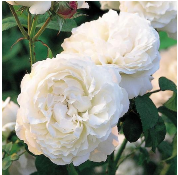
'Winchester Cathedral' ..... $34.99

4'H - 1998 - crimson - grafted Large, bold, deeply cupped crimson red flowers. Strong "old rose" fragrance. Flowers freely.