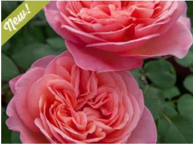
'Sweet Mademoiselle' ..... $29.99