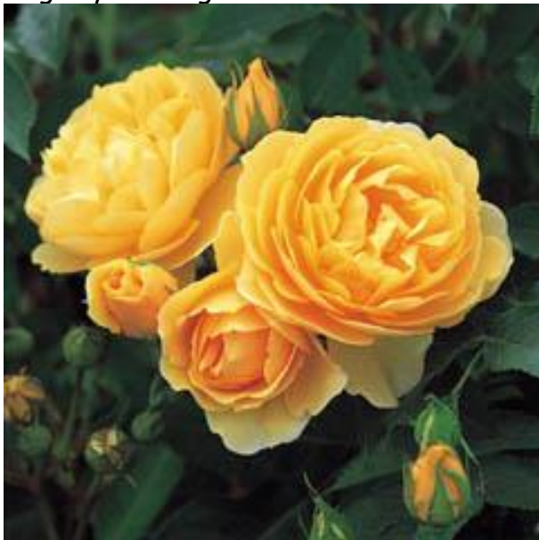
'Graham Thomas' ..... $34.99

It is one of the largest-flowered David Austin English Roses. Rich golden yellow flowers are in the form of a giant, full-petaled cup. The flowers are initially Tea-scented but often develop a wonderful combination of sauterne wine and strawberry. Slightly arching.