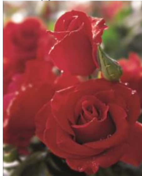
'Veteran's Honor' ..... $29.99