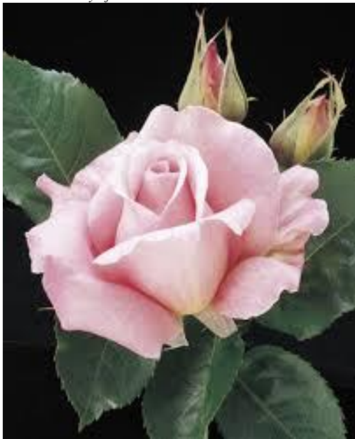
'Tiffany' ..... $24.99