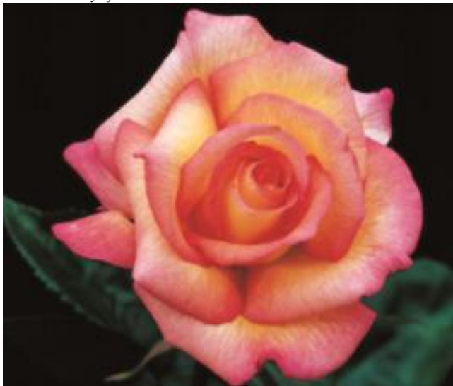
'Sheila's Perfume' ..... $24.99

2½'H - 1985 - yellow/red - grafted A vigorous, upright shrub. Gorgeous clusters of bright yellow, double flowers, edged in red and very fragrant. Flowers continuously throughout summer. Dark green glossy leaves. Deadhead after flowering.