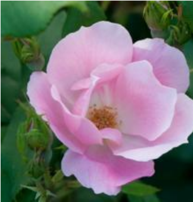
'Knock Out - Blushing' ..... $24.99

4'H - 2004 - light pink - own root A beautiful, carefree rose with all of the great qualities of its parent, 'Knock Out', and soft, light pink flowers that fade to shell pink as they mature. Medium green leaves. Thrives in humid climates.