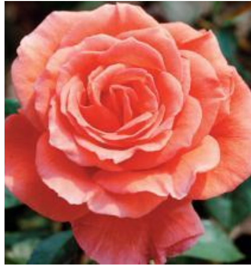
'Tropicana' ..... $24.99

Flower color is phlox pink with a yellow base. The large double flowers have a strong fruity fragrance. Performs well. Upright.