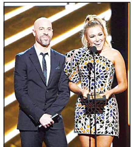
Chris Daughtry (left) and Rachel Platten speak onstage.