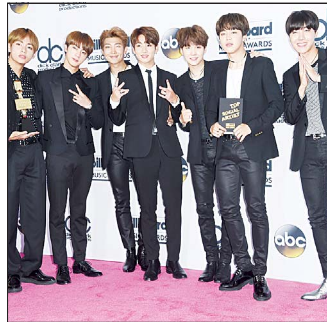
BTS, a South Korean band, pose in the press room with the award for top social artist.