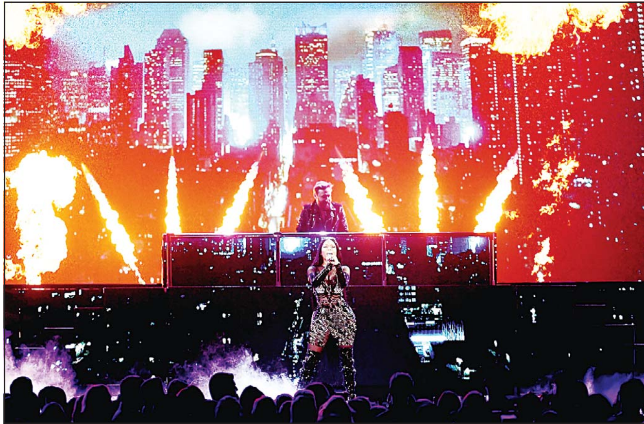
DJ David Guetta (top), and rapper Nicki Minaj perform onstage during the 2017 Billboard Music Awards at T-Mobile Arena on May 21 in Las Vegas, Nevada.