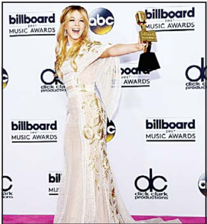
Lindsey Stirling, winner of Top Dance/Electronic Album award for 'Brave Enough'.