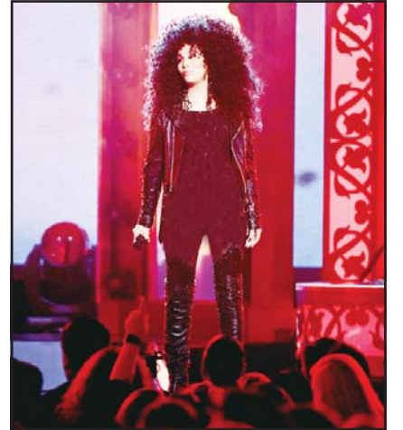
Cher performs onstage.