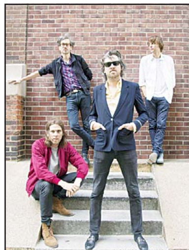
Members of French rock band Phoenix (left to right), Deck d'Arcy, Laurent Brancowitz, Christian Mazzalai and Thomas Mars pose for a picture after an interview with AFP on May 17, in New York.

And it was the year Bob Dylan and the backing musicians who would name themselves the Band quietly gathered at a pink house outside of Woodstock, New York, and recorded dozens of songs that were the birth of "roots music" and the foundation for rock's most famous bootleg, "The Basement Tapes."