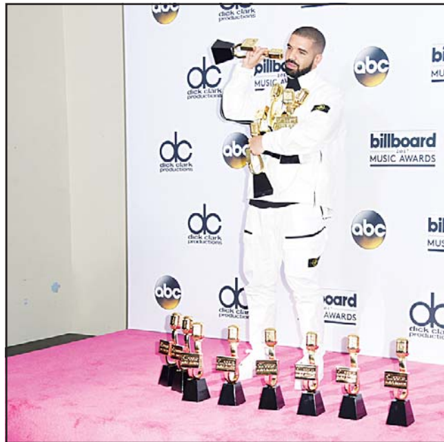
Drake poses in the press room with his 13 awards.