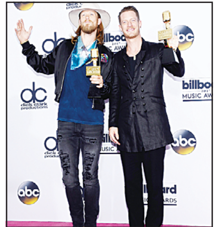
Brian Kelley (left), and Tyler Hubbard of Florida Georgia Line, winners of the Top Country Song award for 'H.O.L.Y.'.