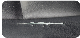
Interior cuts, burns, or stains

Photos are examples only. Covered wear and use items must be within plan limits.