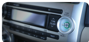
Missing parts or equipment

This protection plan is only available when you lease your new Toyota. 3