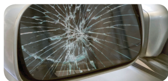
Broken or scratched windshield, windows, mirrors or lights