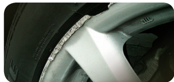
Damage to tires, rims or hubcaps