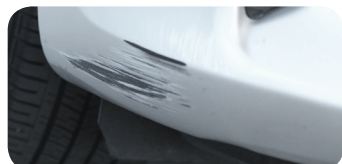
Damaged bumpers, body dents, dings or scratches