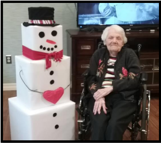
Virginia, poses with winter arts & crafts project, Frosty the Snowman!