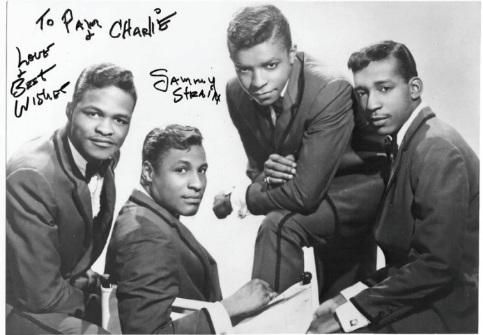
LITTLE ANTHONY AND THE IMPERIALS

Claridge Casino Hotel Because smaller is friendlier.