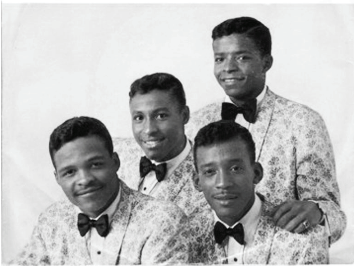
“Hurt So Bad” Picture Sleeve, 1965.

written and recorded – “Hurt So Bad”. This time they had the help of a third writing partner, Bobby Hart. Born Robert Harshman, Hart would later find fame as one half of the writing and recording duo, Boyce and Hart. Bobby Hart and Tommy Boyce would write most of the hits for the Monkees.