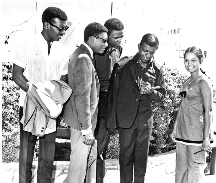
Little Anthony & Imperials signing autographs at the Flamingo Hotel & Casino, Las Vegas, 1964.

On April 22, 1964, Little Anthony & the Imperials were brought into the studio for their first DCP recording session. "When we did the Murray the K Shows we didn't have a