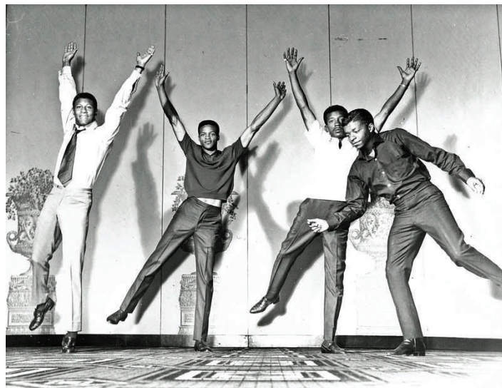
Little Anthony & Imperials rehearsing choreography at the Flamingo Hotel, 1965. Left to right: Sammy Strain, Ernest Wright, Clarence Collins, Anthony Gourdine.

“When we did the single, ‘I’m On The Outside (Looking In),’ remembered Sammy, “I think we did maybe two to four tunes. Basically it was like the other recording sessions that I had done. But here’s where it took a different tone. Af-