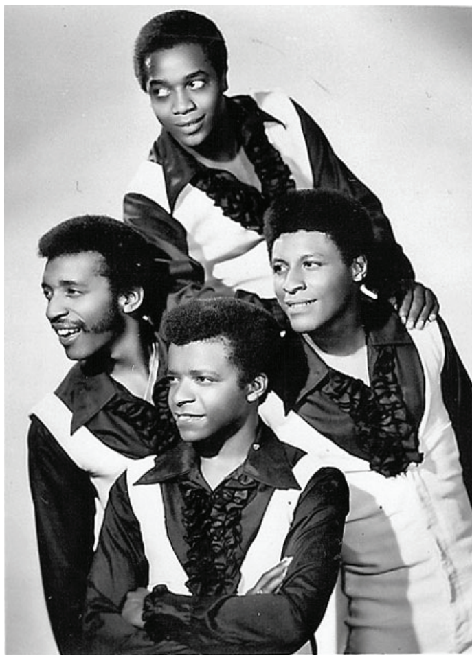
Little Anthony & Imperials, 1969. Clockwise from top: Kenny Seymour, Sammy Strain, Anthony Gourdine, Clarence Collins.

1969 also saw the Imperials move from Veep to the parent label, United Artists. They recorded the album "Out Of Sight Out Of Mind" which included some remakes of older tunes as well as some new songs. Released as a single, "Out Of Sight Out Of Mind," a remake of the Five Keys song, landed them back on the charts, peaking at #52. "The Ten Commandments Of Love," the Moonglows tune, also charted as a single at #82. "Out of Sight Out Of Mind" and "Ten Commandments of Love" were songs that we loved and admired when we were teenagers and we just wanted to put them on the album," said Sammy. "They hadn't been done in years and we thought we'd