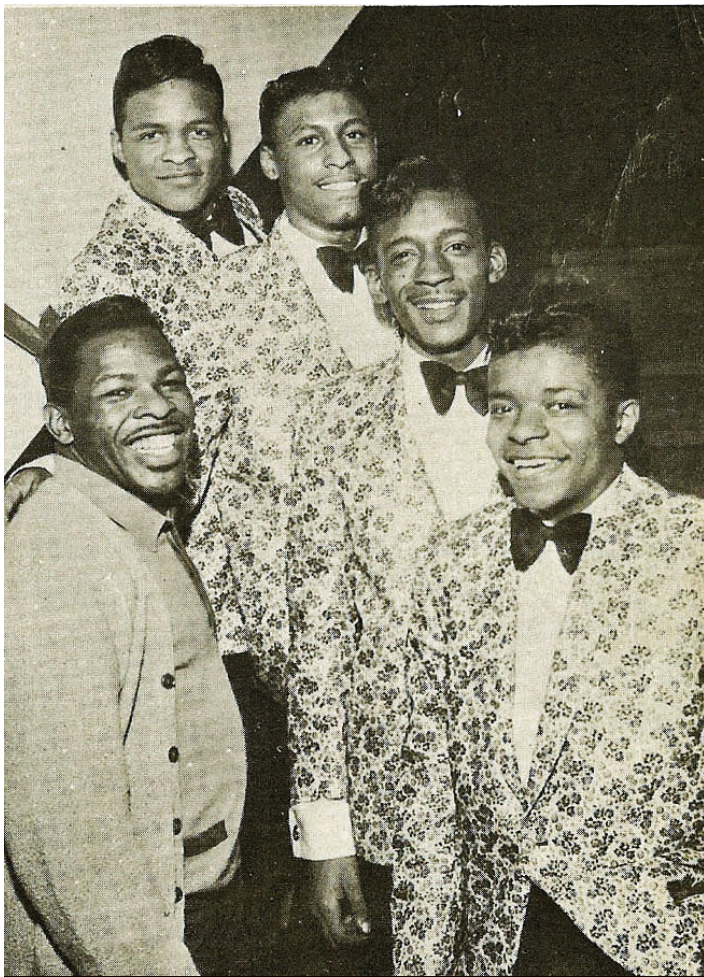
Little Anthony & Imperials with Lloyd Price (lower left) at the Brooklyn Fox, December 1963.

Anthony & the Imperials had not recorded in awhile, they began with their classic "Tears On My Pillow". The stage was completely dark as the Imperials entered singing with all that could be seen was their florescent white gloves and shoes. They'd close with a frantic "I'm Alright," complete with tightly choreographed dancing and splits. The stage shows would run for ten days with four or five shows a day. Lines to get into the Brooklyn Fox usually stretched around the block with some teenagers waiting in line at five o'clock in the morning to get the best seats. While the Imperials would eventually do five Murray The K Brooklyn Fox stage shows, they chose to retain that fourth spot in the line up, even when their hit records moved them up to much higher billing.