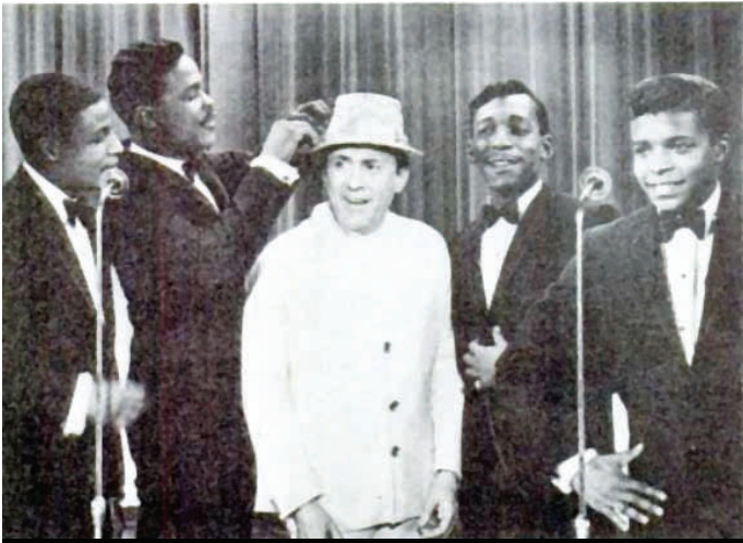
Little Anthony & Imperials joking with Murray the K (center) during the taping of his TV special.

(Dec. 3) and three appearances on Where The Action Is (Oct. 18, Nov. 18 and Dec. 17). In February 1966, Little Anthony & the Imperials appeared on Murray The K's two-hour TV special for WNEW-TV in New York. Also on the show were the 4 Seasons, Jay & the Americans, the 4 Tops, the Ramsey Lewis Trio, the Shangri-Las, Joe Tex and the Byrds.