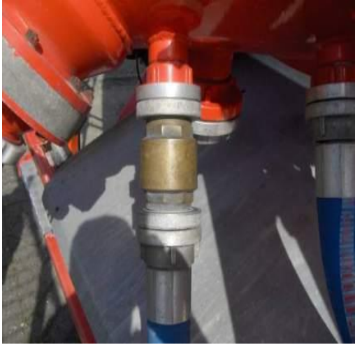
E62 Cleaning of air-manifold