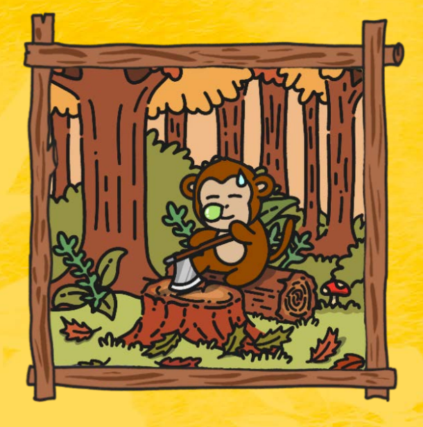
EXPLORING AND GATHERING MARCH 2022

Genesis Monkes are guaranteed to earn $CMB based on their rarity. The earn rates for Baby Monkes, are influenced by their ingame status. Happy Health baby means more $CMB.