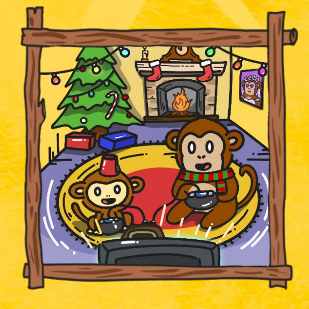
PLAYGROUND JUNE 2022

Utilize the collected resources to build the coolest treehouse and develop your plot. Plant seeds gathered out in the world to raise crops on your land, adding another stream of income for your Monkes.