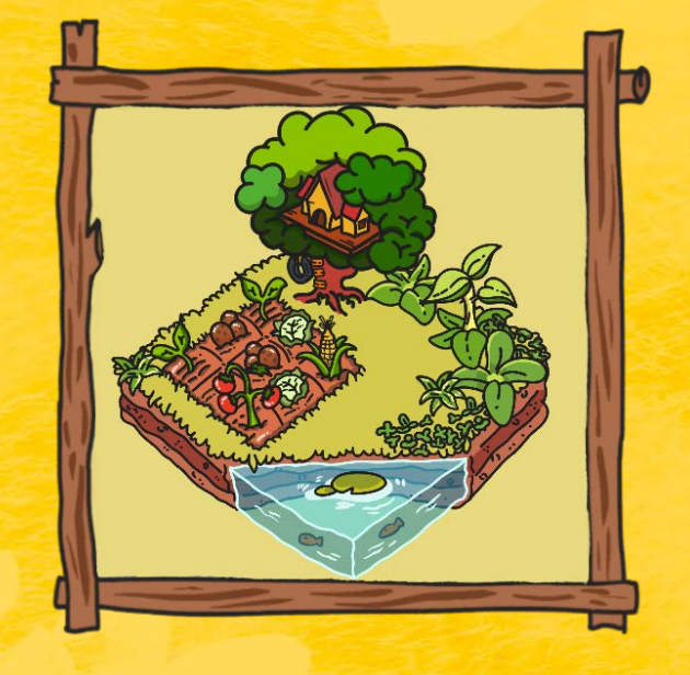
PLOTS, TREEHOUSES, AND FARMING APRIL 2022

Chop, mine, and scavenge resources from across Monke World. Complete quests to obtain rare and limited items. Our Metaverse will keep expanding, and we will be partnering up with your favorite NFT projects!