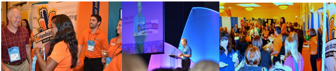
OrlandoJobs.com is a sponsor of the HR Florida Conference every year. (HRFlorida.org)

The "Orlando, You Don't Know the Half of It" slogan is accurate. Orlando is a vibrant city on the brink of really showing the world we are leaders in technology, healthcare, medical/military simulation and health sciences, along with our world-renowned reputation as the best in tourism and hospitality. The employers in this survey predict over 24,000 jobs will be added at their companies in 2017. That's a lot of opportunity!