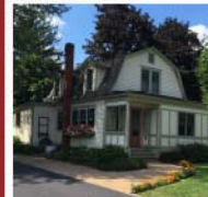
RESIDENTIAL EXTERIOR RENOVATIONS, NEW BUILDS, OUTDOOR SPACE/LANDSCAPING

~ Visit www.ballston.org for nomination forms or pick one up at the Village Office, 66 Front Street ~