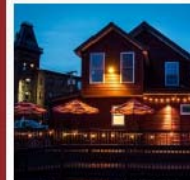
COMMERCIAL EXTERIOR RENOVATIONS, SIGNAGE, WINDOW DISPLAYS