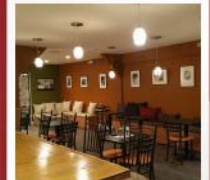
COMMERCIAL INTERIOR IMPROVEMENTS AND RENOVATIONS

Please contact the BSBPA at info@ballston.org or 885-2772 for more information