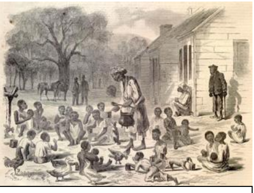
A slave distributing food to enslaved children

Slaves received only enough food to keep them alive. Most plantation owners gave a ration of food at the beginning of the week. It consisted of corn, fat, and