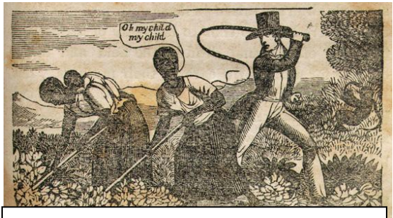
An overseer whipping a female slave.

had supper. They had to work without breaks. If they stopped or took a rest, they were punished by someone called the overseer. The overseer was in charge of the slaves. Slaves hated and feared the overseer. He carried a whip, and he used it frequently on the backs of the slave.