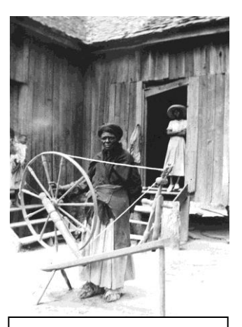
This slave was an artisan expert in sewing.

After 12 to 15 hours of work, the slaves could return to their cabins. Although they were tired, they still had to prepare their evening meals, tend to their children, <u>mend</u> their clothing, etc. Many slept very little when they had to work again.