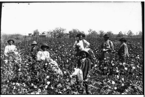
Slaves working in a cotton plantation.

In the morning, slaves worked in the fields. In the afternoon, they worked in the fields. And in the evening, they could be still working in the fields. This was true for the vast majority of slaves who worked on a large plantation. These slaves included children as young as five or six as well as the elderly.