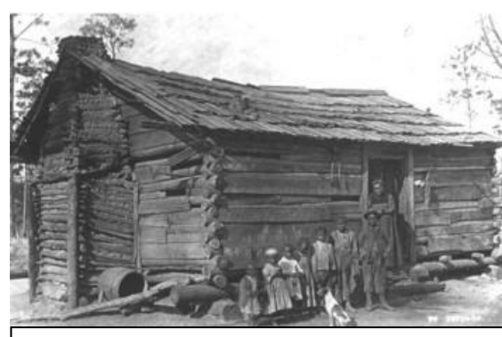
Slaves lived in cabins like this one in the picture.

Most slaves lived in one-room <u>cabins</u>. The cabins were made of logs. They were not well built. As a result, some roofs could not stop rain or snow. If a slave cabin had windows, it didn't have glass. When the rain and snow came in, the dirt floor of the cabin turned into mud. Slaves didn't have any furniture. They slept on a pile of rags or <u>straw</u>. Some were given a blanket; many were not.