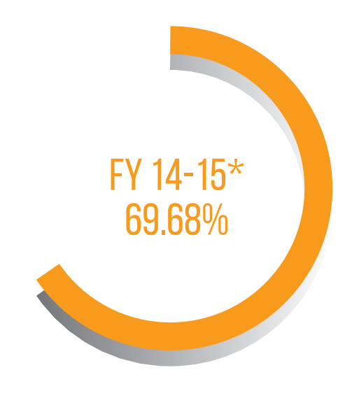
*FY14-15 is a baseline year due to modifications to survey