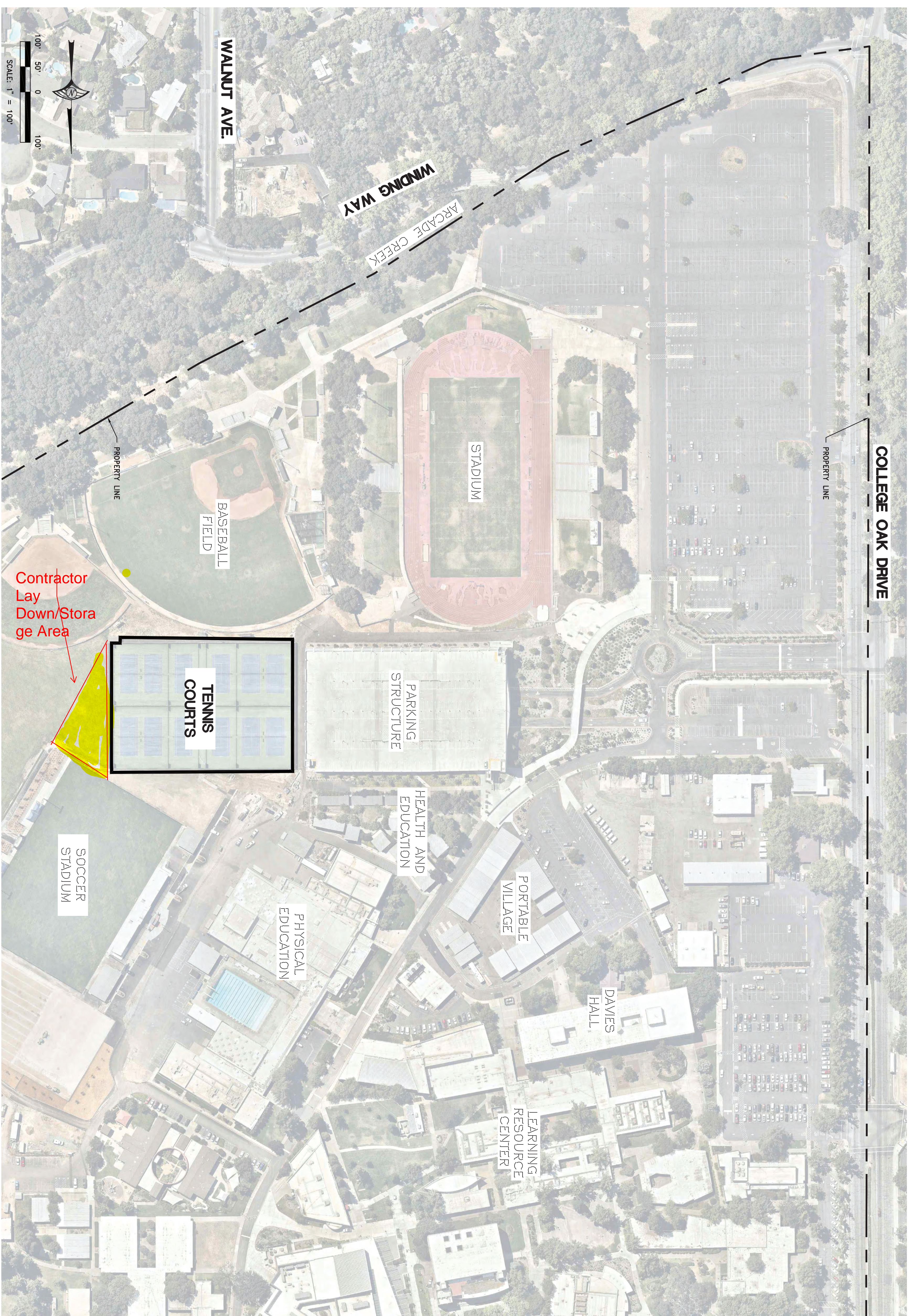
SITE PLAN SCALE: 1" = 100'