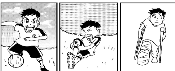
When the boy was playing football, he fell and he broke his leg.