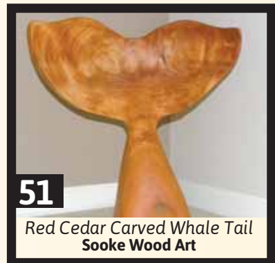
51 Red Cedar Carved Whale Tail Sooke Wood Art

DOOR PRIZE: $75 Summer Gift Basket from FARMER NOTARY