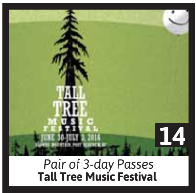
Pair of 3-day Passes Tall Tree Music Festival