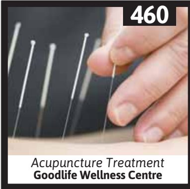
Acupuncture Treatment Goodlife Wellness Centre