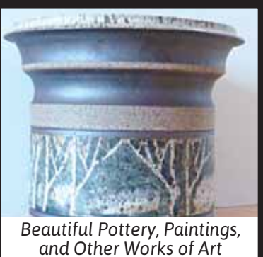
Beautiful Pottery, Paintings, and Other Works of Art

PLEASE NOTE: Silent Auction closes between 5:00-5:45, one table every 10 minutes