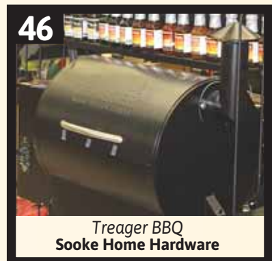
46 Treager BBQ Sooke Home Hardware