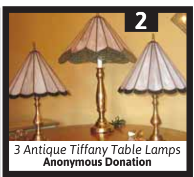
3 Antique Tiffany Table Lamps Anonymous Donation