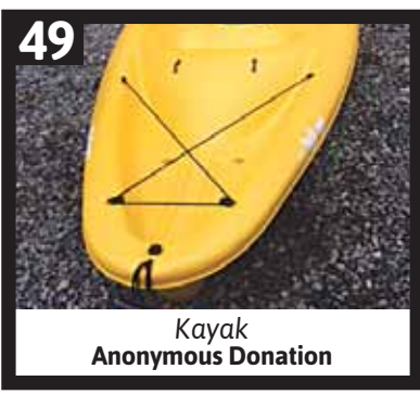
Kayak Anonymous Donation