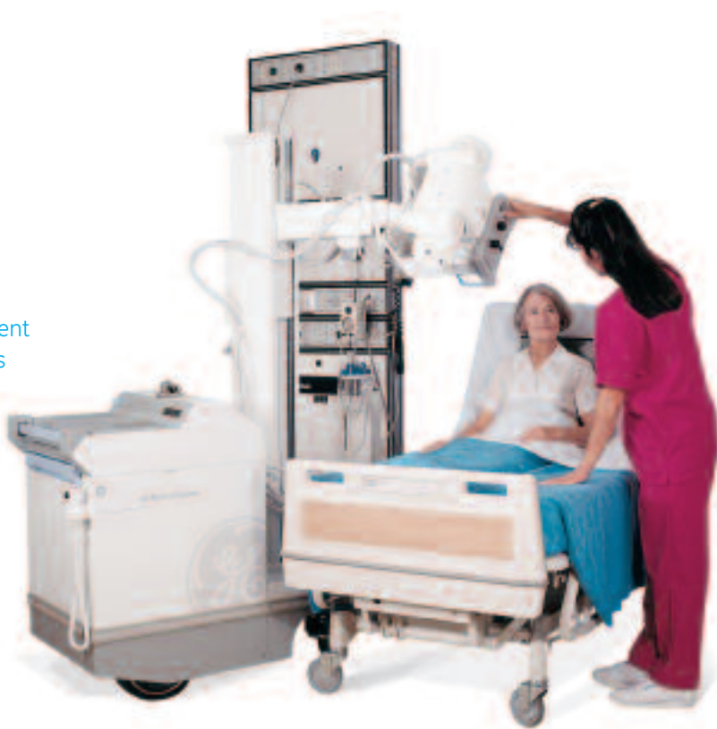
Fast set-up makes the AMX-4+ ideal for virtually any application.