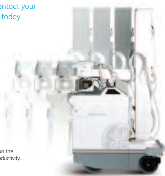
The AMX-4+ puts you on the fast track to greater productivity.