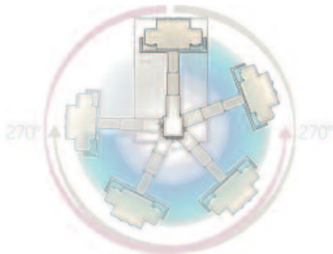
A full range of column motion allows for easy tube positioning.