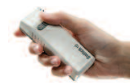
The optional cordless TechSwitch™ enables exposures from up to 35 feet away.