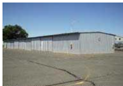
2804 W WASHINGTON AV YAKIMA, WA 98903