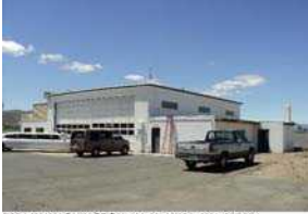
2804 W WASHINGTON AV YAKIMA, WA 98903