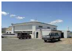
2804 W WASHINGTON AV YAKIMA, WA 98903