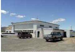
2804 W WASHINGTON AV YAKIMA, WA 98903