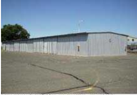
2804 W WASHINGTON AV YAKIMA, WA 98903