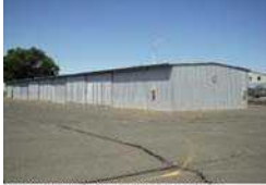
2804 W WASHINGTON AV YAKIMA, WA 98903