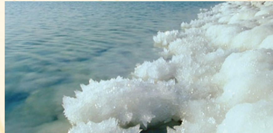
Prices listed are per pound and subject to change without notice.

Please be aware that Dead Sea salt is prone to absorbing moisture from the air. Be sure to store your salts in an airtight container to avoid clumping.