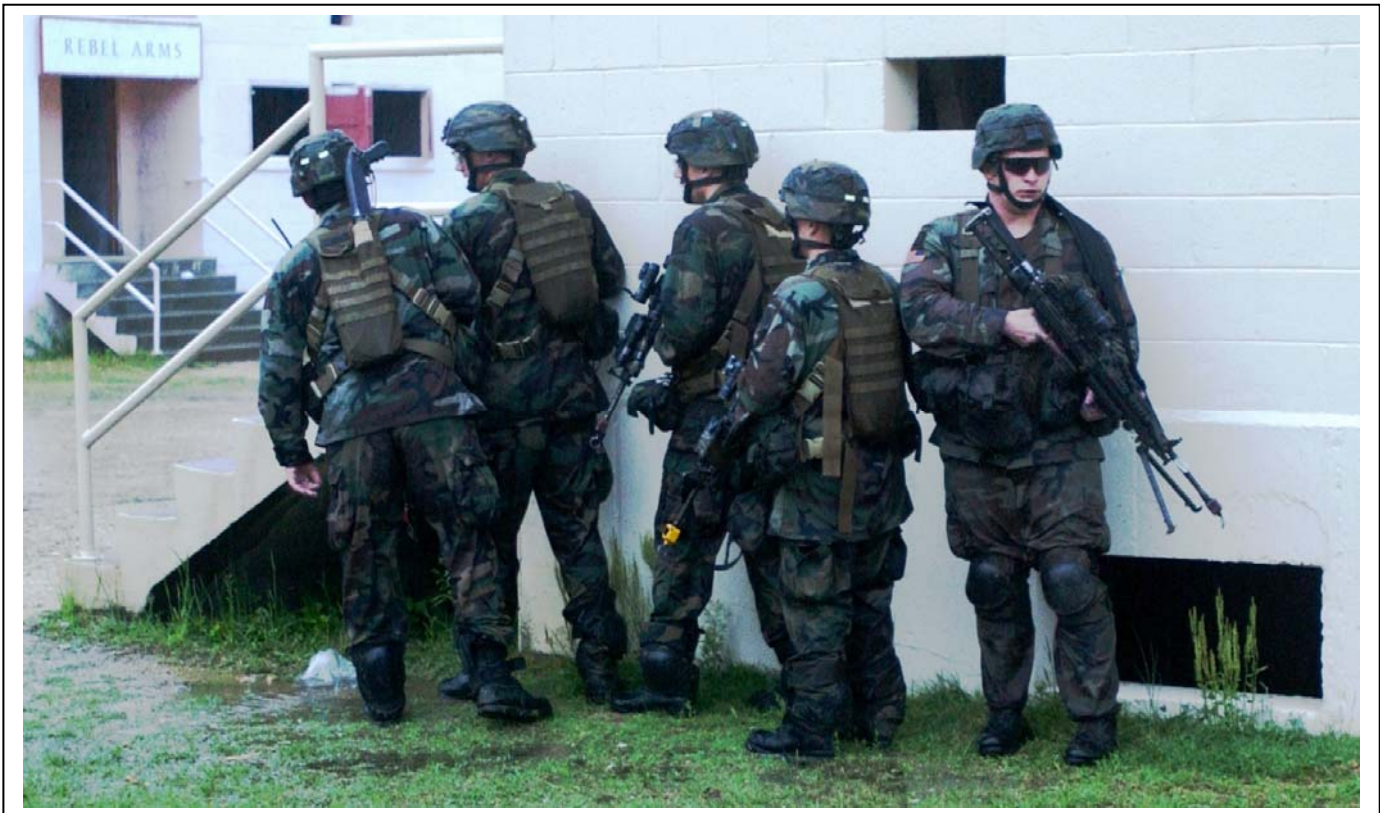
Paratroopers from the 2-508th Parachute Infantry Regiment search for hostile forces while conducting a non-combatants evacuation operation at Fort Bragg.

With the addition of the 508 th PIR, the 82 nd will increase its size to over 20,000 Paratroopers, making the Nation's Strategic Response Force an even stronger Division than it was before. We look forward to maintaining the values and standards of those who came before us in the 508 th Airborne. FURY FROM THE SKY!!!