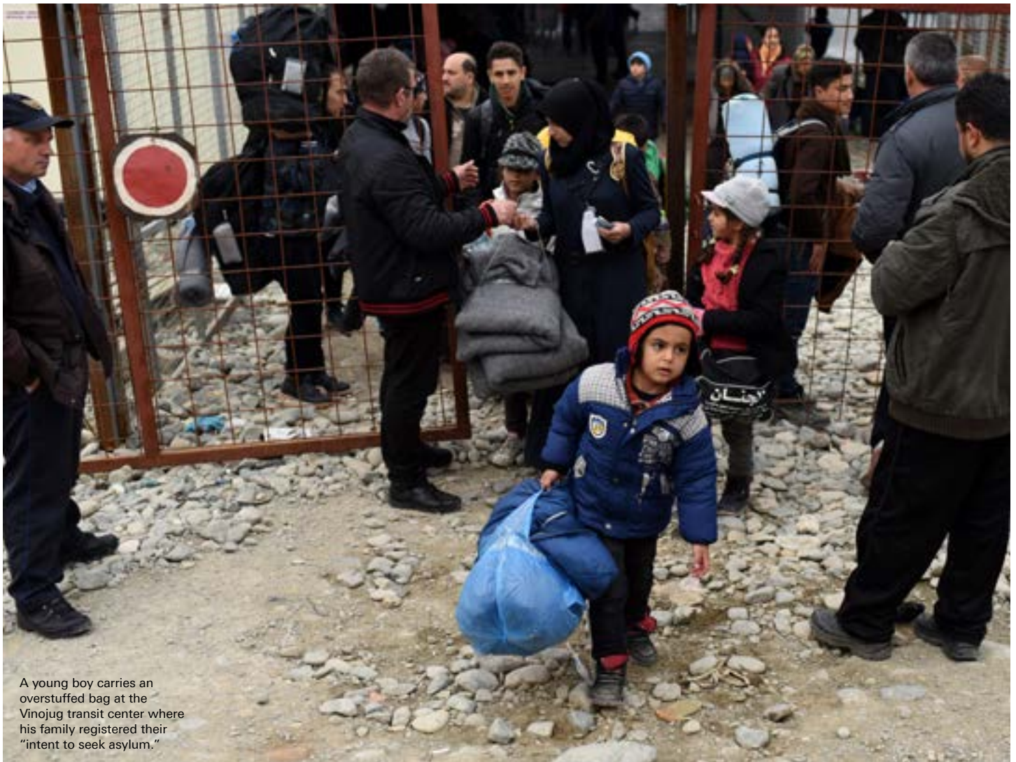
A young boy carries an overstuffed bag at the Vnojug transit center where his family registered their “intent to seek asylum.”

– Anthony Lake, Executive Director, UNICEF