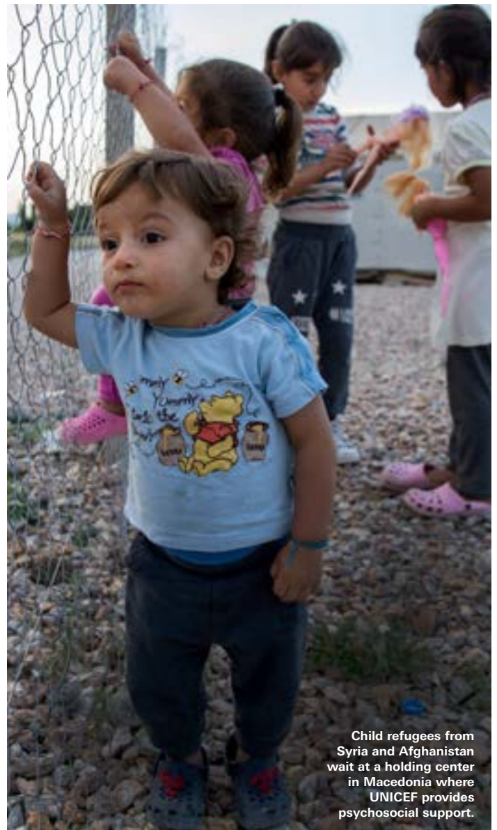
Child refugees from Syria and Afghanistan wait at a holding center in Macedonia where UNICEF provides psychosocial support.

Unitarian Universalism Included within the core Principles of Unitarian Universalism are the promise of "justice, equity and compassion in human relations" (4th Principle) as well as "the goal of world community with peace, liberty and justice for all" (6th Principle). Both of these urge openness and welcoming to all, especially those who are suffering or in need of sanctuary.