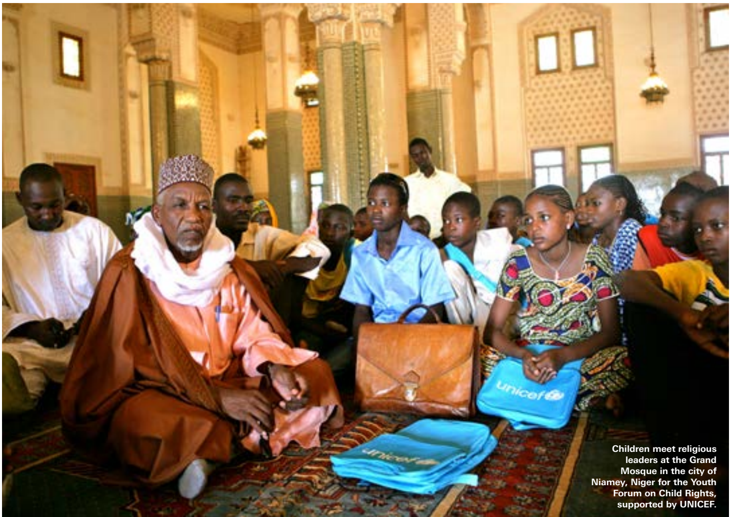
Children meet religious leaders at the Grand Mosque in the city of Niamey, Niger for the Youth Forum on Child Rights, supported by UNICEF.

Jewish tradition is rooted in the concepts of tzedakah and chesed . These overarching values of generosity and compassion form the foundation of Jewish teachings on social justice, while the remembered journey to freedom from slavery helps establish the foundation of Jewish empathy for the most vulnerable. The Torah instructs Jews to "protect the stranger" and end oppression, while the rabbis of the Talmud emphasize that redeeming captives is one of God's greatest commandments, as they