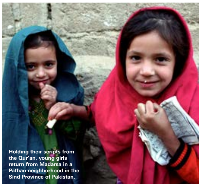
Holding their scripts from the Qur'an, young girls return from Madarsa in a Pathan neighborhood in the Sindh Province of Pakistan.