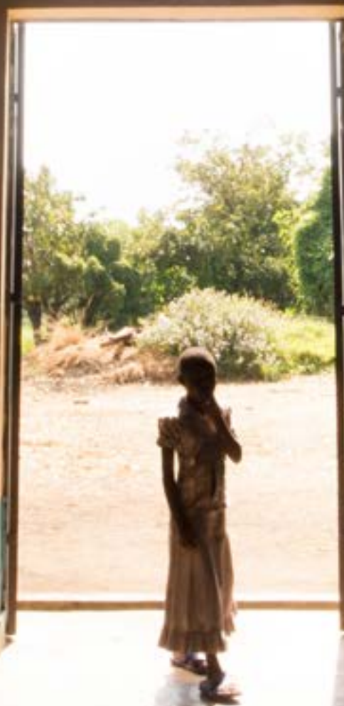
A child enters the Kyanukare Catholic Church in Rwimby subcountry in Uganda for "Health Family Day."