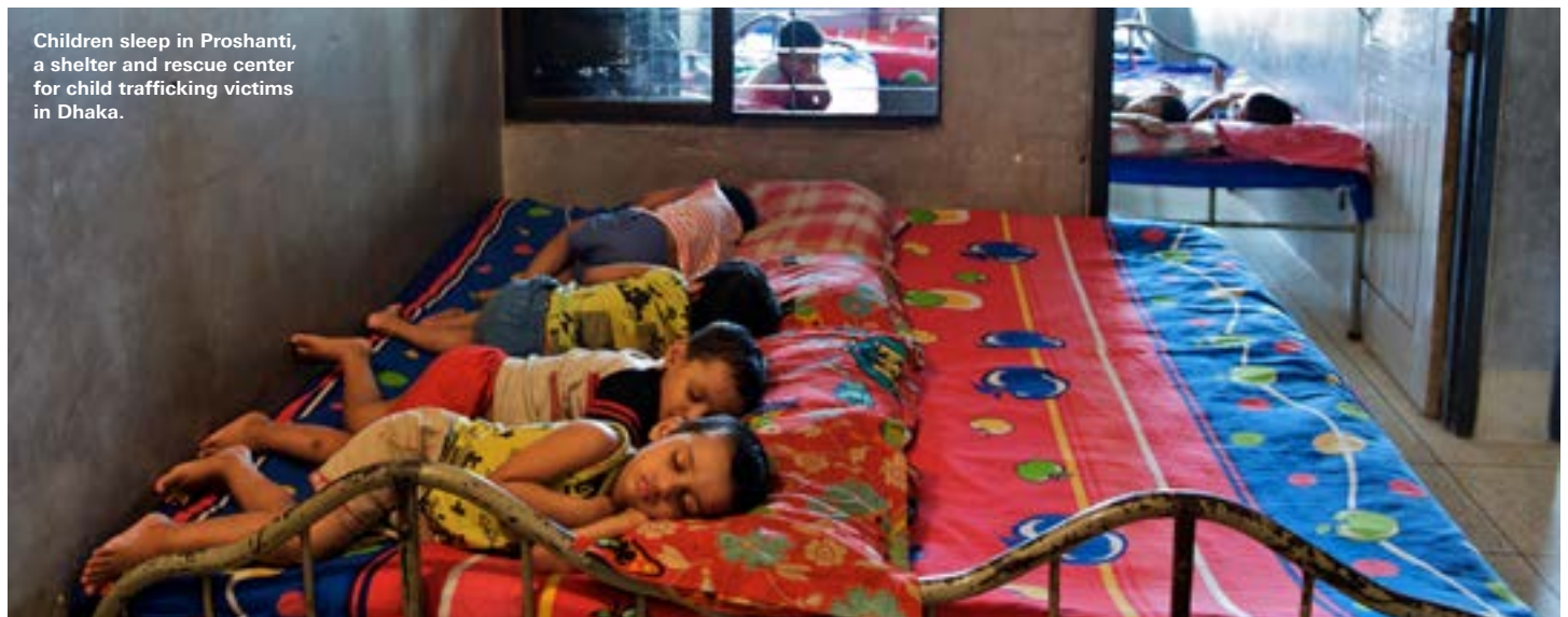
Children sleep in Proshanti, a shelter and rescue center for child trafficking victims in Dhaka.