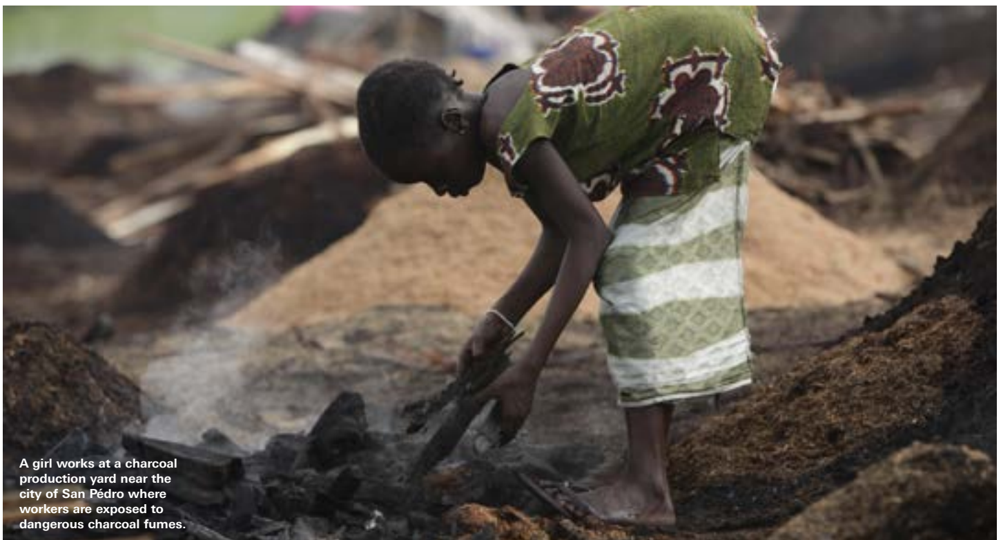
A girl works at a charcoal production yard near the city of San Pedro where workers are exposed to dangerous charcoal fumes.

– UU United Nations Office 2007 Intergenerational Seminar Statement