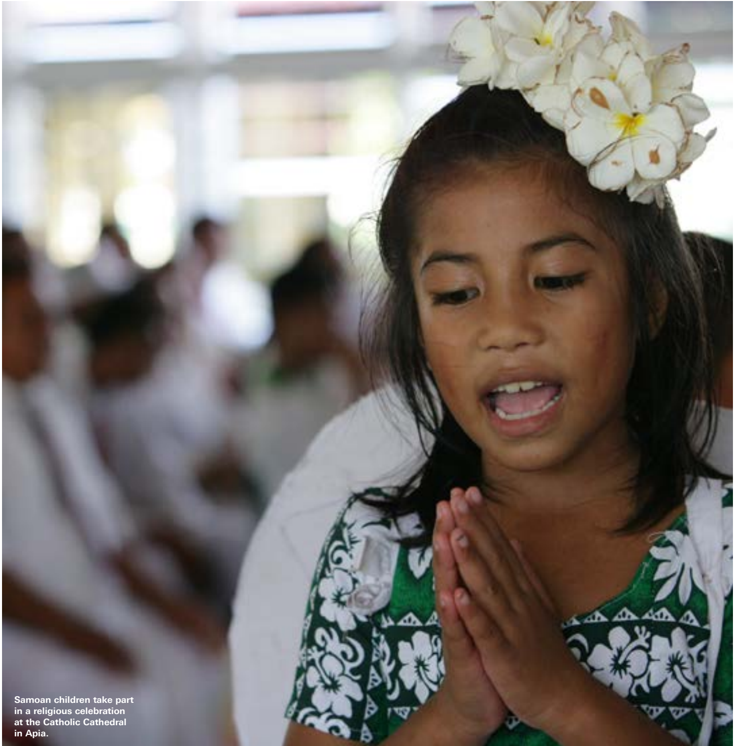
Samoan children take part in a religious celebration at the Catholic Cathedral in Apia.

have extensive networks with access to the most disenfranchised and vulnerable groups, such as those living as refugees and migrants. With this in mind, we recognize that faith communities are effective, powerful advocates to prevent, address and end child trafficking and other global issues affecting children. We hope this toolkit provides relevant guidance for faith communities with replicable ideas and examples of how faith actors can take collective action to end trafficking. We look forward to witnessing the progress that individuals, united and motivated by interfaith values, are able to achieve on behalf of the world's children. ●