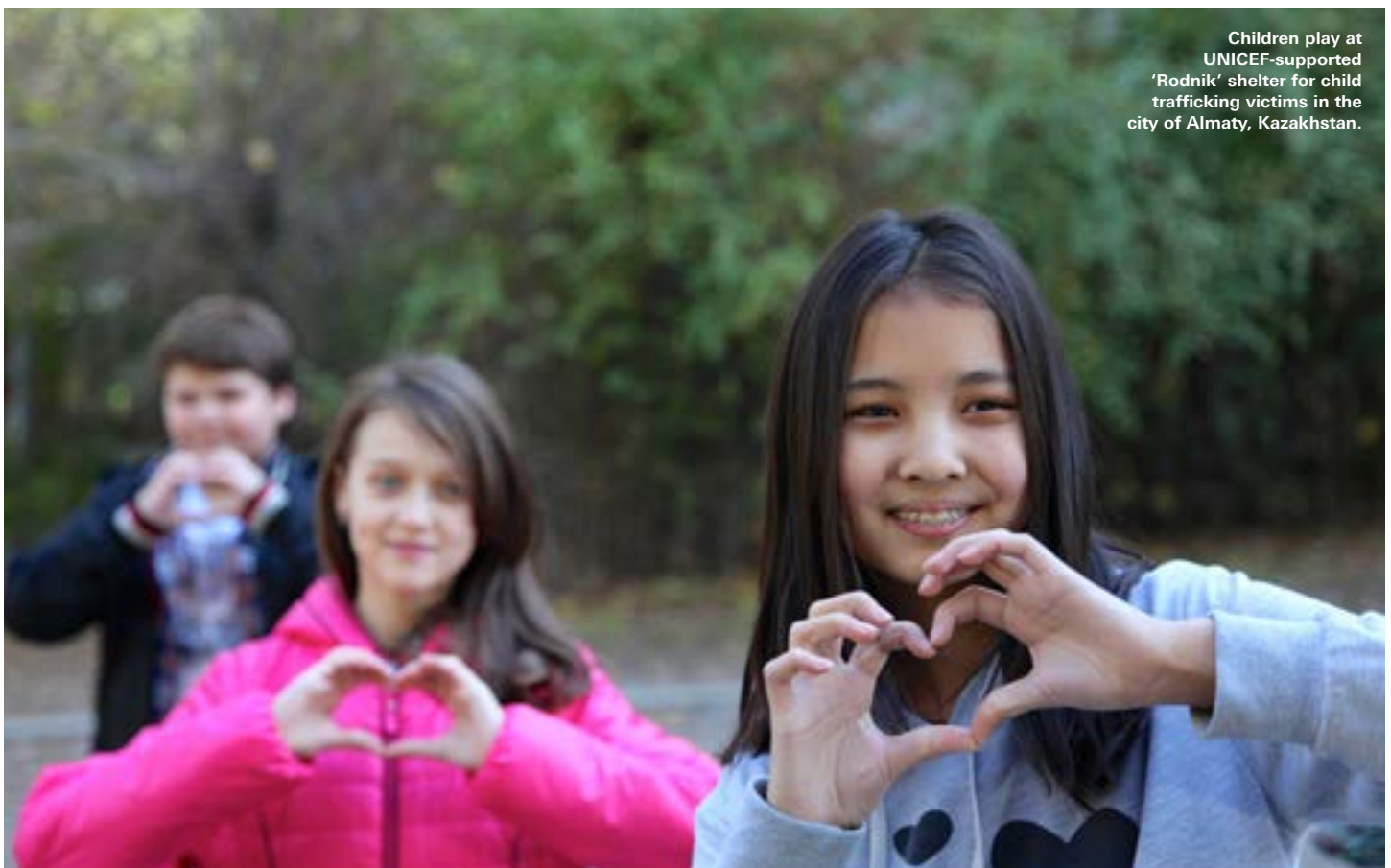
Children play at UNICEF-supported 'Rodnik' shelter for child trafficking victims in the city of Almaty, Kazakhstan.

The faith values highlighted in this toolkit are based on the understanding, interpretation, and guidance of our interfaith partners and do not necessarily encompass the full breadth of views within each major religious tradition. In addition, while UNICEF works very closely with religious communities around the globe, the faith values in this toolkit do not represent the views of UNICEF or UNICEF USA.