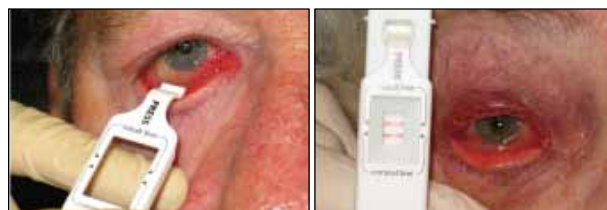
Figure 3. The Adeno Detector Plus (Rapid Pathogen Screening) immunoassay has a self-contained collection unit to perform conjunctival scrapings for in-office detection of adenoviral antigens in approximately 10 minutes.

There are supporting laboratory and clinical data to warrant a clinical trial of topical ganciclovir for the treatment of patients with adenoviral keratoconjunctivitis. Several studies have shown that ganciclovir is active in vitro against adenovirus. 4,5 Animal studies in the cotton rat have also shown some efficacy. 6 In addition, Tabbara 7 performed a controlled, randomized, double-masked clinical study of patients with adenovirus keratoconjunctivitis and found that ganciclovir significantly reduced both the duration of disease and