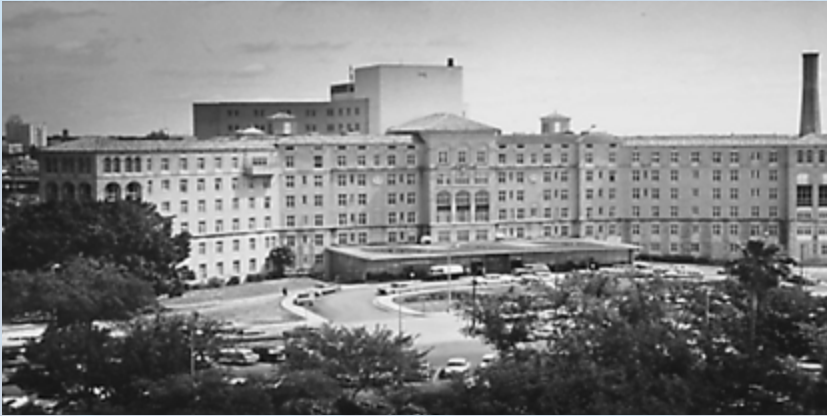
A two-story addition, housing obstetrics and an intensive care unit, is added to TGH.