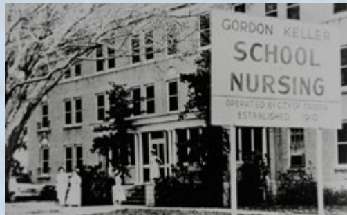
The Gordon Keller Hospital is built on North Boulevard and the Gordon Keller School of Nursing is established.