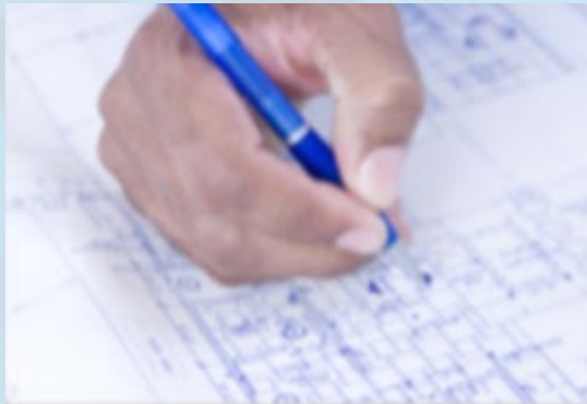
A $14.2 million renovation and expansion is completed.