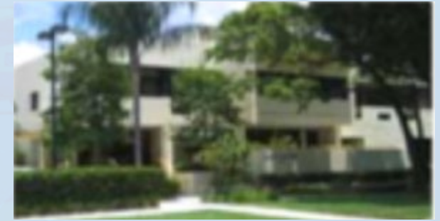
The Suncoast Ronald McDonald house becomes Tampa General's neighbor.

The HCHA rejects an attempt to convert Tampa General Hospital from a public to a private, not-for-profit corporation.