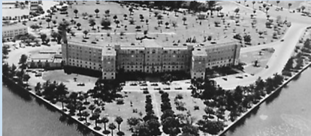
An expansion of Tampa General Hospital results in growth to 514 beds.

TGH's governing board changes its name to the Hospital and Welfare Board of Hillsborough County .