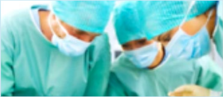
First kidney transplant at TGH is performed.