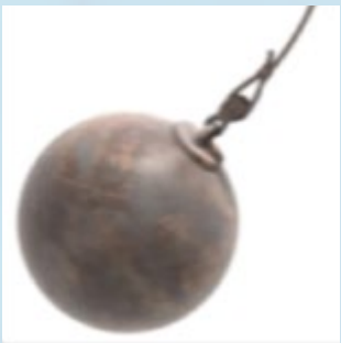
The Clara Frye Memorial Hospital is demolished.