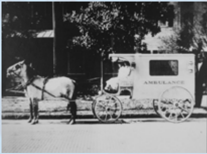
The first of several facilities, which would later become Tampa General Hospital , is built.