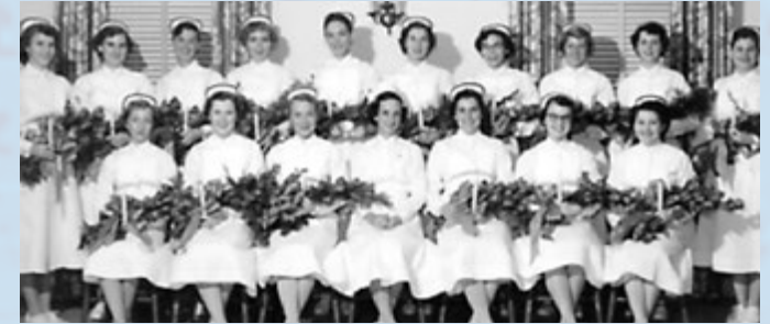
The Gordon Keller School of Nursing is transferred to Hillsborough Community College.