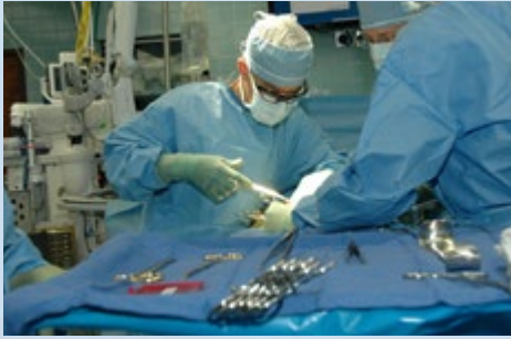
TGH adds liver transplant to its transplantation program.

The HCHA rejects an attempt to convert Tampa General Hospital from a public to a private, not-for-profit corporation.