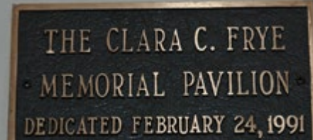
TGH dedicates an area of the hospital in memory of Clara C. Frye.