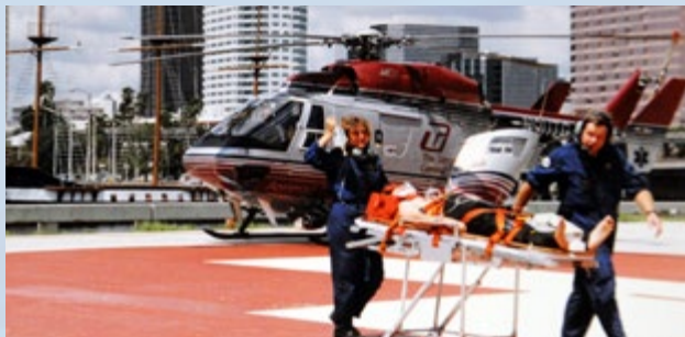
TGH begins its aeromedical transport program with one helicopter.