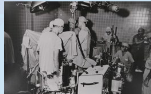
TGH and Clara Frye Memorial Hospital are put under the governance of the Hillsborough County Board of Public Assistance .

Tampa Municipal Hospital officially changes its name to Tampa General Hospital.