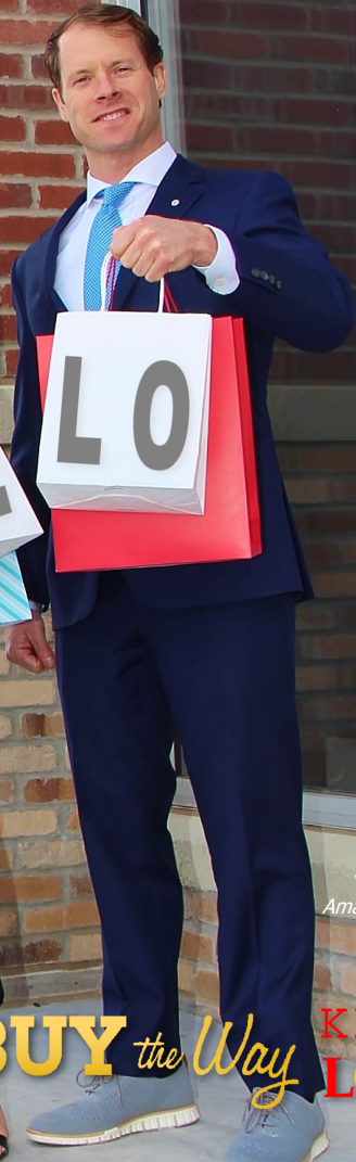
William Ware Amarillo National Bank