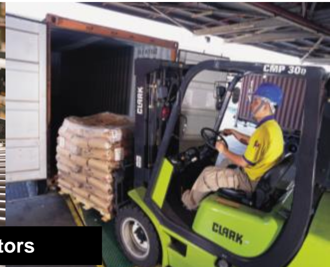
Transport and Logistics Operators