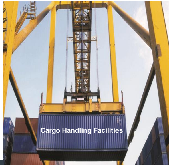
Cargo Handling Facilities