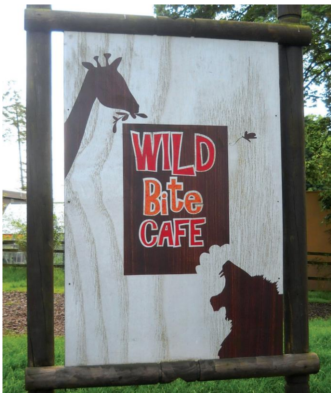
Wild Bite café

I will choose the food that I would like to eat and my adult will pay for the food for me. If it is busy we may need to wait in a queue until it is my turn.