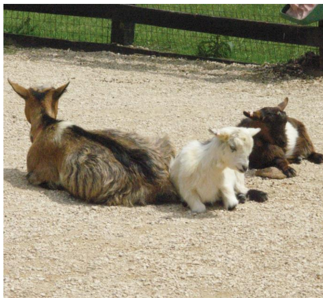
Pygmy goats at the farm