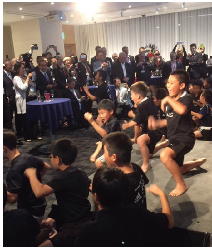
Kashiwa-no-ha school children perform a haka

The conference included good time also for informal business networking during the tea breaks and at the Welcome Reception and Farewell Dinner. With the conference taking place immediately before the Rugby World Cup, and in a country where relationships are key