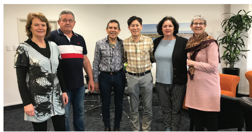
Whakatane District Council staff members