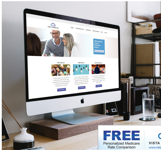
Custom Website Design