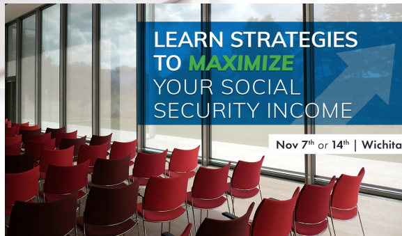
Facebook Event Promo