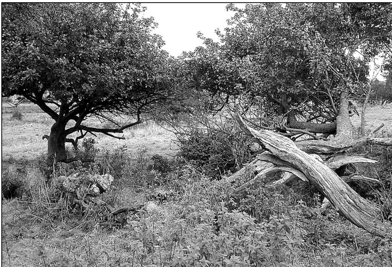
Photograph 9. The old apple tree at Wiveton, possibly 'Pineapple Russet'. The old trunk has split and collapsed; where branches touch the ground they have rooted.

interesting variety for it is one of over 30 named varieties that are thought to have a Norfolk origin, but now listed as lost. Attempts are now being made to identify it, so it will be interesting to watch how these progress. 31