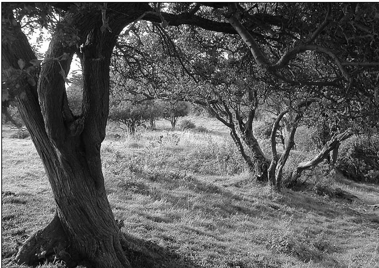
Photograph 6. Hawthorns at Wiveton showing multiple stems growing from possibly an old rootstock.

(11 November) and St. George's Day (23 April), but thought to be best towards the beginning rather than the end of this period. 18