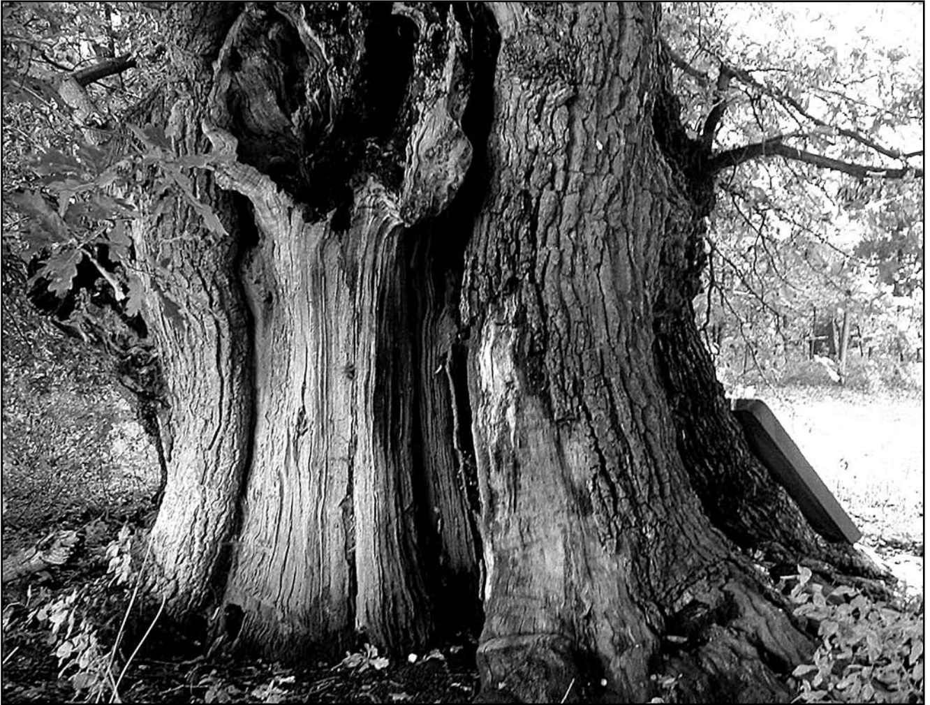
Photograph 1. The oldest living oak at Holkham from 1580. (Tree 63 in the park to the north of King George's Plantation).

Nevertheless, several estates in Norfolk such as Kimberly, Oxborough and Felbrigg have valuable historical records, but none as comprehensive as Holkham Hall. Several extant trees are marked on the earliest surviving maps of this estate surveyed by Biederman, in about 1781. 6 Some of these trees were planted at least 200 years earlier and are probably old boundary and hedgerow specimens that predate the park. A more familiar outline of woods and belts at Holkham appears on the 1796 map published by William Faden, Geographer to King George III. By the time of the 1836 Ordnance Survey (OS) map Holkham Park had developed to virtually its present state.