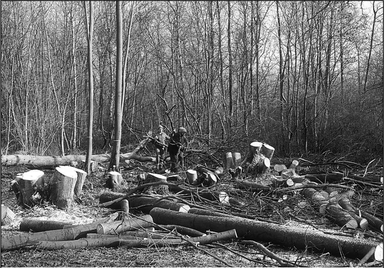
Photograph 5. Working Small-leaved Lime coppice.