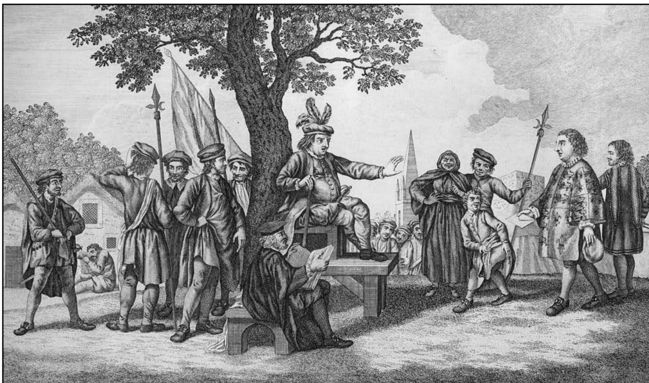
Photograph 2. Kett's Oak or Oak of Reformation on Mousehold Heath.