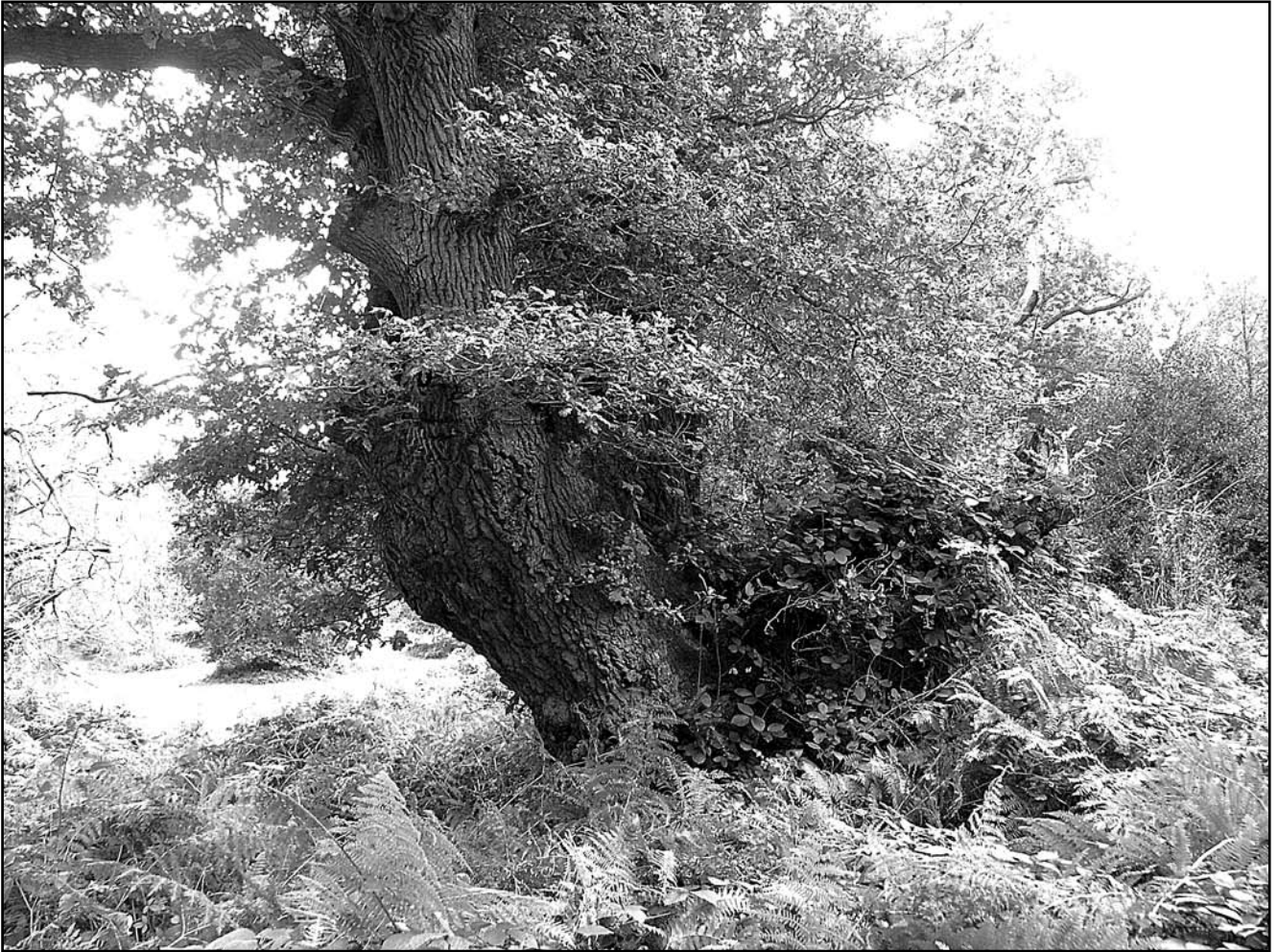
Photograph 4. Bayfield Oak dated to 1346.

ing trees in this age group only remain in place by default as they are commercially useless and in the past, before chainsaws were invented, were too big to be worth cutting down.