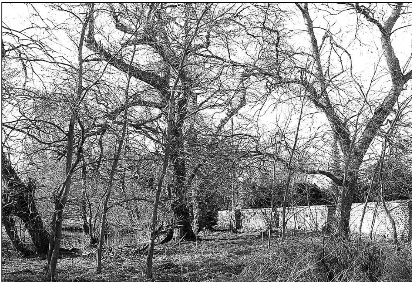
Photograph 7. Clump of Grey Poplar at Glandford; this is a single tree that has 'suckered' to produce this small wood.

At Illington in South Norfolk one with a 93cm diameter stem is growing in a most curious position. Clearly it is a much-loved stem for it is in fact growing right through a tractor shed, with the roof being crafted round the stem to give ample room for expansion and no nails or screws have ever been driven into it. The roots complete with sucker shoots live in the moist soil outside.