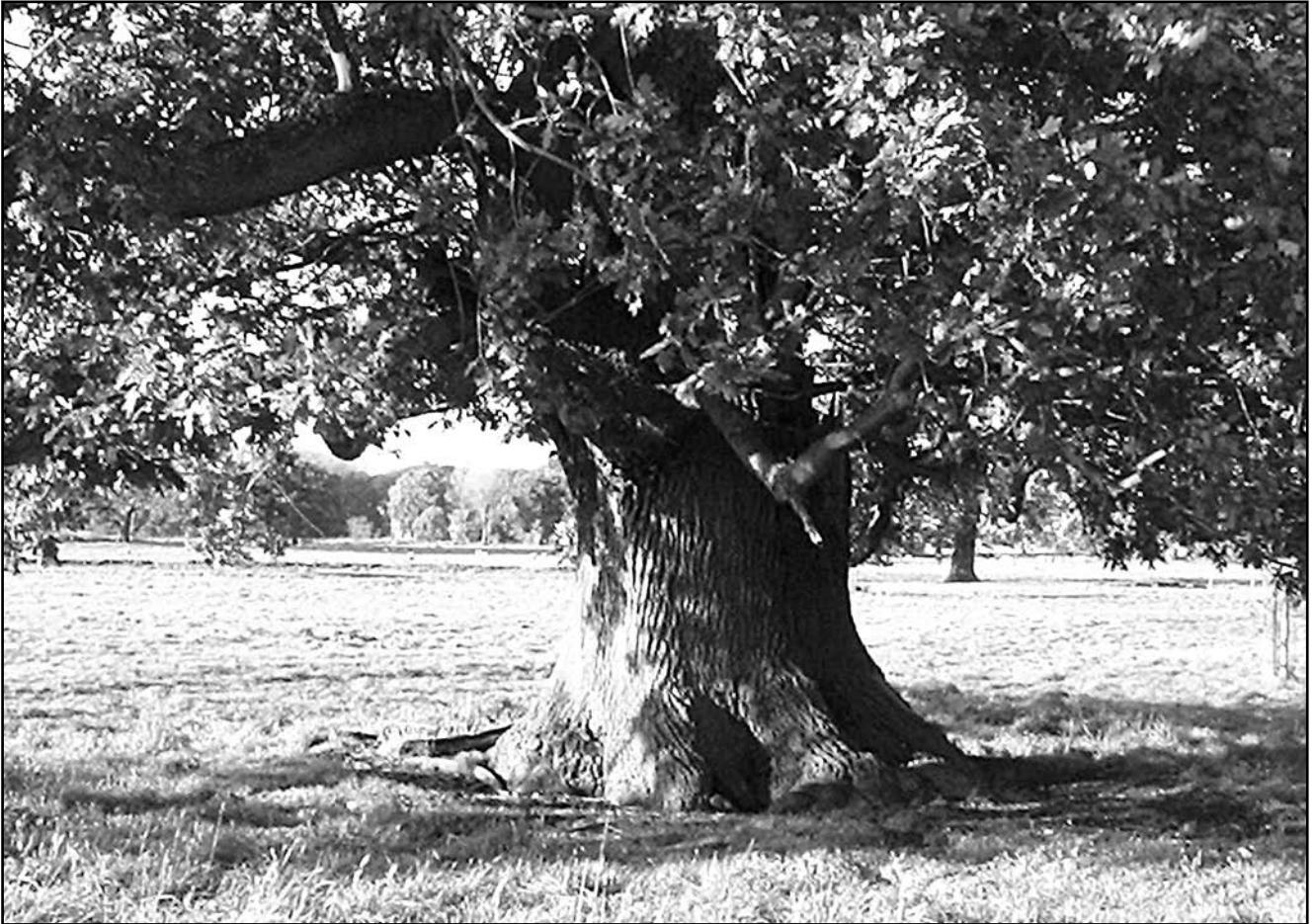
Photograph 3. Ryston Kett's Oak: a 300 year old Ryston oak showing how Kett's Oak would have appeared in 1549.

destruction of religious buildings and improving the lot of the labouring classes. 9 It is hardly surprising therefore that 'Kett's Rebellion' has evoked interest and sympathy and that these trees have been absorbed into local mythology. Although, the historical evidence for linking these trees with the ill fated 'Rebellion' may be questioned, that is not the issue here, rather it is the history of the individual trees.