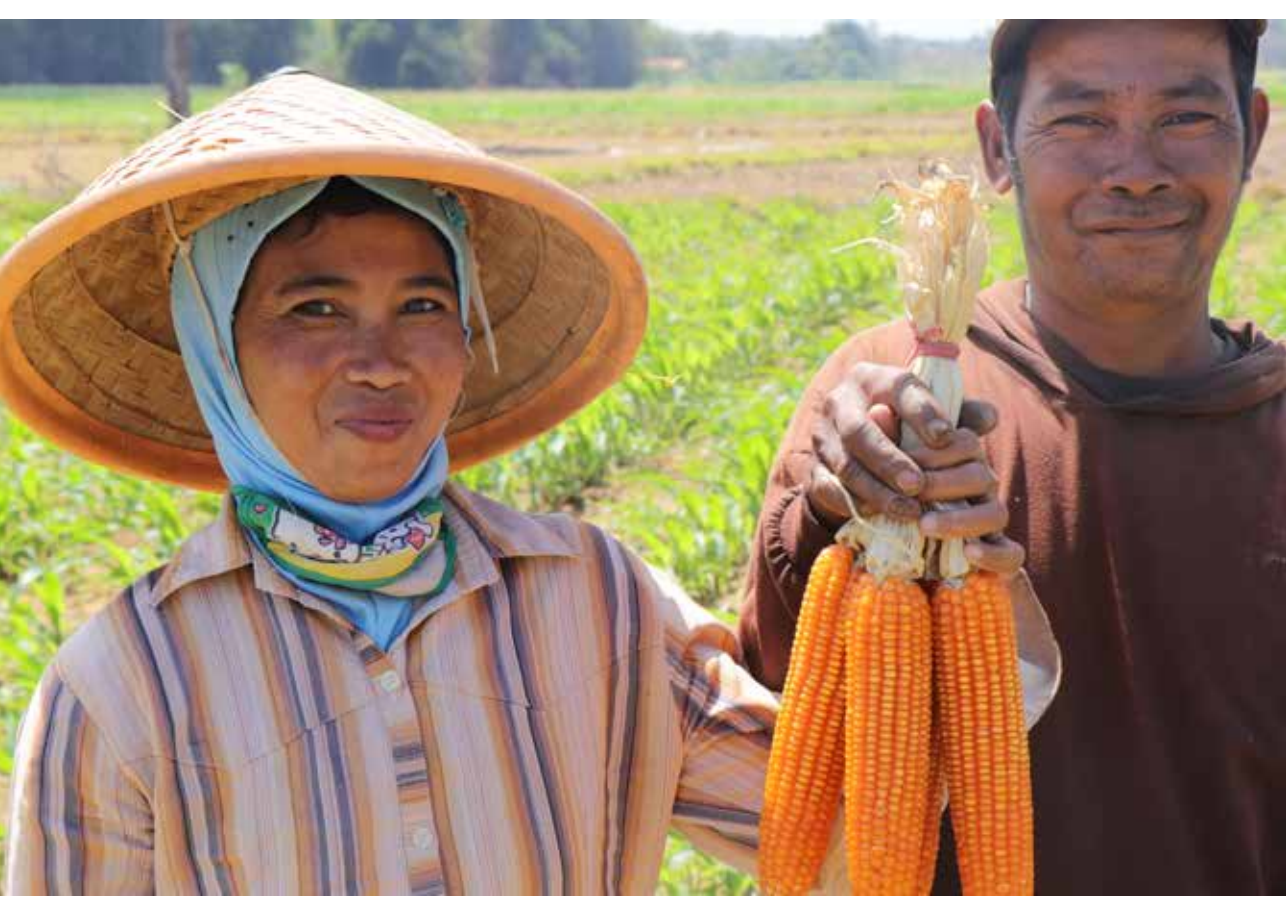
Australia and Indonesia are supporting smallholder farmers to increase their productivity and strengthen supply chains to ensure food security during COVID-19.

We will base our interventions on evidence. The situation is changing rapidly and is, by definition, unprecedented. We will develop and draw on rolling analysis at local, regional and international levels to adapt our approaches as the situation evolves.