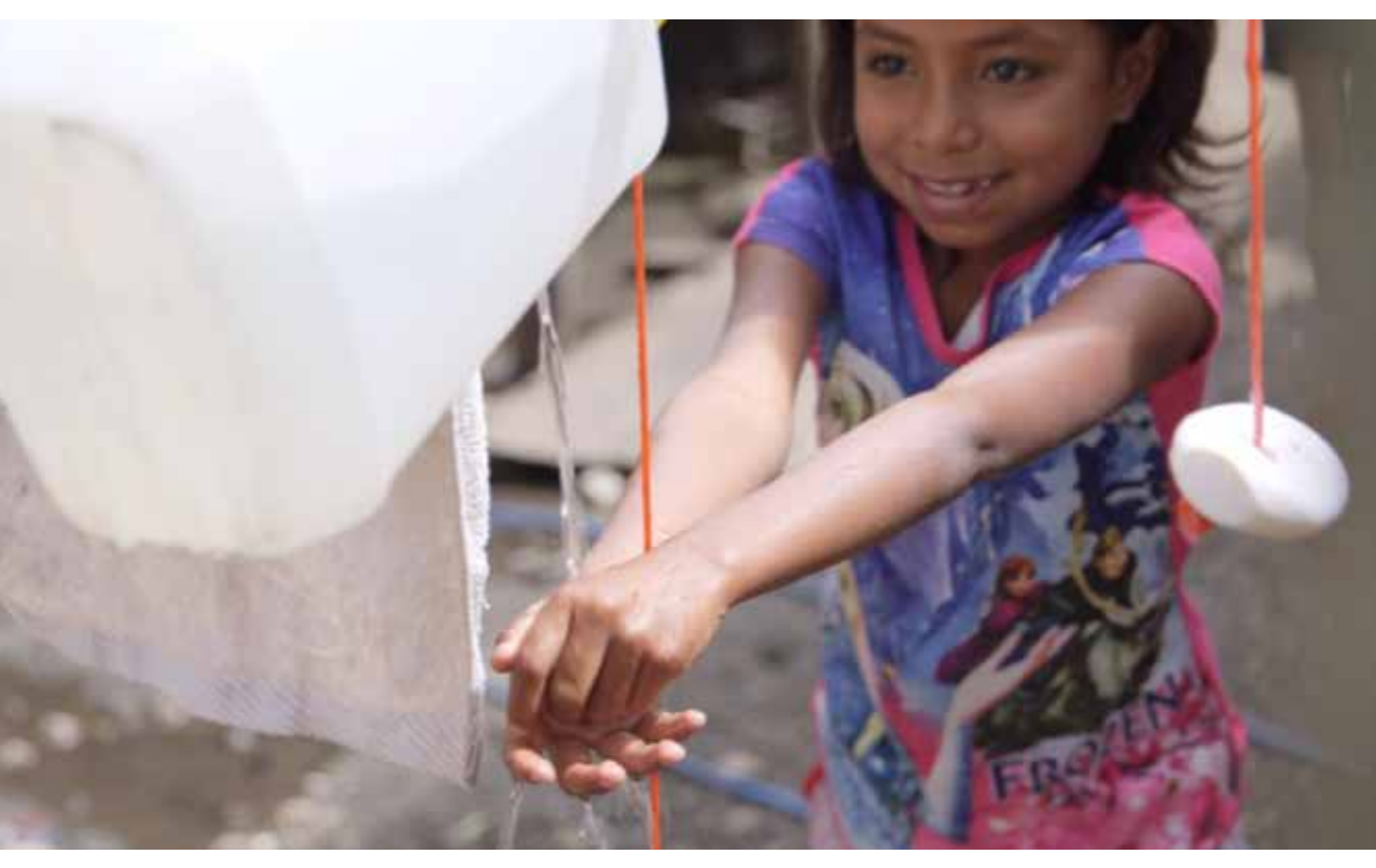
Australia has been working with the government of Timor-Leste and other partners to establish handwashing stations throughout the country to help fight the spread of COVID-19.

Australia is working with community partners and NGOs to quickly respond to local challenges.