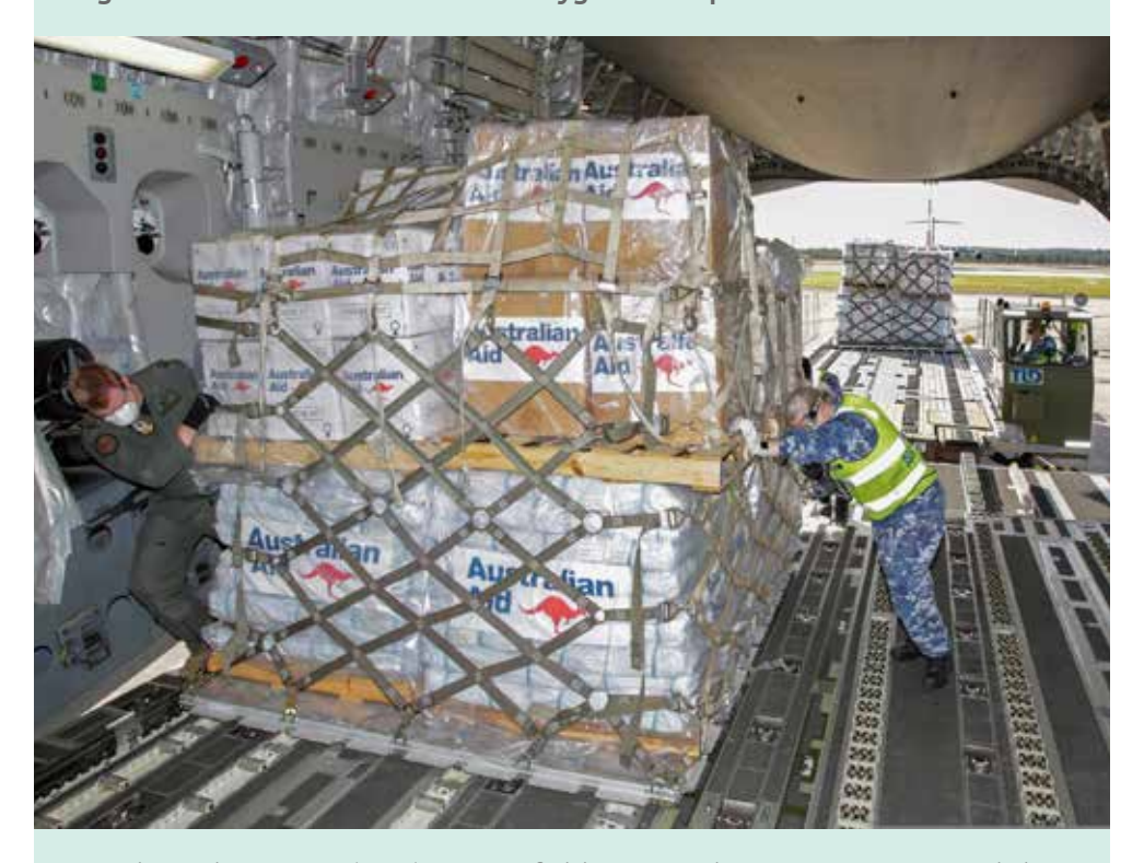
A Royal Australian Air Force (RAAF) C-17 aircraft delivers urgent humanitarian provisions, including medical supplies, shelter, hygiene kits and water buckets to Vanuatu.

We have deployed health experts, including to the World Health Organization regional office in Fiji and the Solomon Islands Ministry of Health. We have provided personal protective equipment and medical supplies to 23 countries and territories, established an isolation centre in Timor-Leste, and provided rapid financial support to Pacific island governments to maintain essential services. We are also supporting Pacific island countries to more effectively detect and prevent the spread of disease, including through new rapid diagnostic tests and working with local organisations to raise awareness of hygiene and prevention measures.