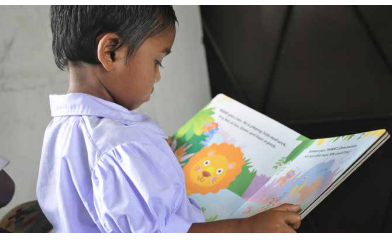
With education affected by COVID-19 in 177 countries, 1.3 billion children are or have been out of school. Education is a critical underpinning of social cohesion and economic growth. Australia is committed to supporting children across our region to return to school in the wake of the pandemic.