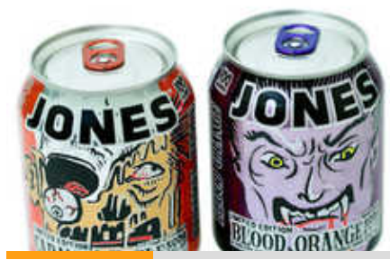
Spooky Halloween Sodas These Seasonal Jones Soda Flavors Taste Like Halloween Candy