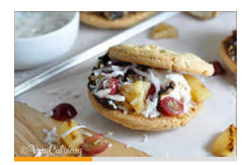
Summer-Ready Campfire Treats Very Culinary's Tropical Simores Rec

Very Culinary's Tropical S'mores Recipe is a Fresh Take on a Classic