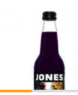
Nostalgic Sandwich Sodas Jones Soda Creates a PB&J-Inspired Carbonated Drink