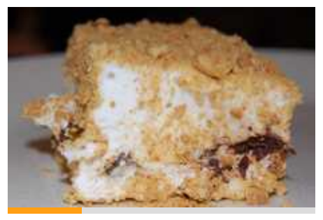
Swine-Infused Campfire Treats These Bacon S'Mores Add a Smokey Taste to the Classic Treat

Very Culinary's Tropical S'mores Recipe is a Fresh Take on a Classic