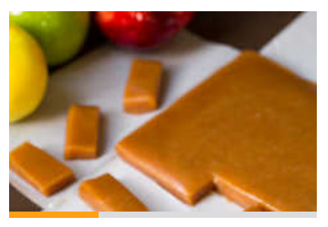
Caramel Cider Candies These DIY Apple Cider Caramels Meld Two Delicious Fall Flavors