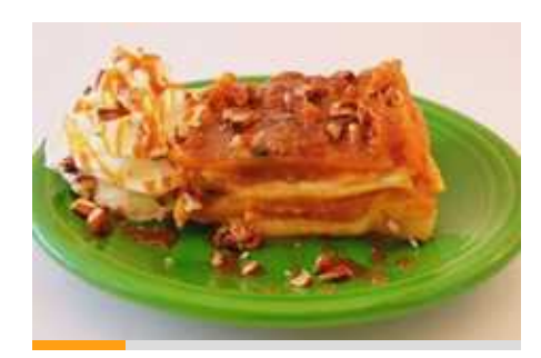
Remixed Thanksgiving Desserts The Butternut BourbonLasagna Gives Tradition a Twist