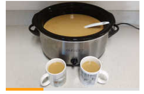
DIY Pumpkin Coffee This Recipe Explains How to Make the Infamous Fall Flavored Hot Beverage