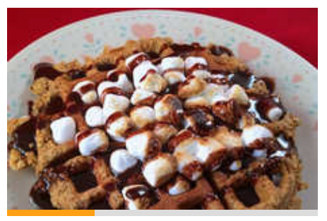
Campfire Treat Waffles This Sweet Waffle From The Vulgar Chef is One Part S'more One Part Waffle