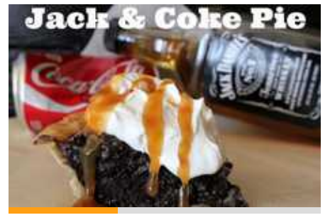
Whisky Cake Desserts The Jack Daniels and Coke Pie Includes Moist Chocolate Cake in a Pastry Crust