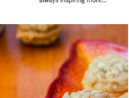
Sandwiched Fall Confections Serve Oatmeal Pumpkin Sandwich Cookie Concoctions for Thanksgiving