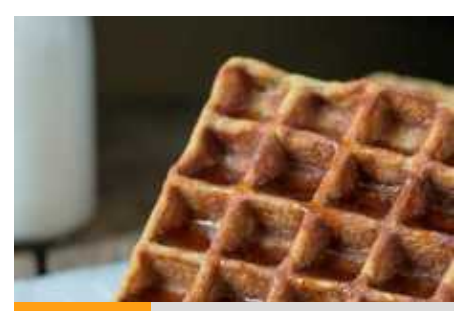
Paleo Pecan Waffles These Delicious Fall Breakfast Waffles are Filled with Pecans and Spices