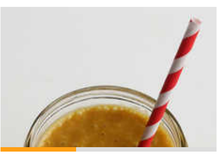
Festive Pie Smoothies This Delicious Pumpkin Pie Breakfast Drink is Perfect for the Fall