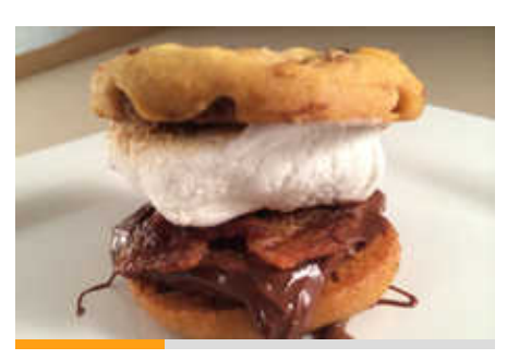
Bacon Campfire Confections These S'mores are a Perfect Balance of Sweet and Savory