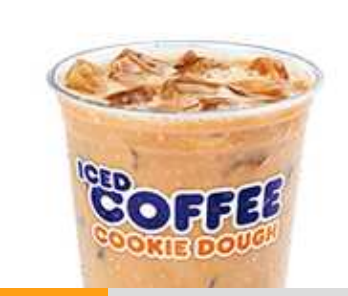
Cookie Dough Coffee Dunkin Donuts Unveiled Its Mouthwatering Cookie Dough Coffee