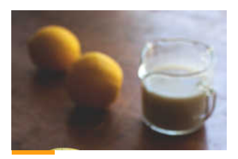
Coconut Chai Lemonades This Refreshing Chai Lemonade Drink is Infused with Coconut