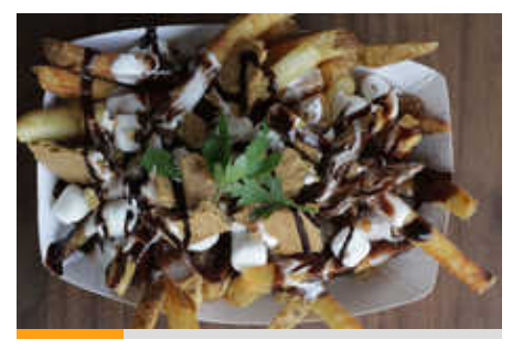
Chocolate Marshmallow Poutines These S'mores Fries Creatively Combine Gravy and Graham Crackers