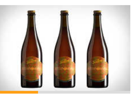
Fall Flavored Brews The Bruery Autumn Maple Beer Tastes Just Like the Season You'd Expect