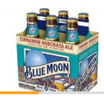
Cinnamon-Spiced Brews The New Blue Moon Beer is Spicy and Sweet