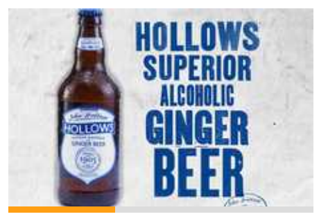
Spiked Ginger Beers The Hollows All Natural Alcoholic Ginger Beer is a Healthier Alternative