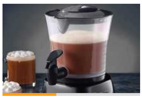
Delightful Cocoa Beverage Makers

The Retro Series Hot Chocolate Maker Will Sweeten Every Morning