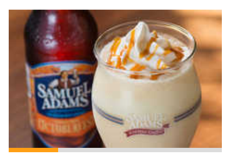
Delicious Beer Desserts The Red Robin Octoberfest Milkshake Pays Homage to the German Holiday