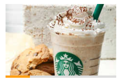
Caffeinated Cookie Drinks Starbucks Japan is Now Blending in an Entire Chocolate Cookie in a Drink