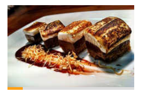
Lavish Campfire Desserts The Haven Gastropub S'mores are a Foodie Must-See