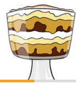
Tweaked Trifle Desserts Serve Cake Over Steak's Brownie Tiramisu Trifle Recipe at Daytime Events