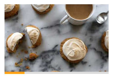
Campfire Confection Scones These Breakfast Scones Taste Like Chocolate and Marshmallow Treats