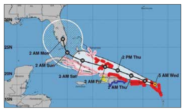
Example of a storm path projection showing the "Forecast Cone".

The line in the center of the cone is typically the best estimated path of the center of the threatening storm and can have a margin of error up to 99 miles during a 48-hour outlook. Residents living in any area blanketed by the cone should prepare for some affects from the storm.