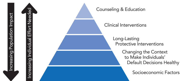
Figure 2: The health impact pyramid. Adapted from Frieden, 2010.

In considering how to address chronic diseases and their underlying risk factors through policy, it is helpful to have a conceptual framework for taking action. A recent commentary by Thomas Frieden (2010), the current Director for the Centers for Disease Control and Prevention (CDC), provides a five-tier pyramid model that shows the impact of different types of public health interventions (Figure 2). Efforts focused on the bottom of the pyramid are less dependent on individual effort and have greater population reach and effectiveness. However, for sustained impact, multiple interventions that address all levels of the pyramid must be implemented.