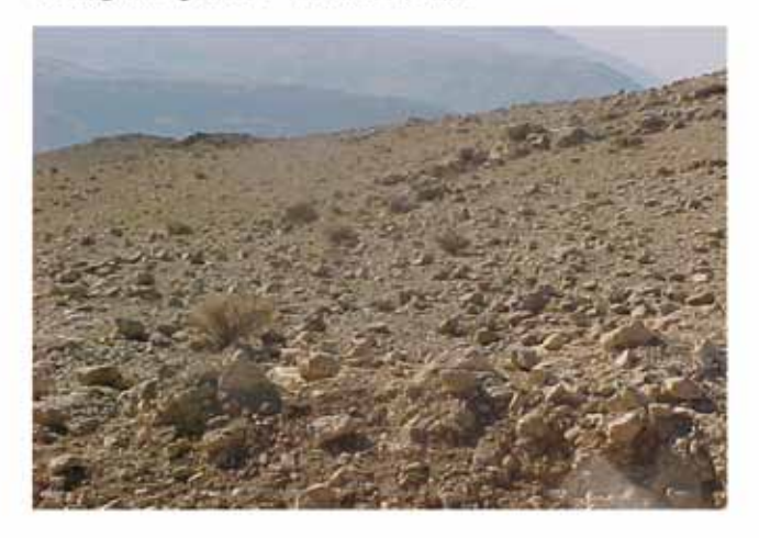
B: Zygophyllum dumosum class

A: Astragalus spinosus class of vegetation subclass Astragalus spinosus- Retama raetam