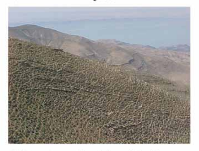
B: Retama raetam vegetation calss in association with Urginea maritima