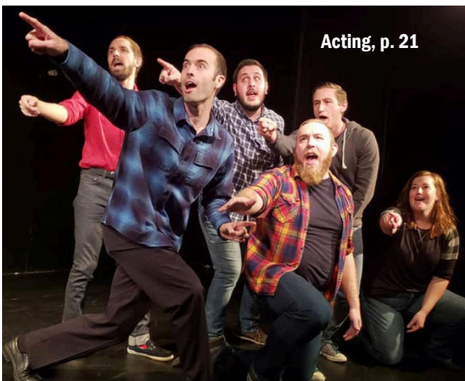
Acting, p. 21