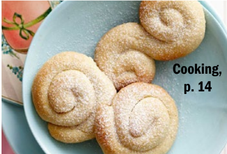
Cooking, p. 14