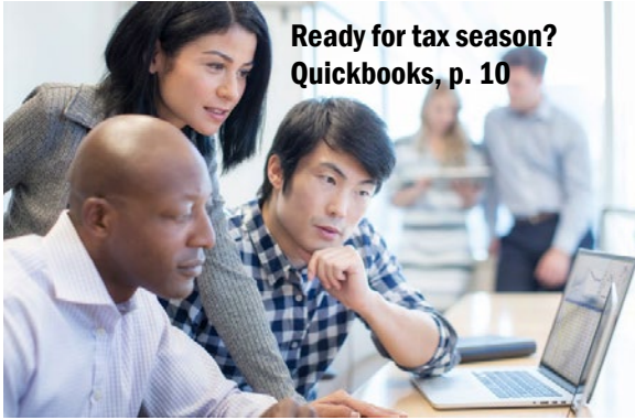
Ready for tax season? Quickbooks, p. 10