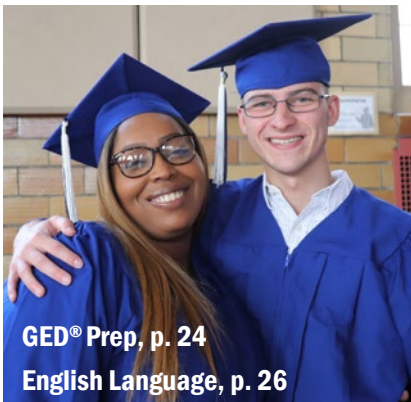
GED® Prep, p. 24 English Language, p. 26