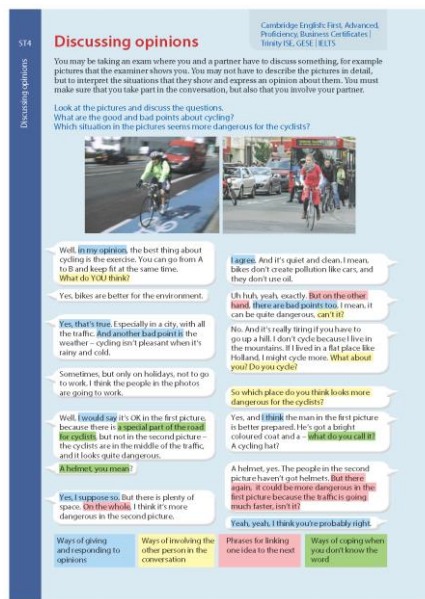
Oxford Speaking Tutor