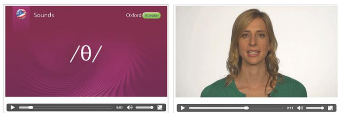
Sounds section of Oxford iSpeaker