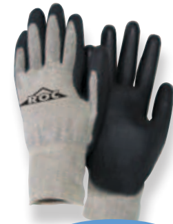
Works With Touchscreens

Grips like iron. Feels like bare hands. Our ROC® collection has a glove for every task. Special coatings provide tough abrasion resistance and durability while delivering exceptional grip in wet, oily or dry conditions. From touchscreen compatible, cut resistant and hi-vis options to moisture wicking bamboo, the comfortable form-fitting shells allow extra dexterity for working with small parts. No matter the style, the ROC® delivers hands-on gripping power.