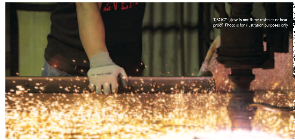
T-ROC™ glove is not flame resistant or heat proof. Photo is for illustration purposes only.