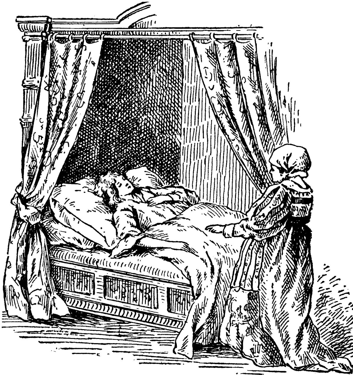
THE NURSE THINKS JULIET DEAD.