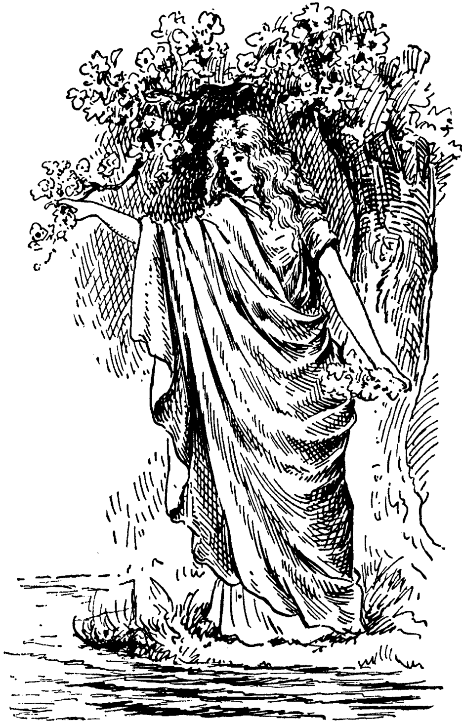
DROWNING OF OPHELIA.