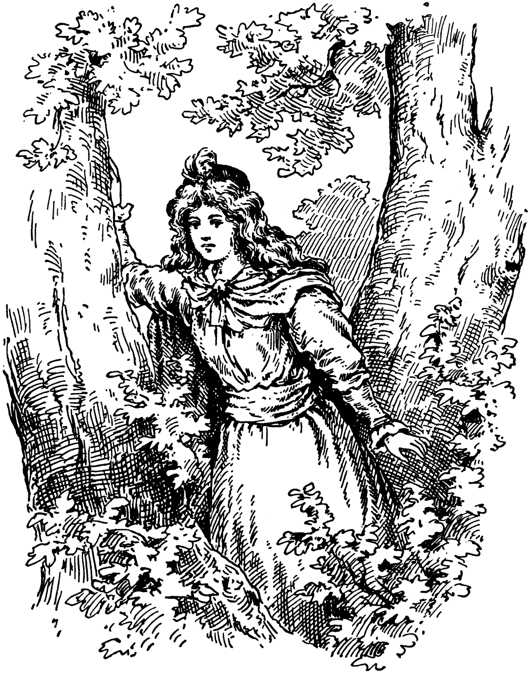
HELENA IN THE WOOD.