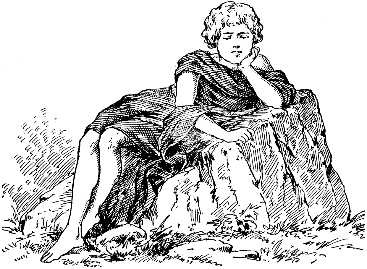
TIMON GROWS SULLEN.