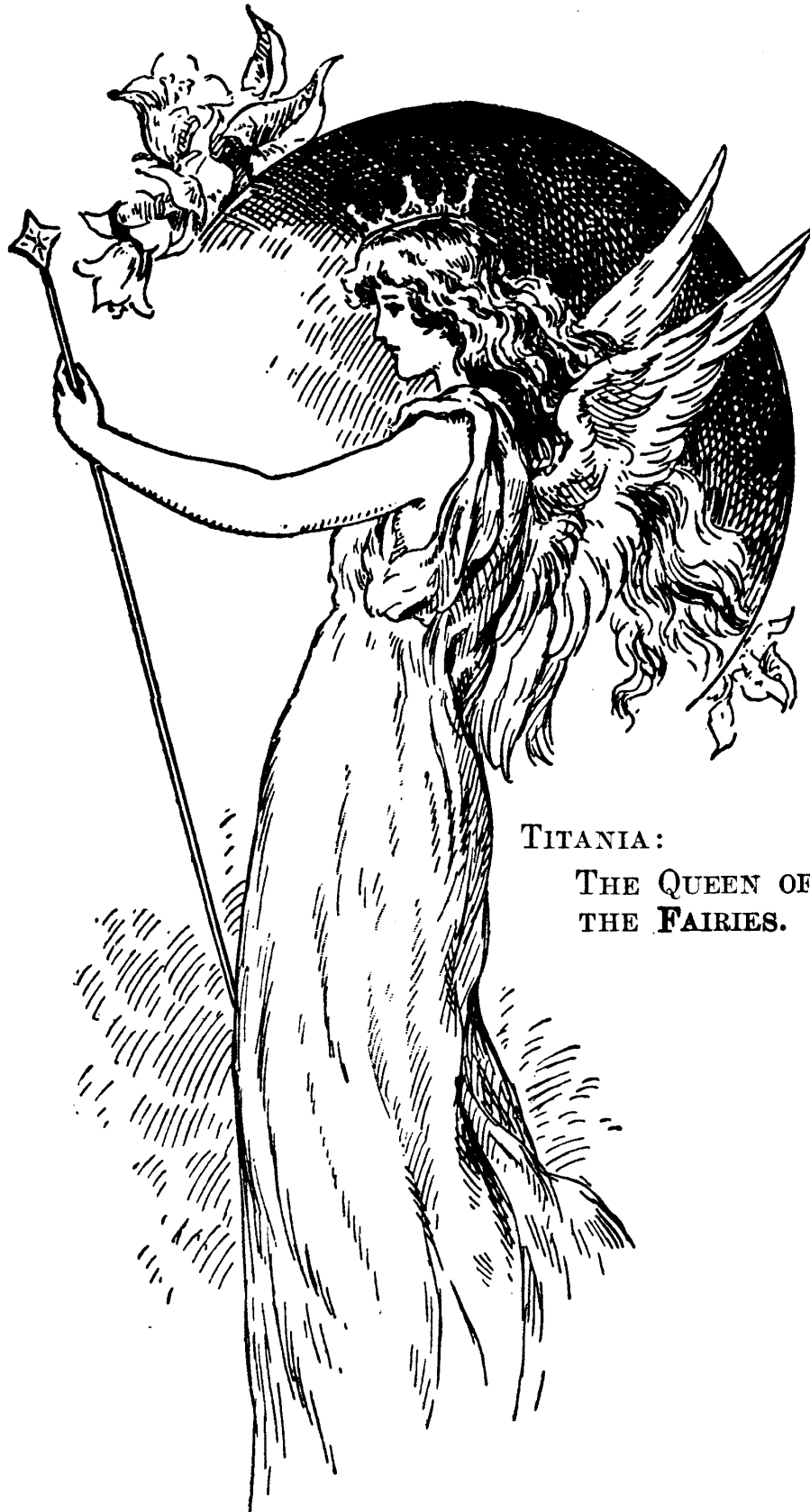
TITANIA: THE QUEEN OF THE FAIRIES.