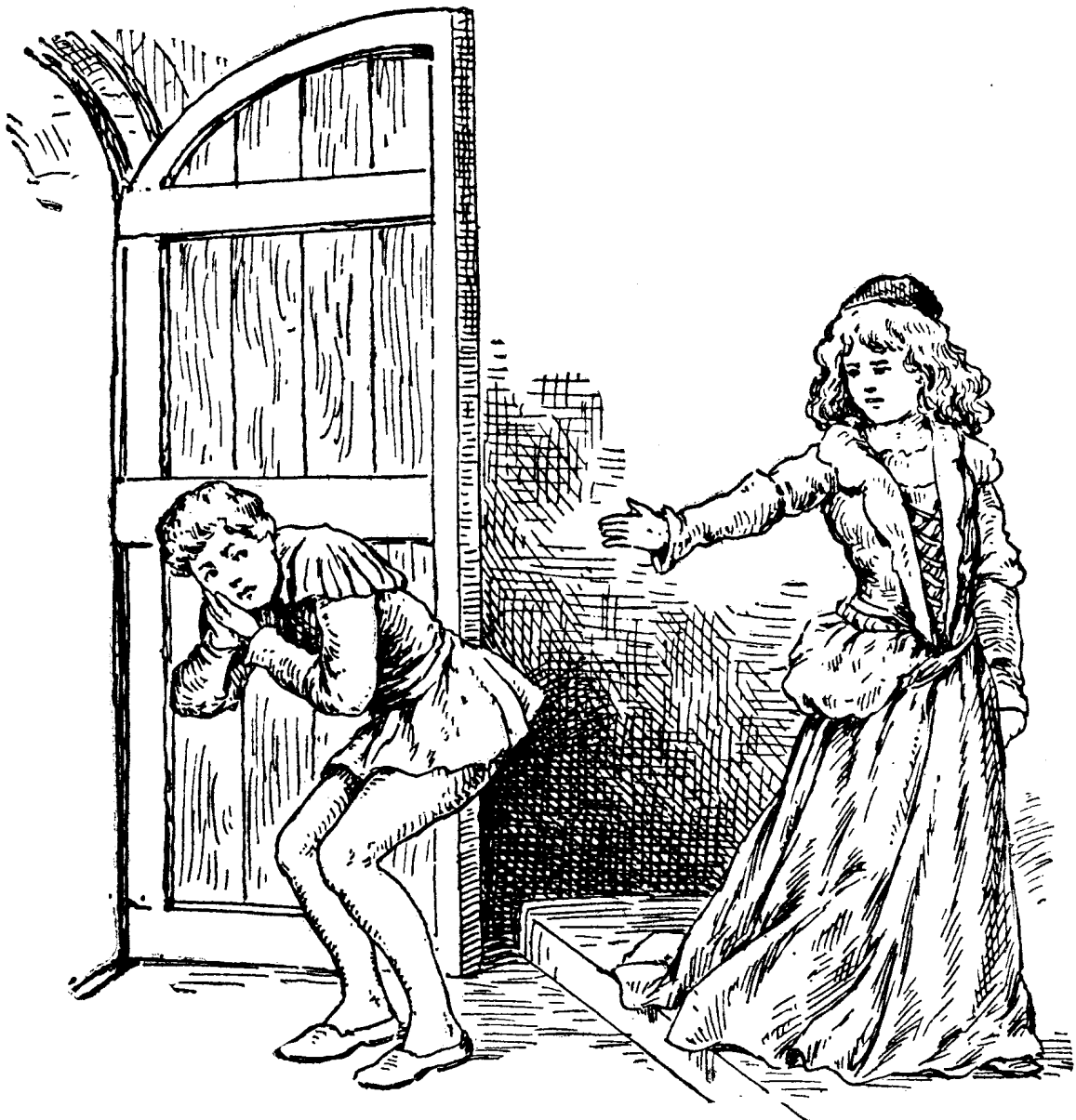
KATHARINE BOXES THE SERVANT'S EARS.