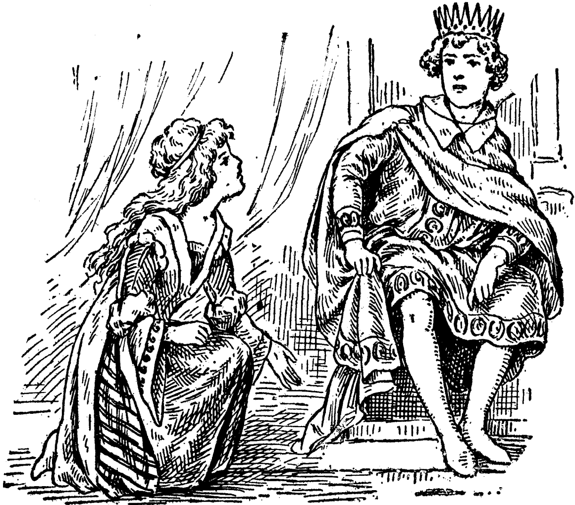
HELENA AND THE KING.