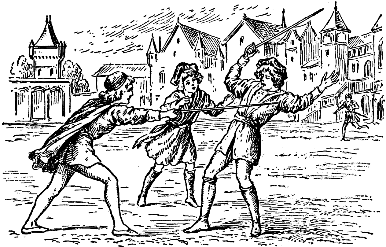
ROMEO AND TYBALT FIGHT.