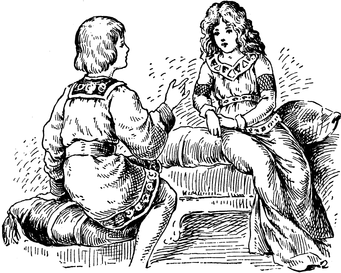
IACHIMO AND IMOGEN.