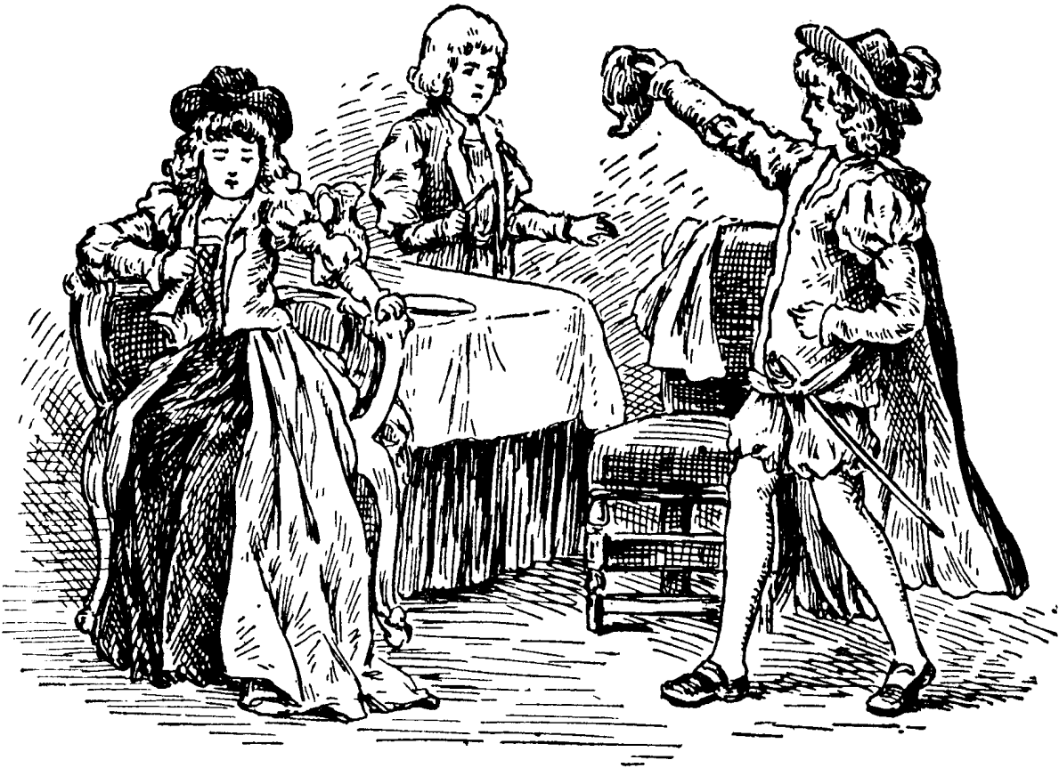
PETRUCHIO FINDS FAULT WITH THE SUPPER.