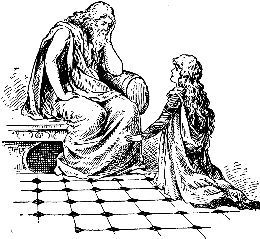
PERICLES AND MARINA.