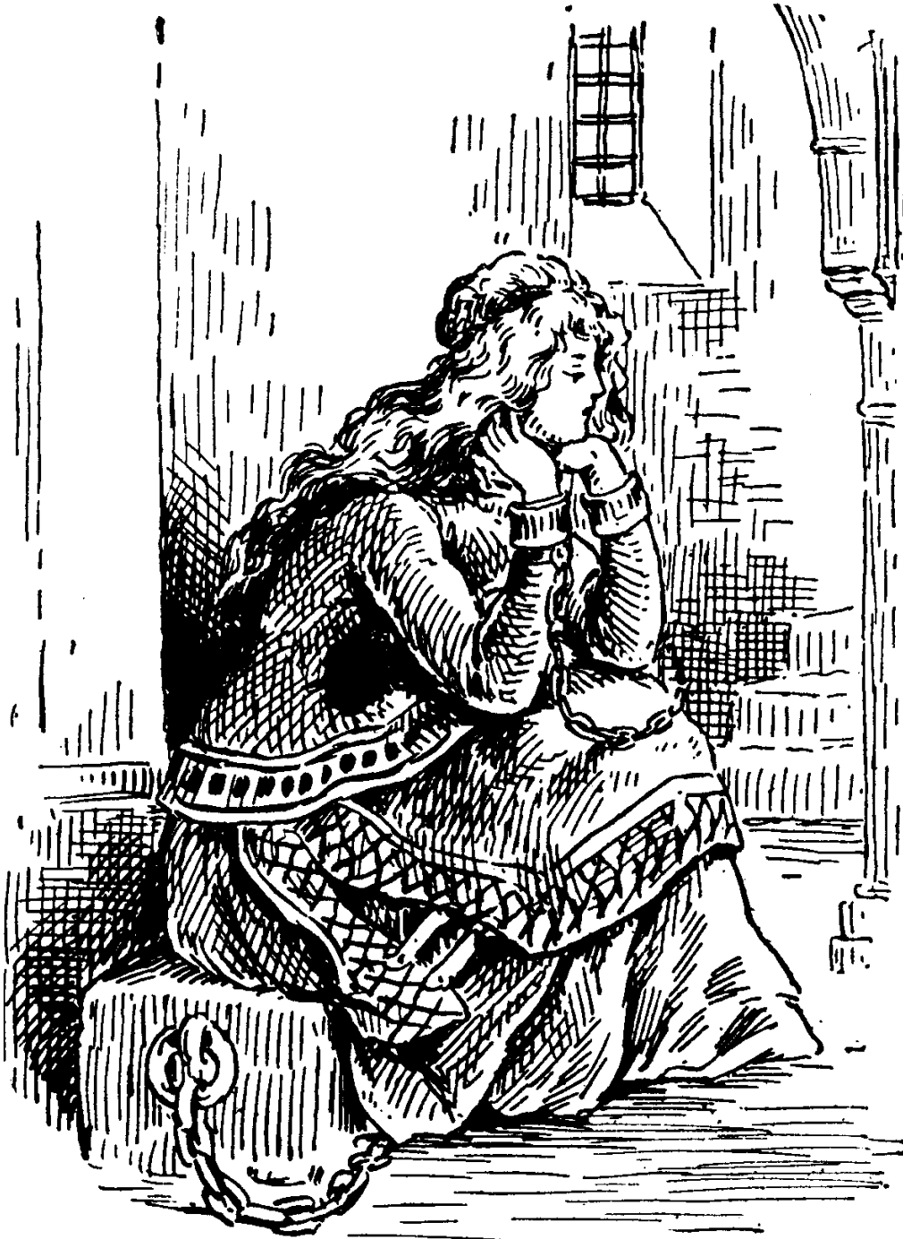
CORDELIA IN PRISON.