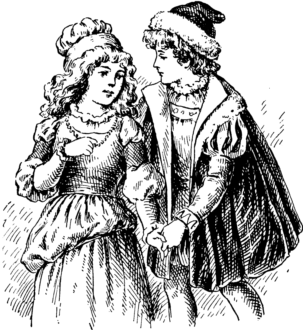
CLAUDIO AND HERO.