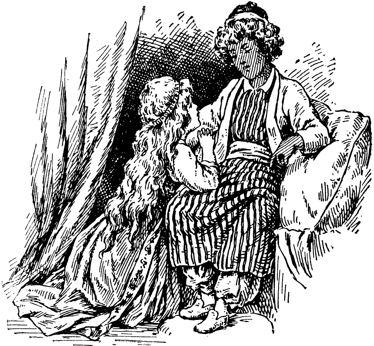
OTHELLO TELLING DESDEMONA HIS ADVENTURES.