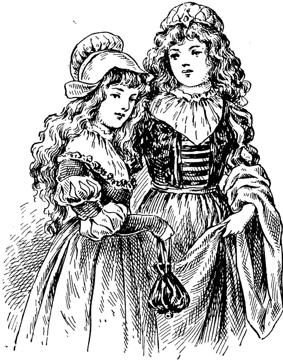
HERO AND URSULA.