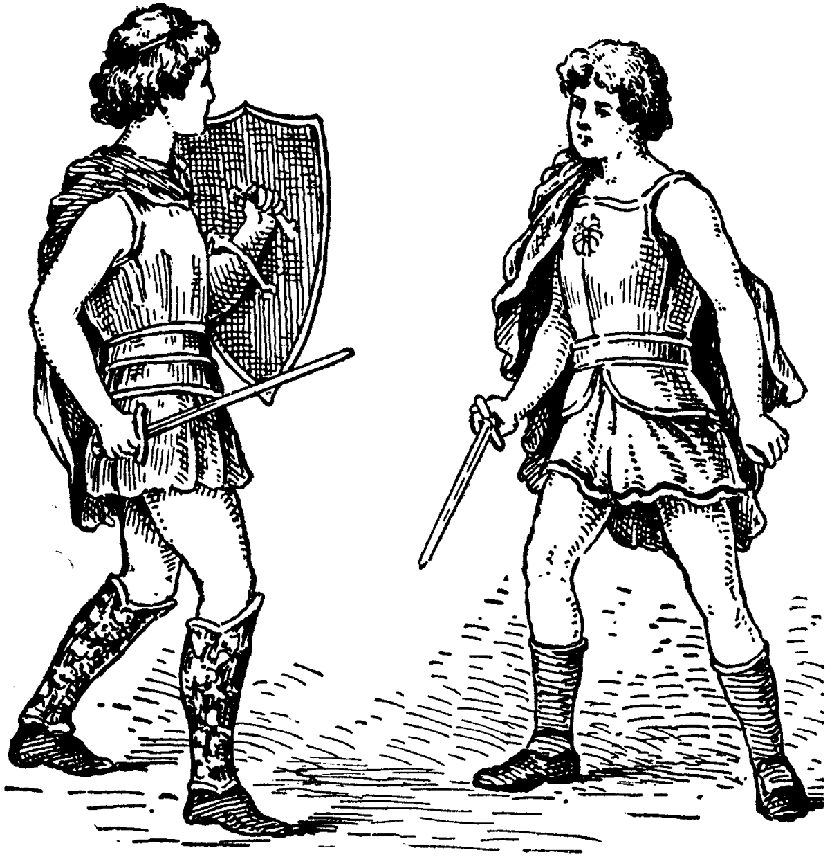
PERICLES WINS IN THE TOURNAMENT.