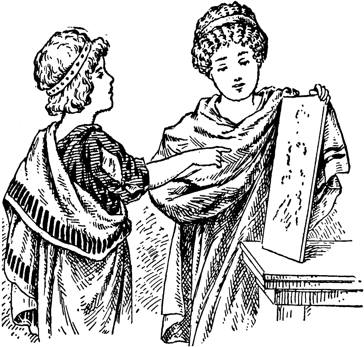
Painter Showing Timon a Picture.