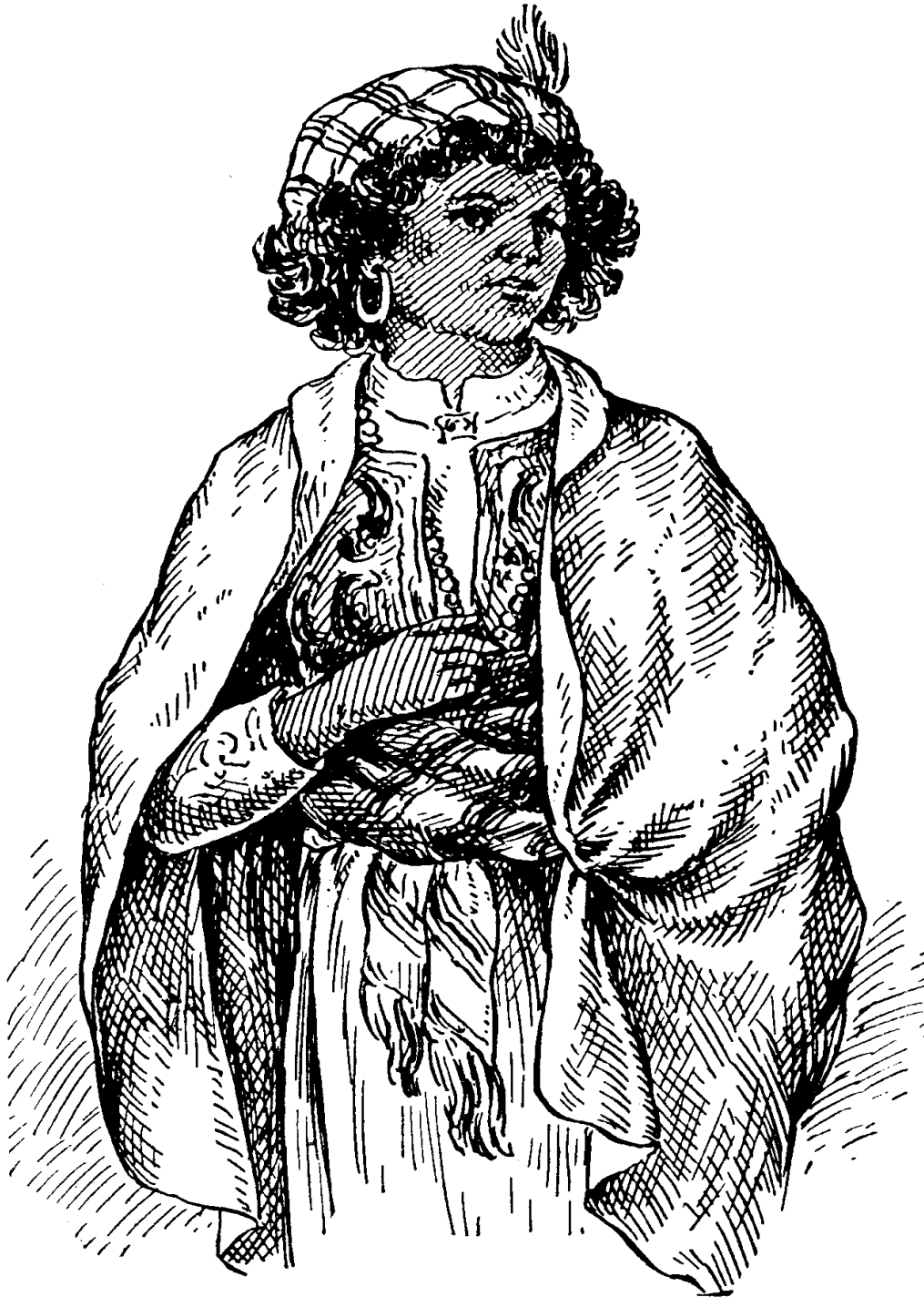
THE PRINCE OF MOROCCO.