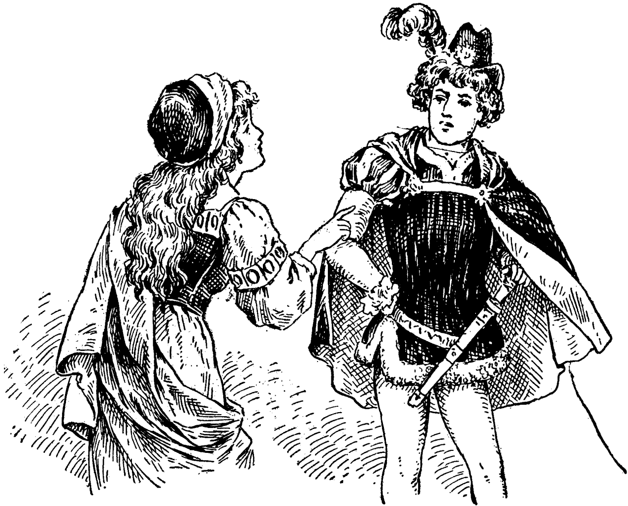
LUCIANA AND ANTIPHOLUS OF SYRACUSE.