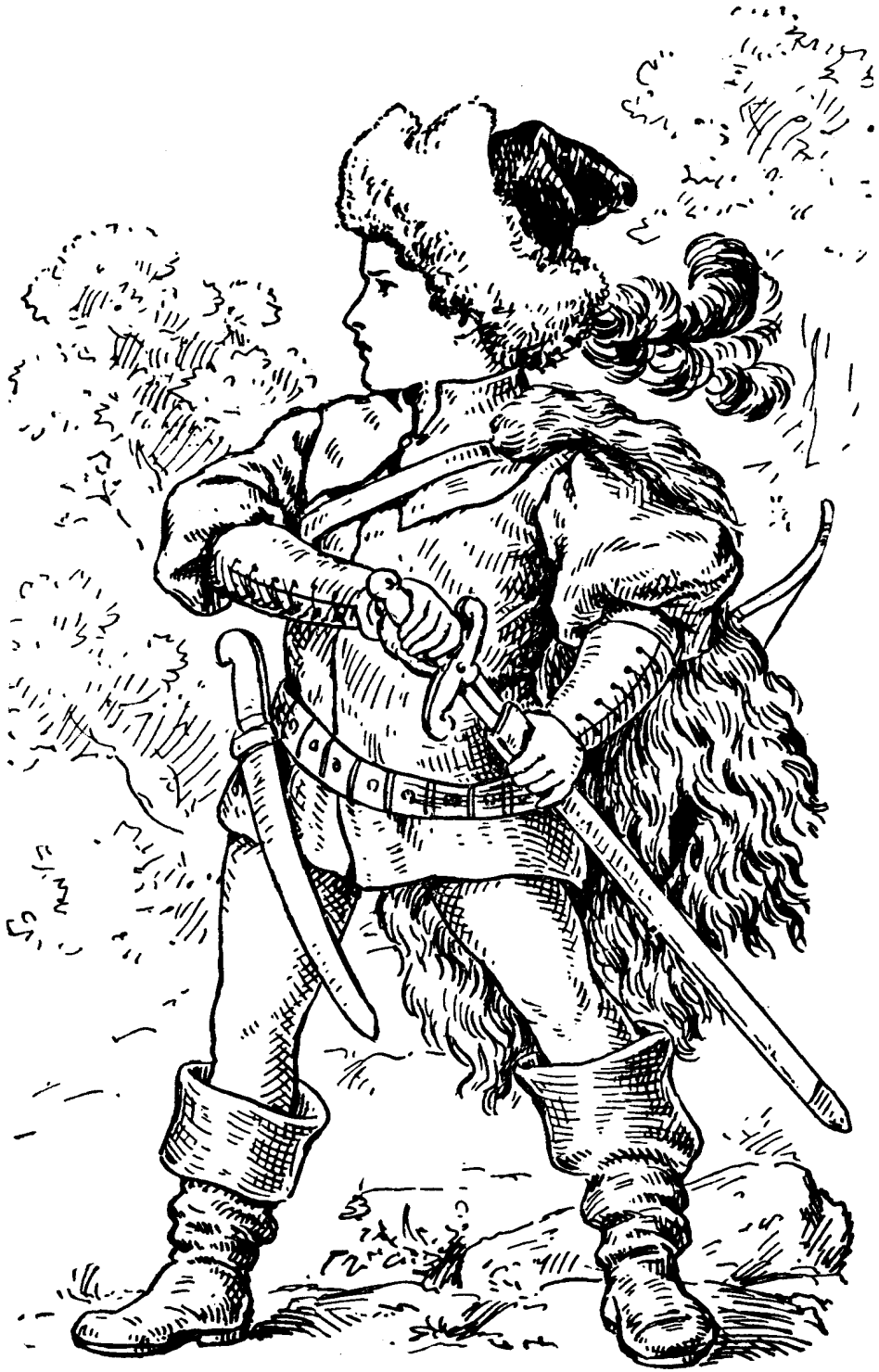
ONE OF THE OUTLAWS.