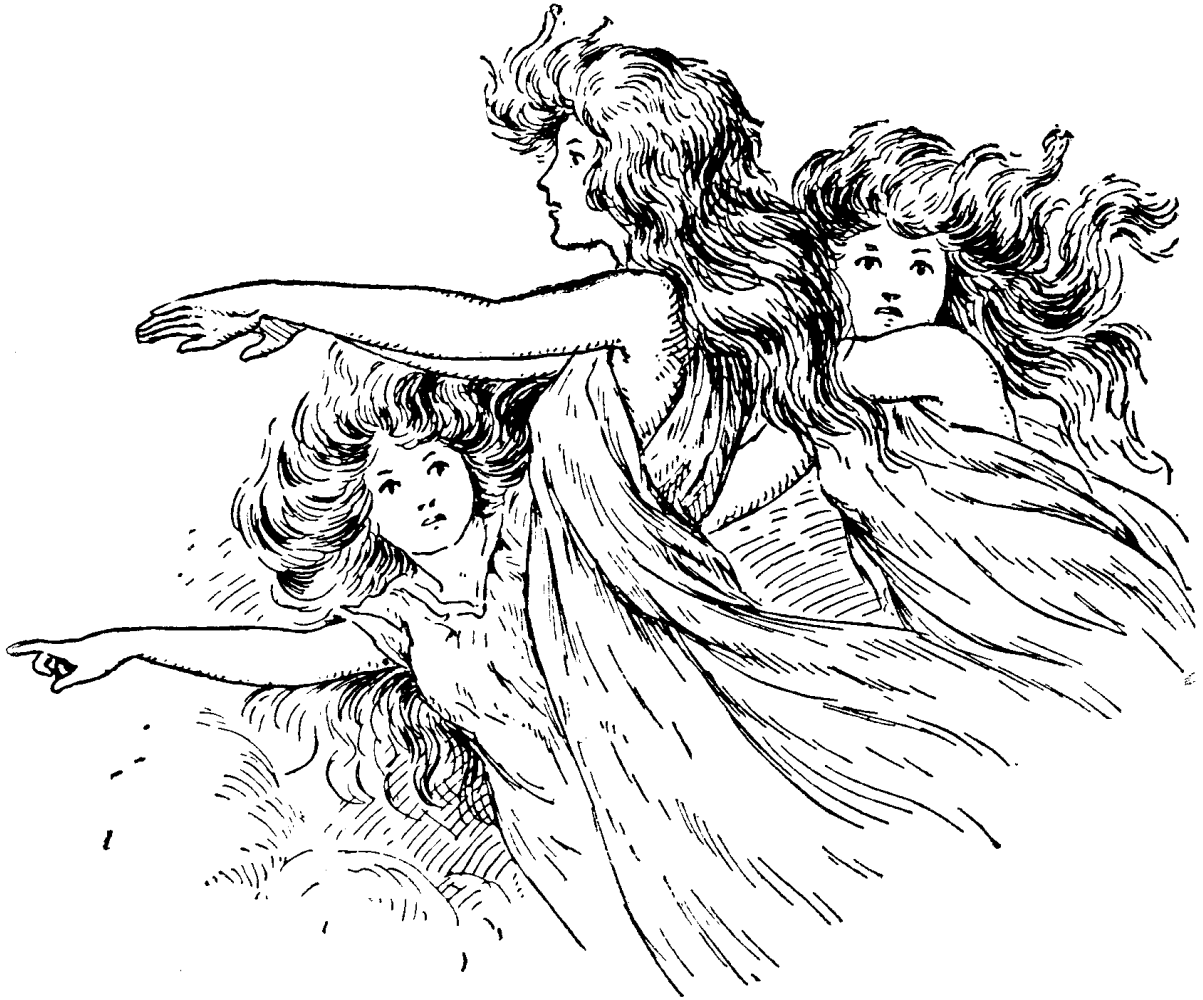
THE THREE WITCHES.