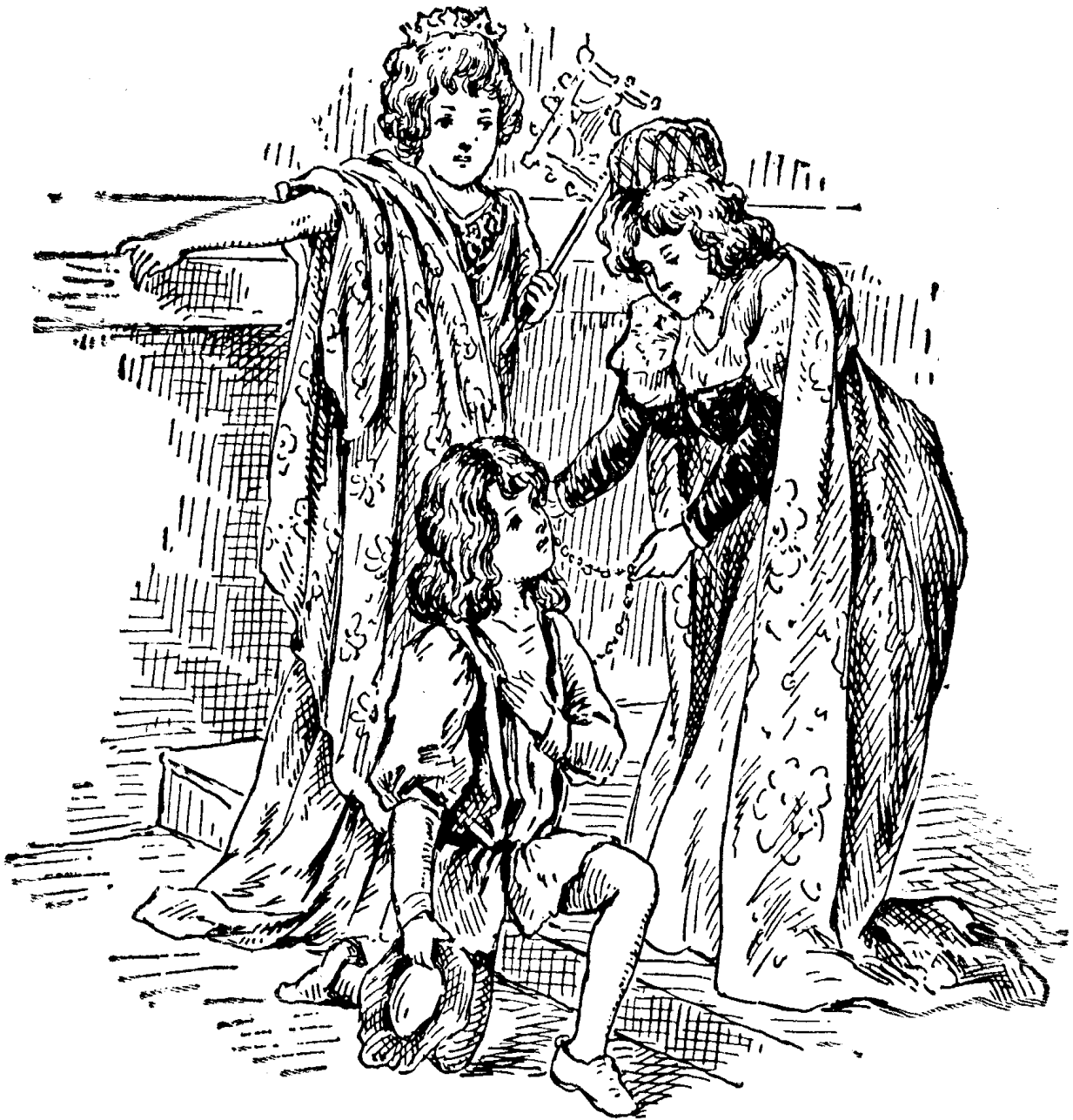
ROSALIND GIVES ORLANDO A CHAIN.