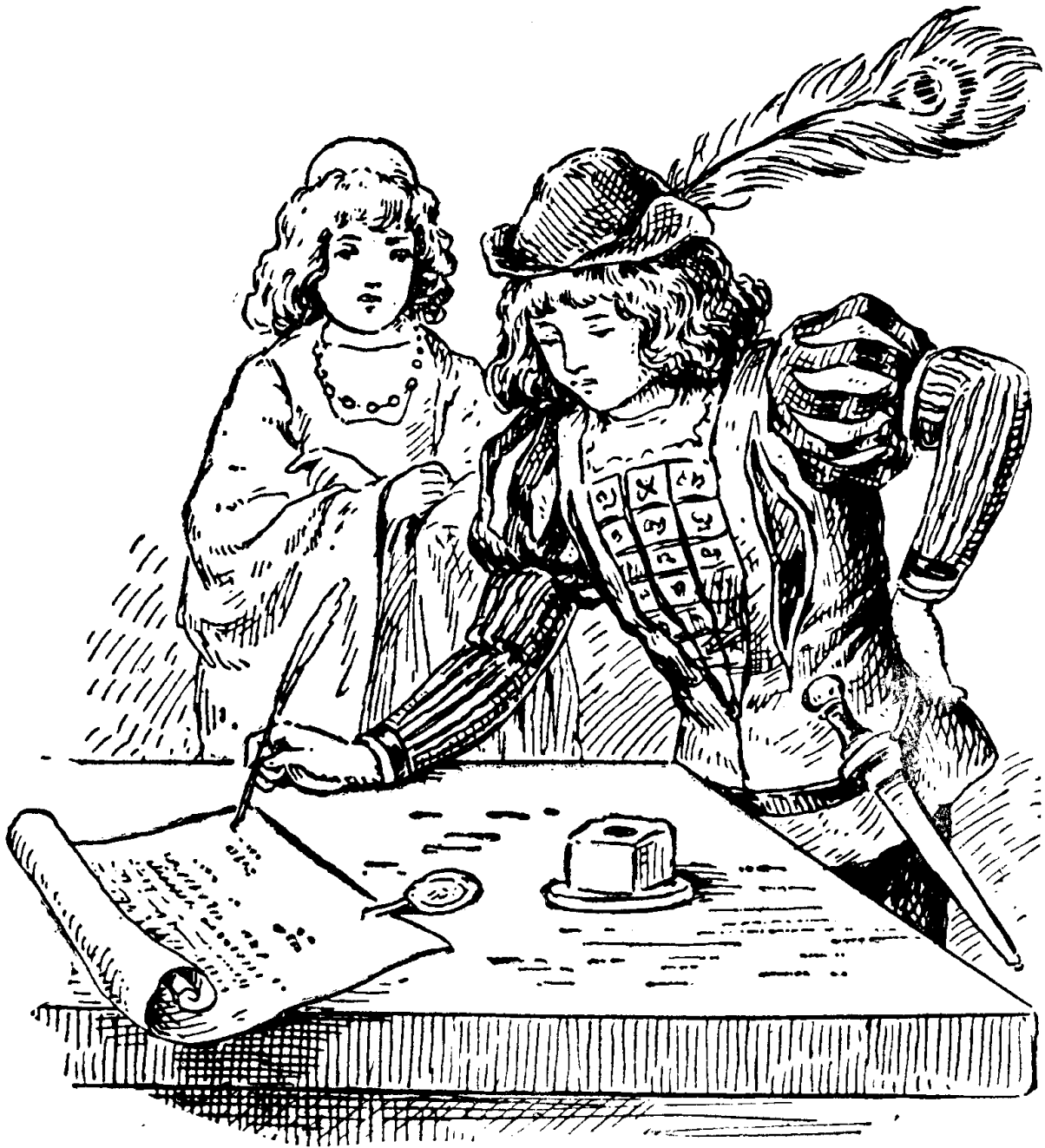
ANTONIO SIGNS THE BOND.