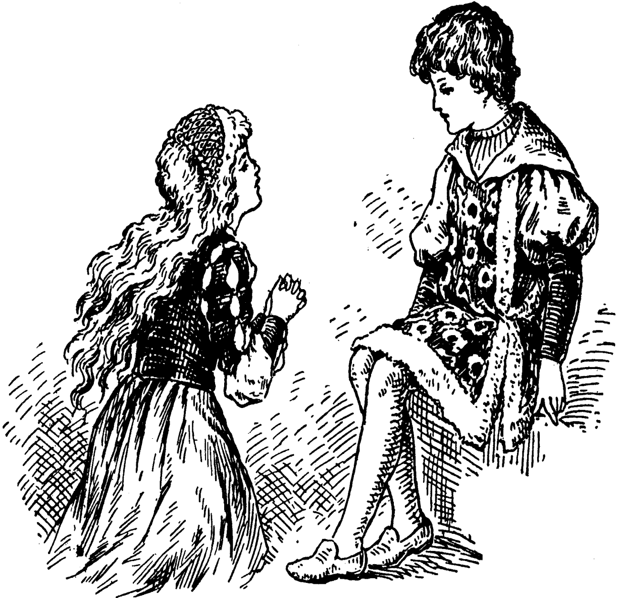
ISABELLA PLEADS WITH ANGELO.