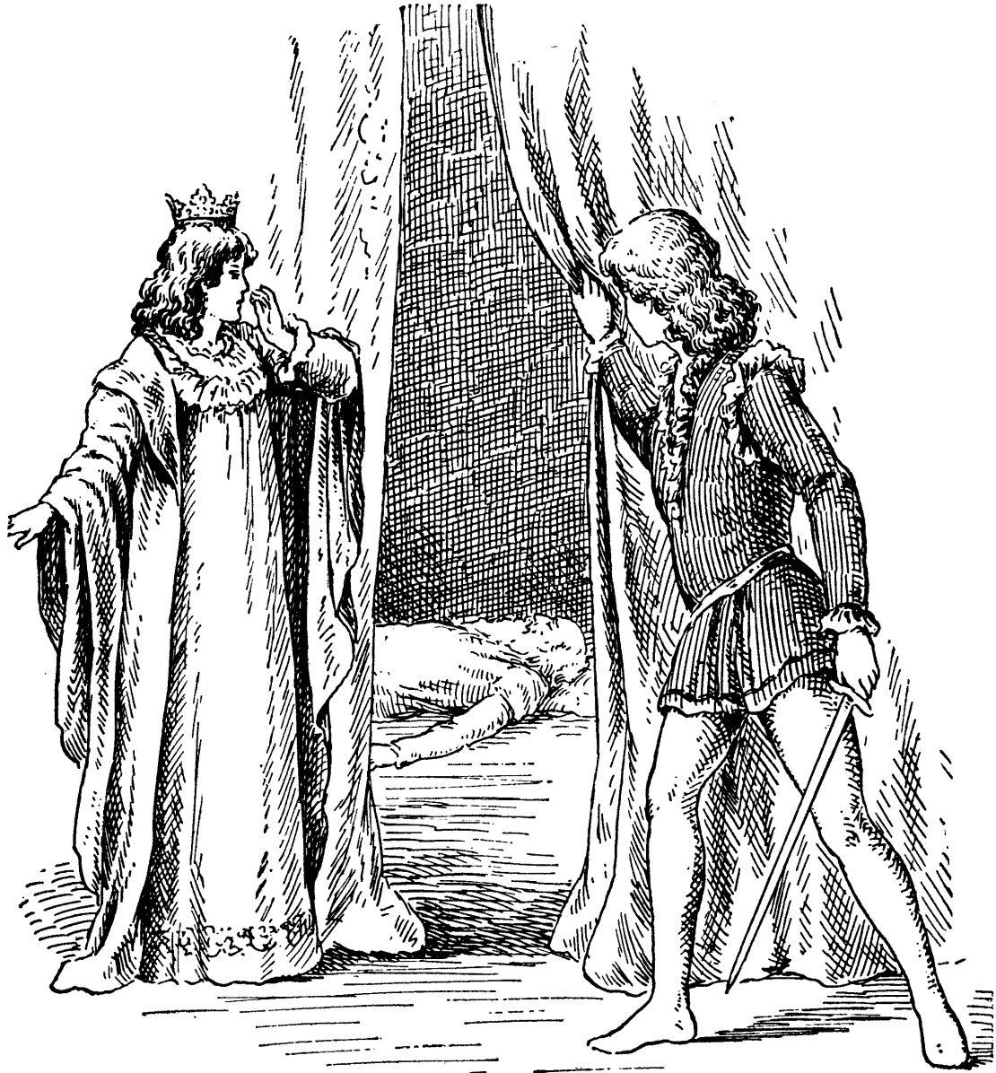
POLONIUS KILLED BY HAMLET.