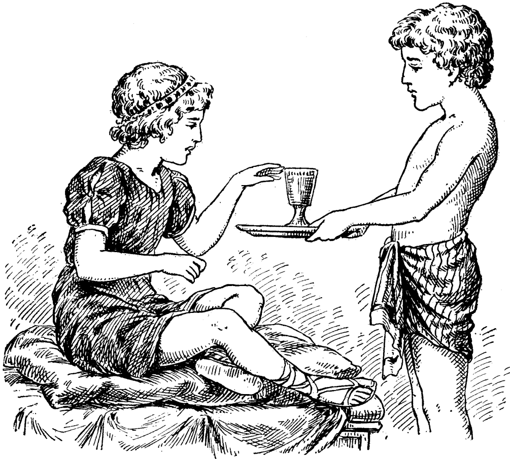
ANTIPHOLUS AND DROMIO.