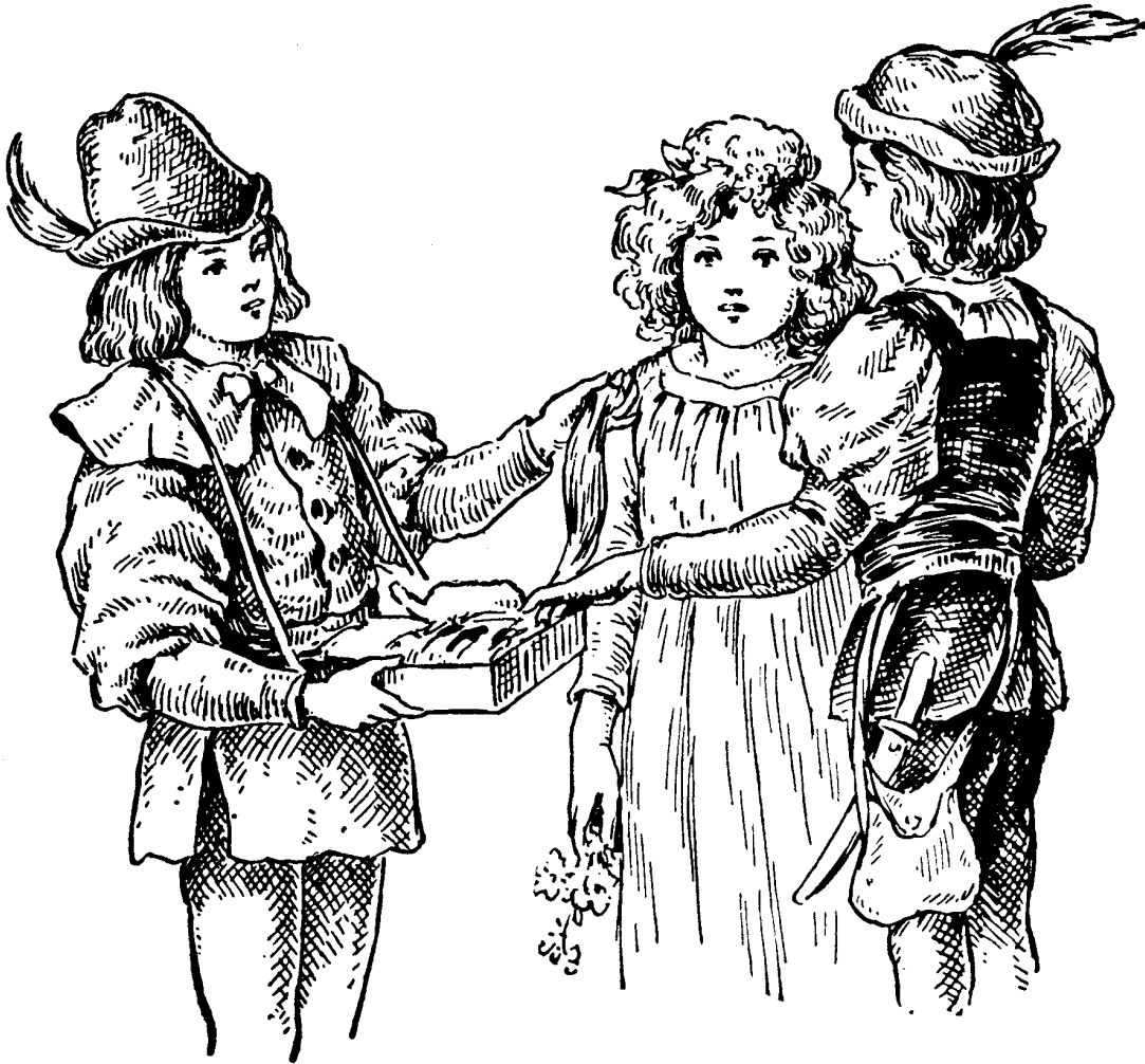
LEONTES RECEIVING FLORIZEL AND PERDITA.