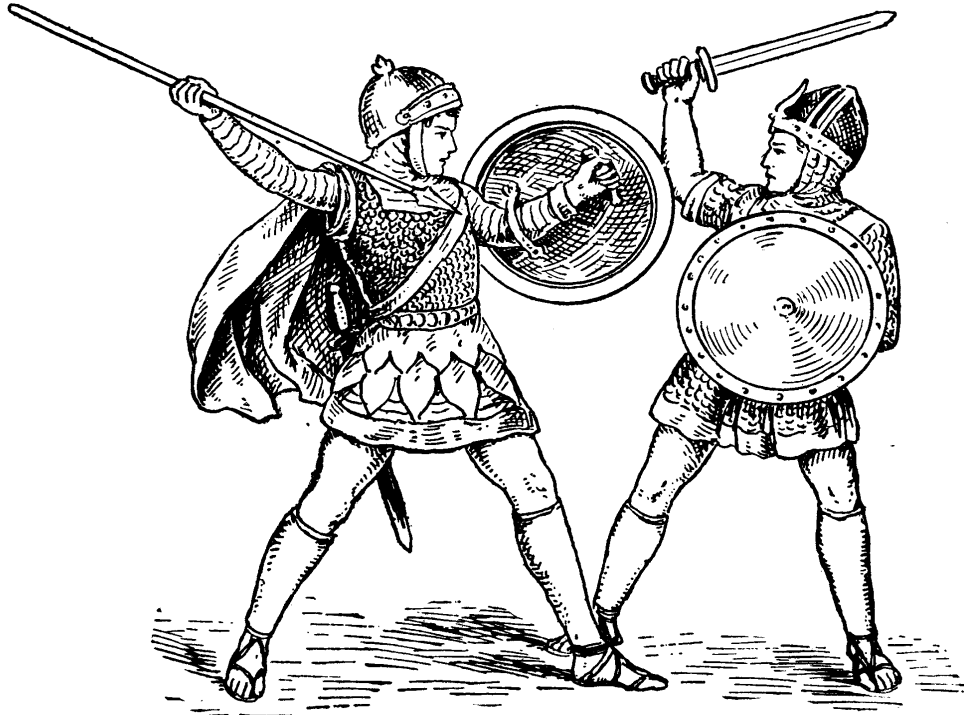
MACBETH AND MACDUFF FIGHT.