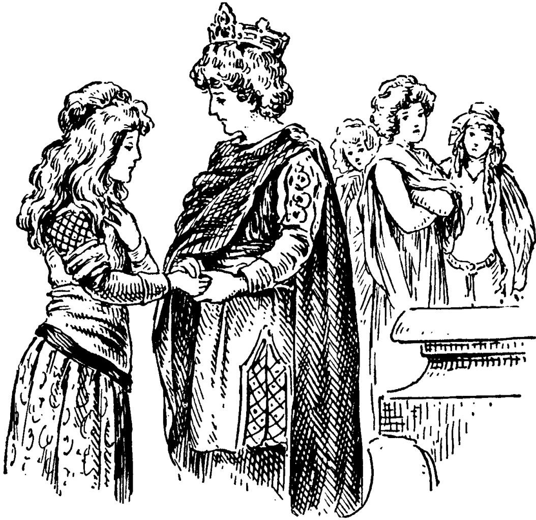
CORDELIA AND THE KING OF FRANCE.