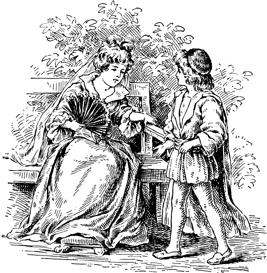
VIOLA AS "CESARIO" MEETS OLIVIA.