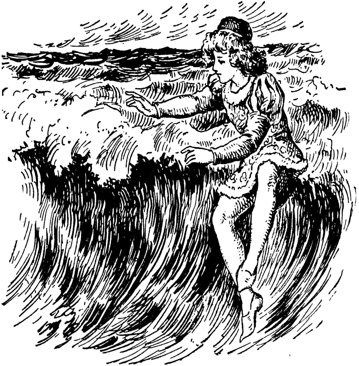
PRINCE FERDINAND IN THE SEA.