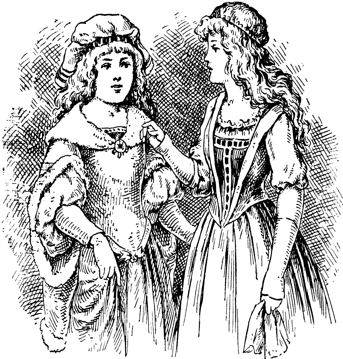
HELENA AND THE WIDOW.