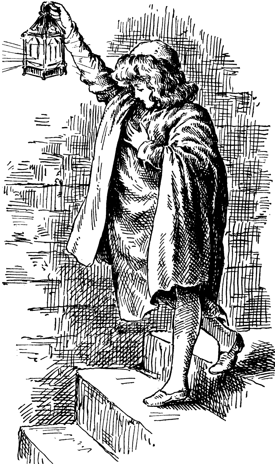
ROMEO ENTERING THE TOMB.