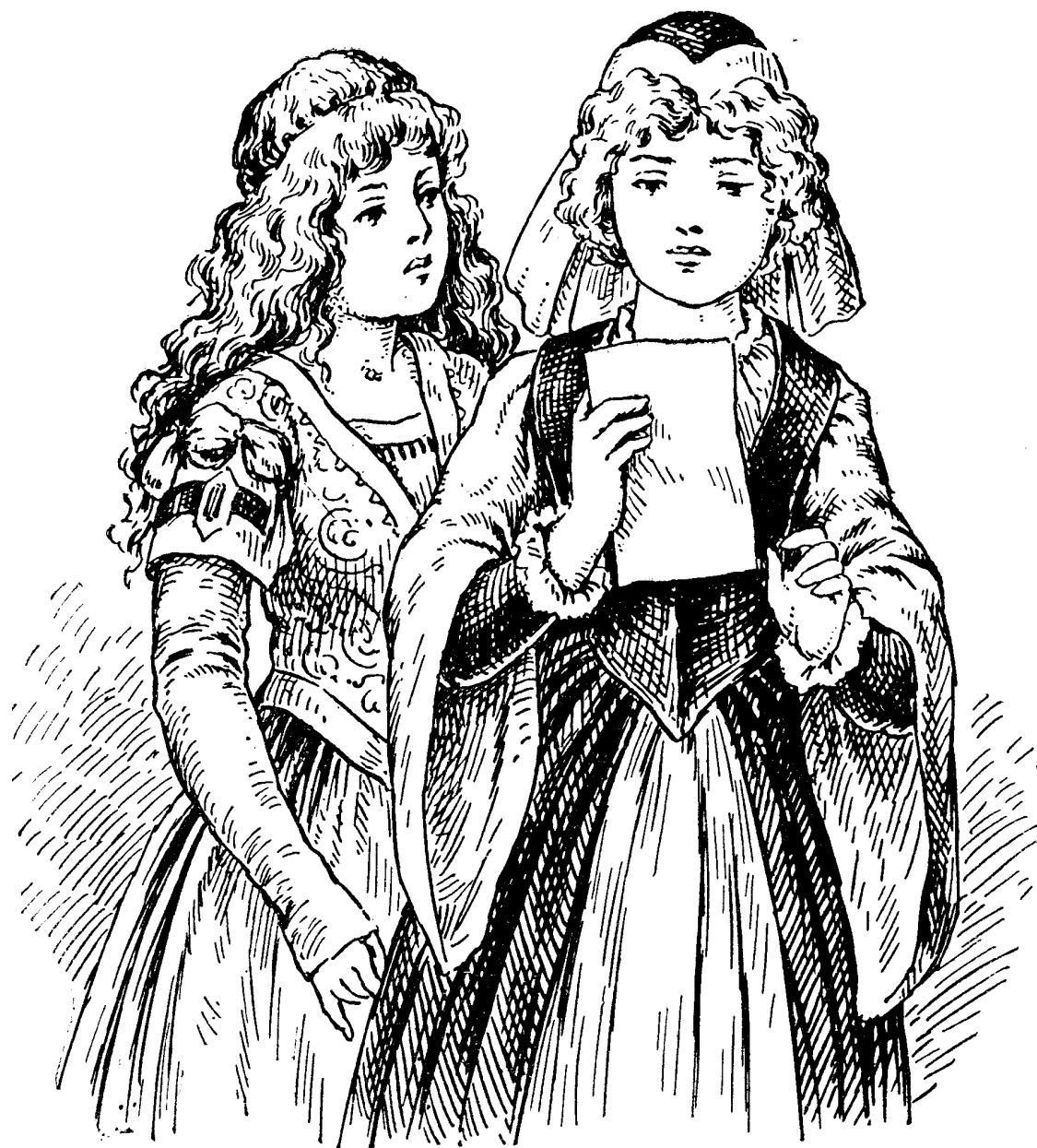
READING BERTRAM'S LETTER.