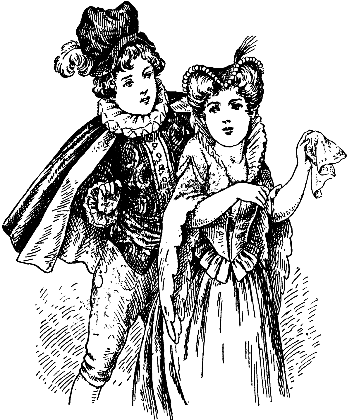
CASSIO GIVES BIANCA THE HANDKERCHIEF.