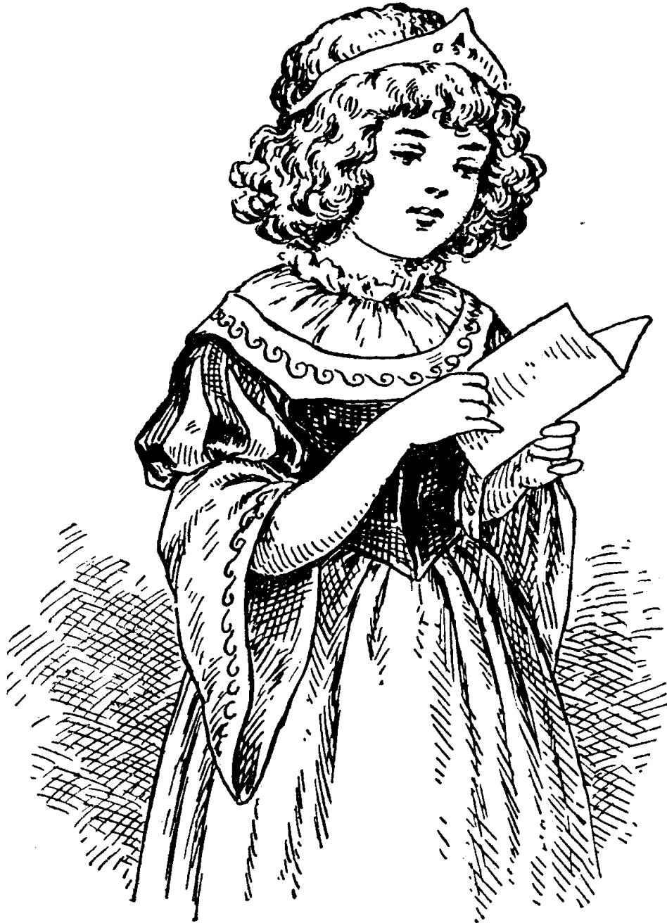
SILVIA READING THE LETTER.