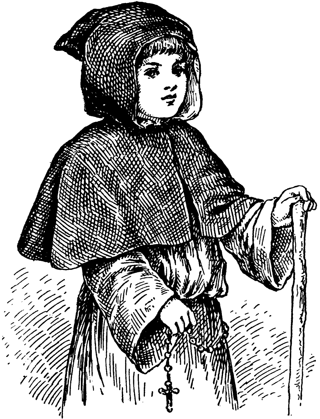
THE DUKE IN THE FRIAR'S DRESS.