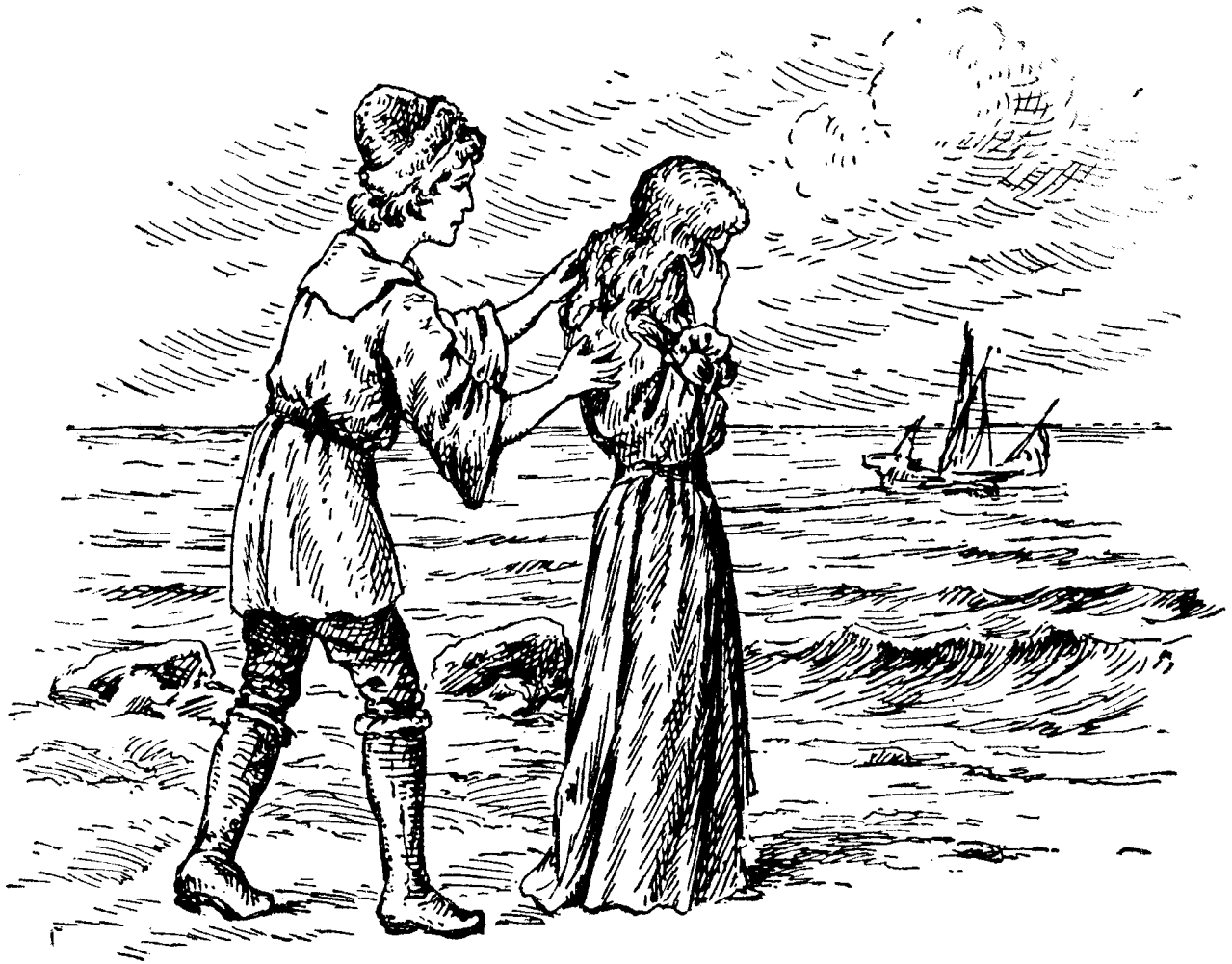
VIOLA AND THE CAPTAIN.