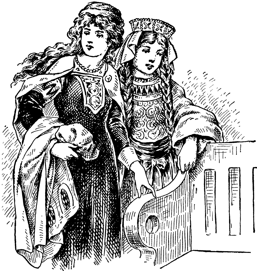
GONERIL AND REGAN.