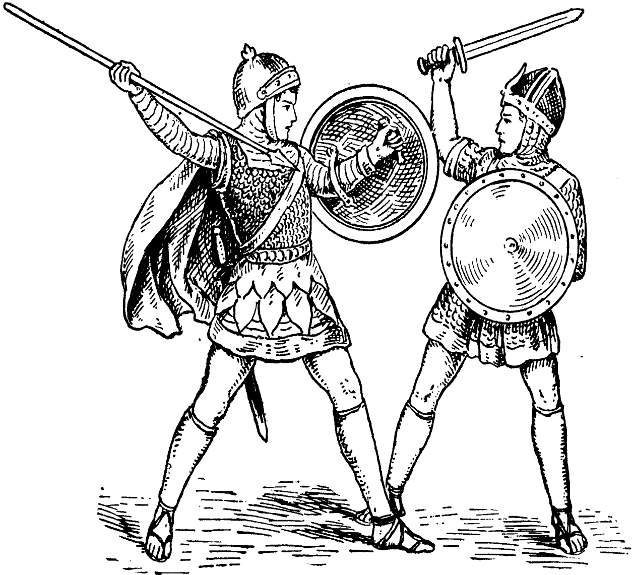
MACBETH AND MACDUFF FIGHT.