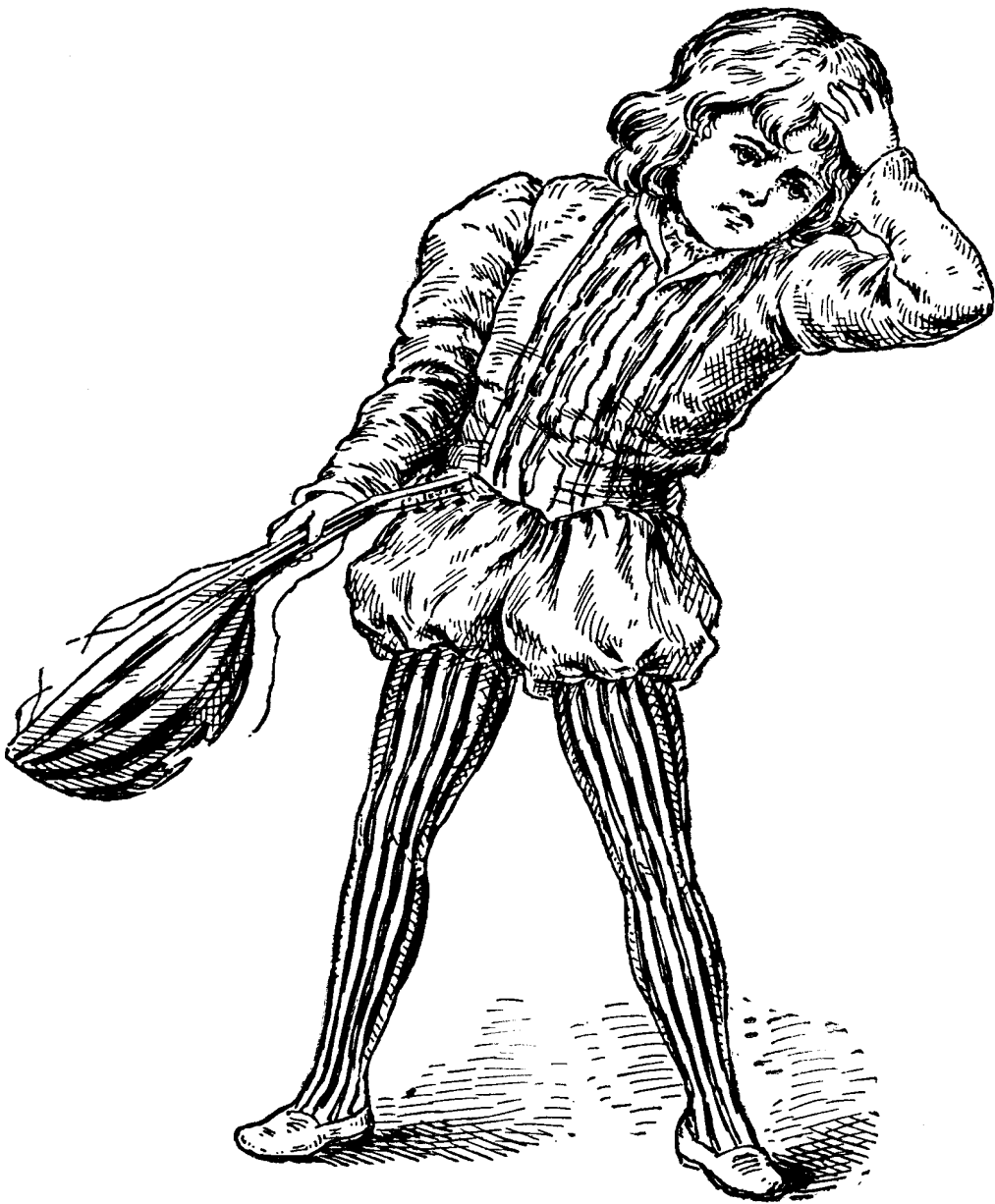
THE MUSIC MASTER.