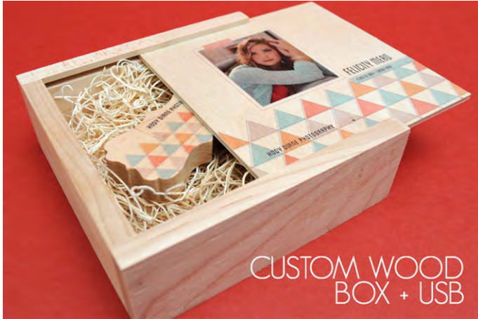
CUSTOM WOOD BOX + USB