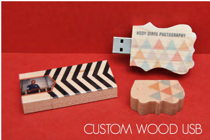
CUSTOM WOOD USB

Schelle' Photography is pleased to offer these products for all of your photographic needs. Contact us at schellephotography@gmail.com or 410.929.3232 for pricing information.