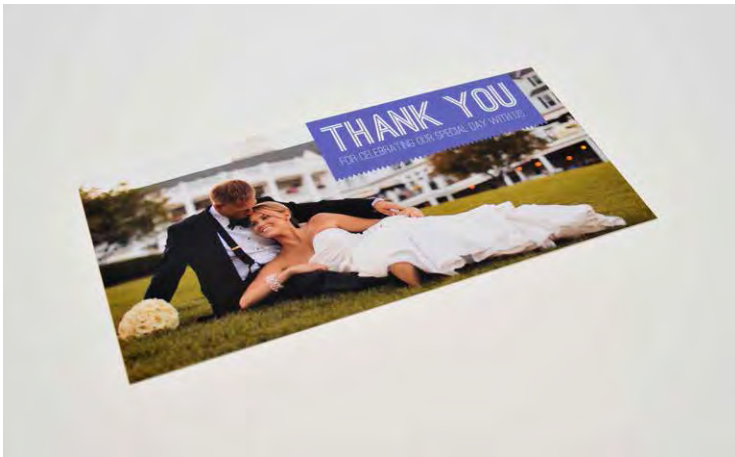
Photo Greeting Cards

Holidays, special celebrations, senior announcements, wedding and other thank you's. Photo Greeting Cards personalize a message like nothing else can.