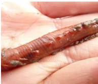
Oncologists Freak Out Over True Cause of Cancer