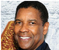
Our Hearts Go Out To Denzel Washington