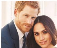
Sad News For Meghan Markle And Prince Harry