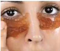
1 Simple Trick Removes Eye Bags & Lip Lines in Seconds