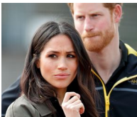
Sad News For Royal Family