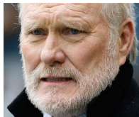
Terry Bradshaw Confirms Unfortunate News