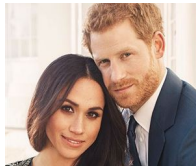
Our Hearts Go Out To Meghan Markle