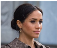
Sad News For Meghan Markle And Prince Harry