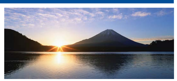
Presentation and disclosures