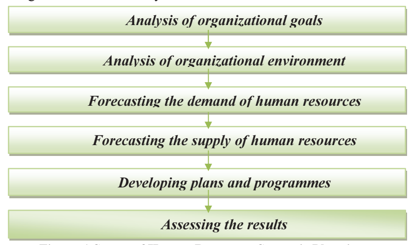
Fig. no.1 Stages of Human Resources Strategic Planning

The main steps to be taken in the process of human resources strategic planning are: a) analysis of organizational goals