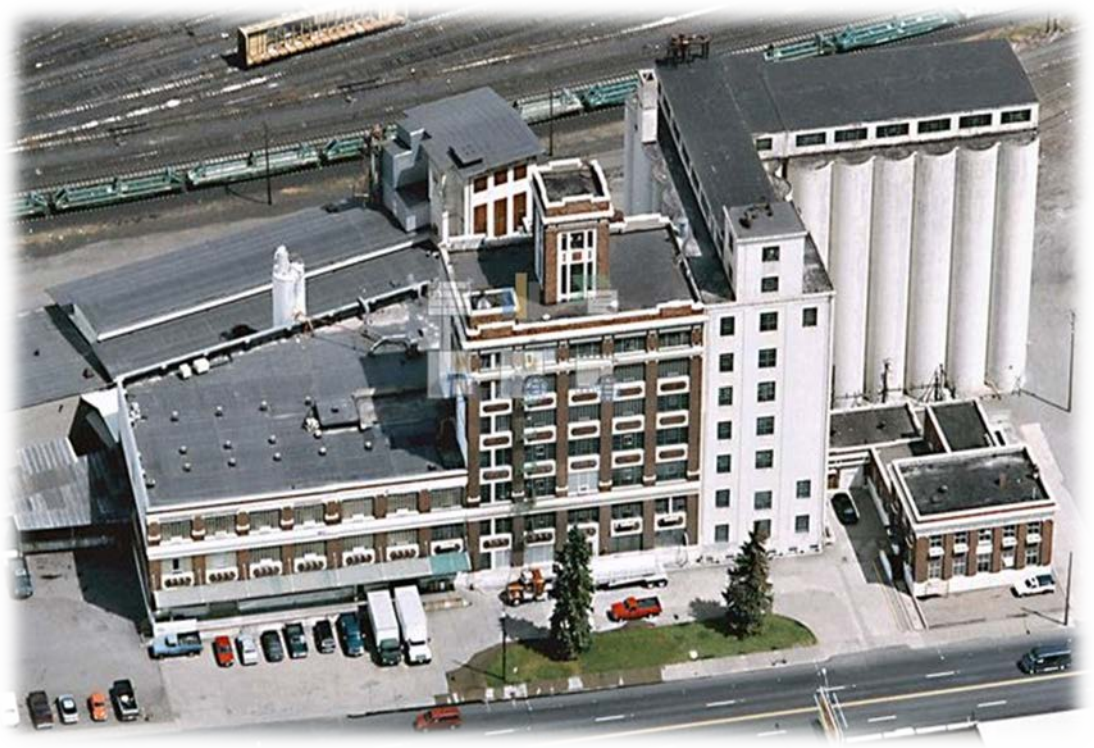
ADM Spokane Mix Plant, Spokane, WA