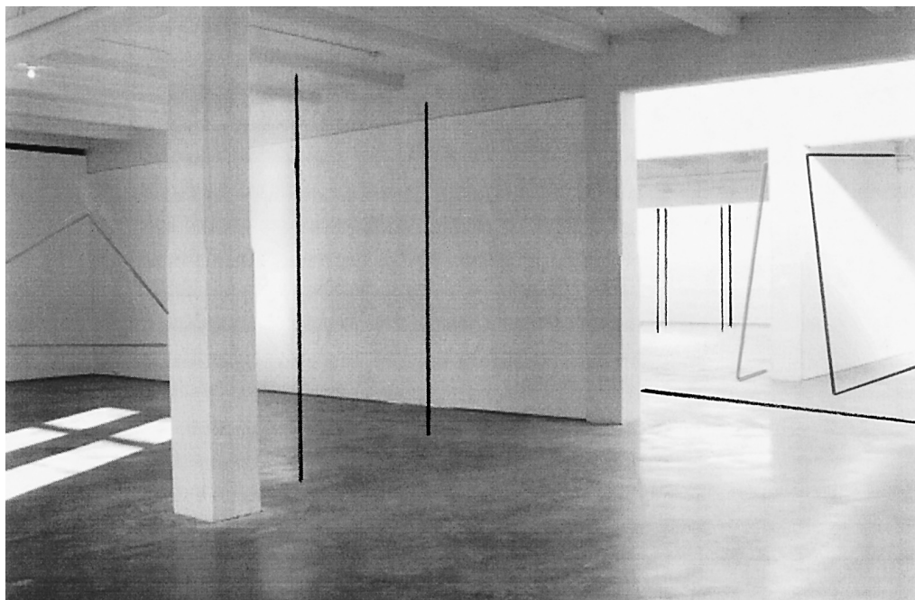
Fred Sandback. Installation drawing for Dia:Beacon, Riggio Galleries, 2003.