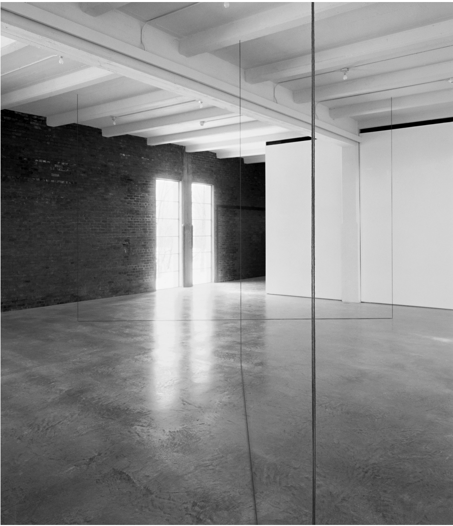
Fred Sandback. Untitled (from Ten Vertical Constructions) , 1977. Two-part vertical construction, red (variation). Installation view at Dia:Beacon, Riggio Galleries.

and thus come to function as “cultural capital,” existing as products “of domination predisposed to express or legitimate domination.” In societies with little or no class differentiation, on the other hand,