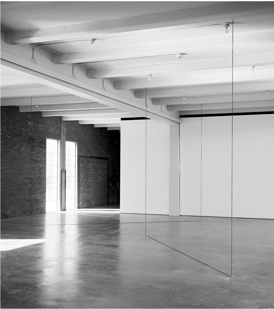
Fred Sandback. Untitled (from Ten Vertical Constructions ), 1977. Two-part vertical construction, red (variation). Installation view at Dia:Beacon, Riggio Galleries.

work so simply, to do so little, to restrict oneself to such modest means and such a limited formal vocabulary, over such a long period of time, is itself a kind of disappearance. For me, what makes Sandback's work so moving is not that he did so much with so little, but that he did so little.